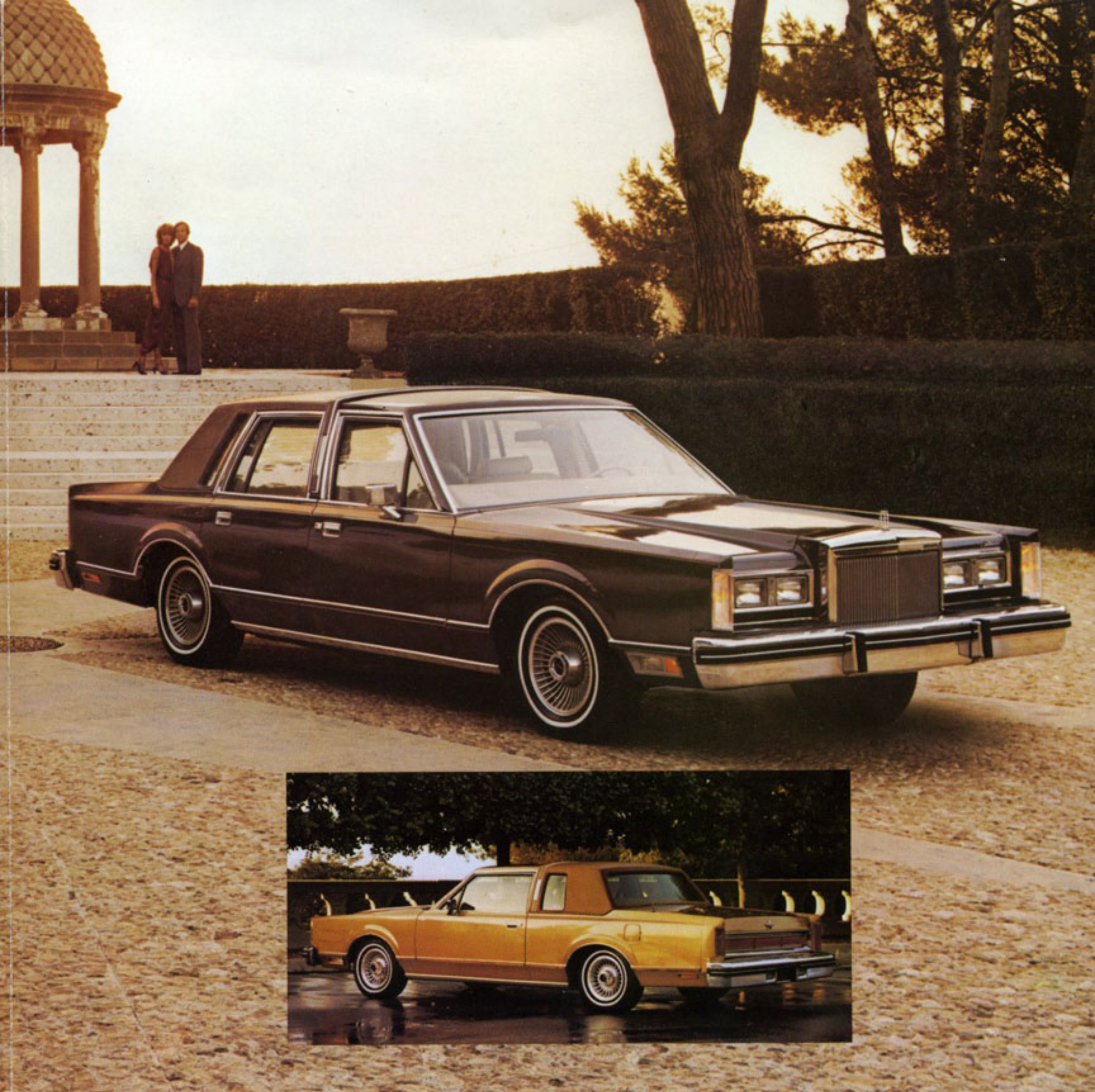
Lincoln Continental four-door Sedan

doors and decklid by means of push buttons is just one of a wealth of options that can be yours for 1980.