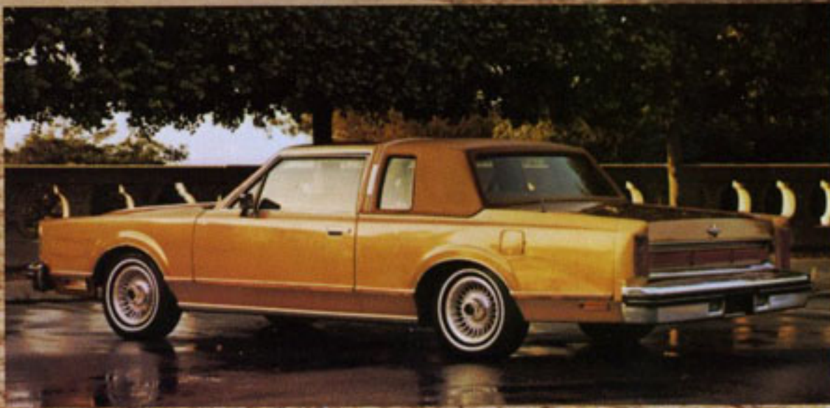
Lincoln Continental Towne Coupé

Enter the luxurious world of Lincoln Continental or Continental Mark VI, and discover the ultimate in style and elegance for 1980.