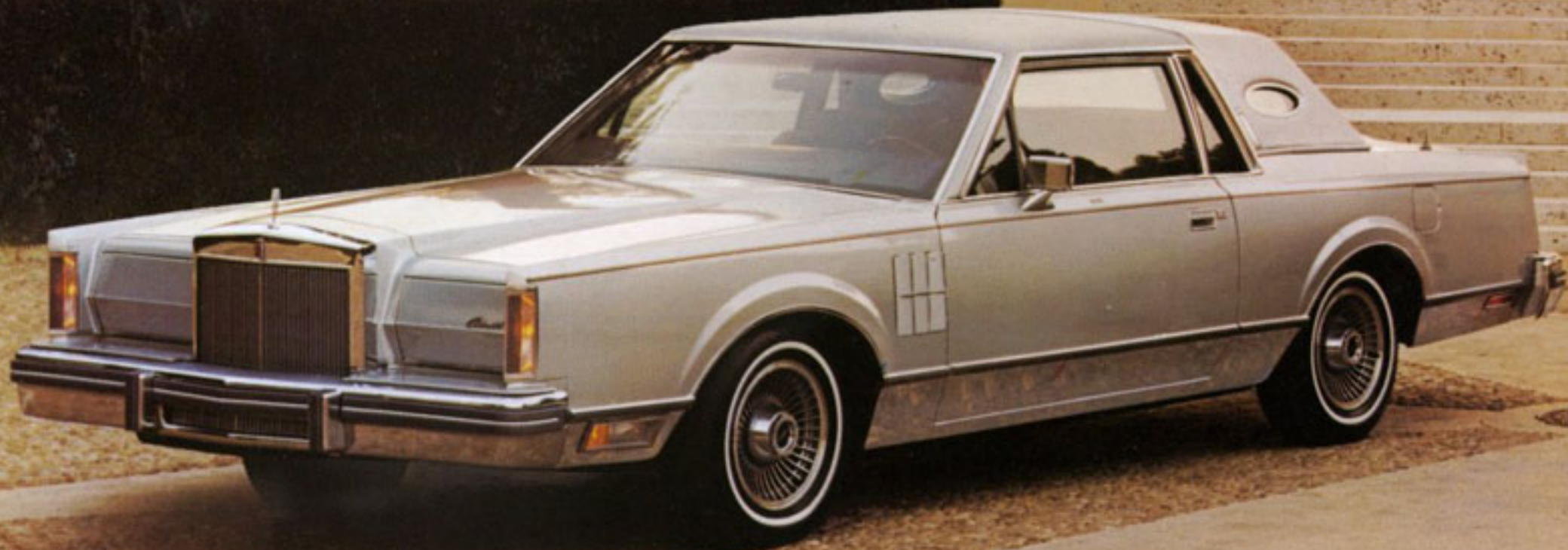
Continental Mark VI two-door