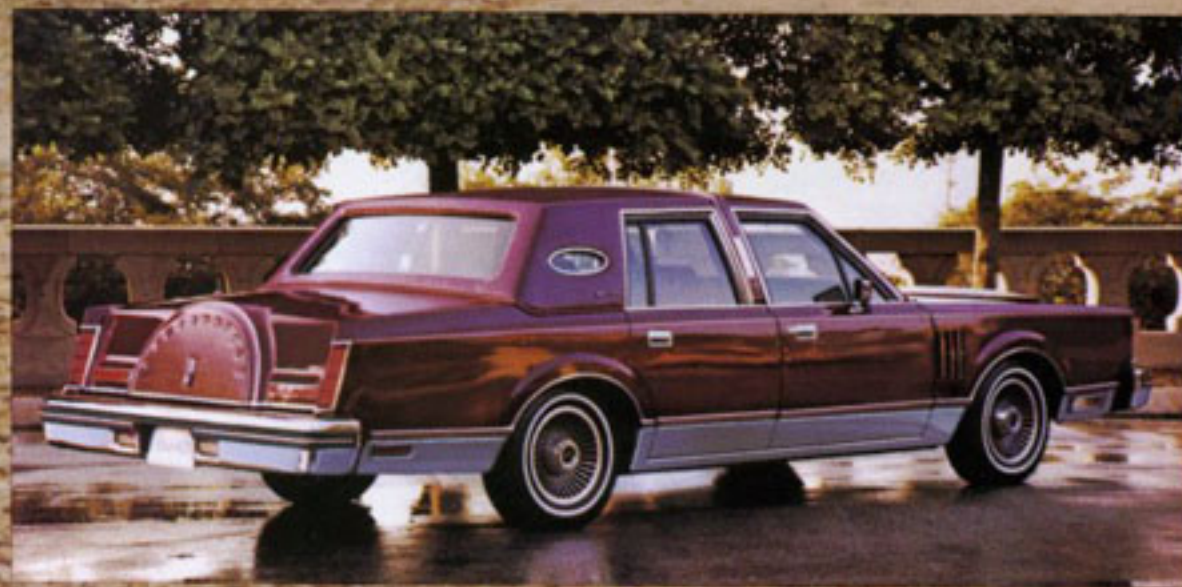
Continental Mark VI four-door (Signature Series)