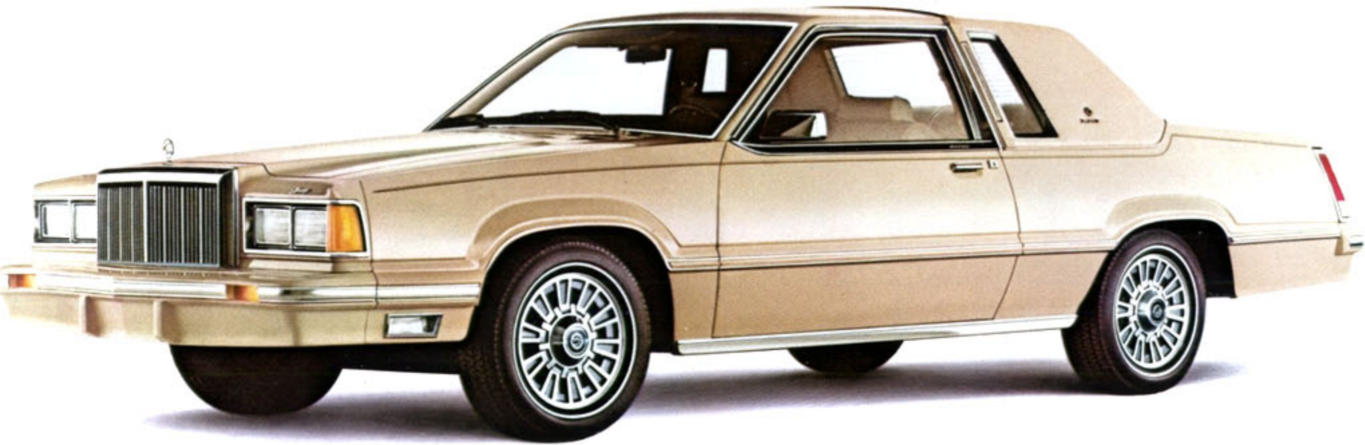
COUGAR XR-7 GS, in Fawn, with optional half-vinyl luxury roof, TR-type tires, and aluminum wheels.