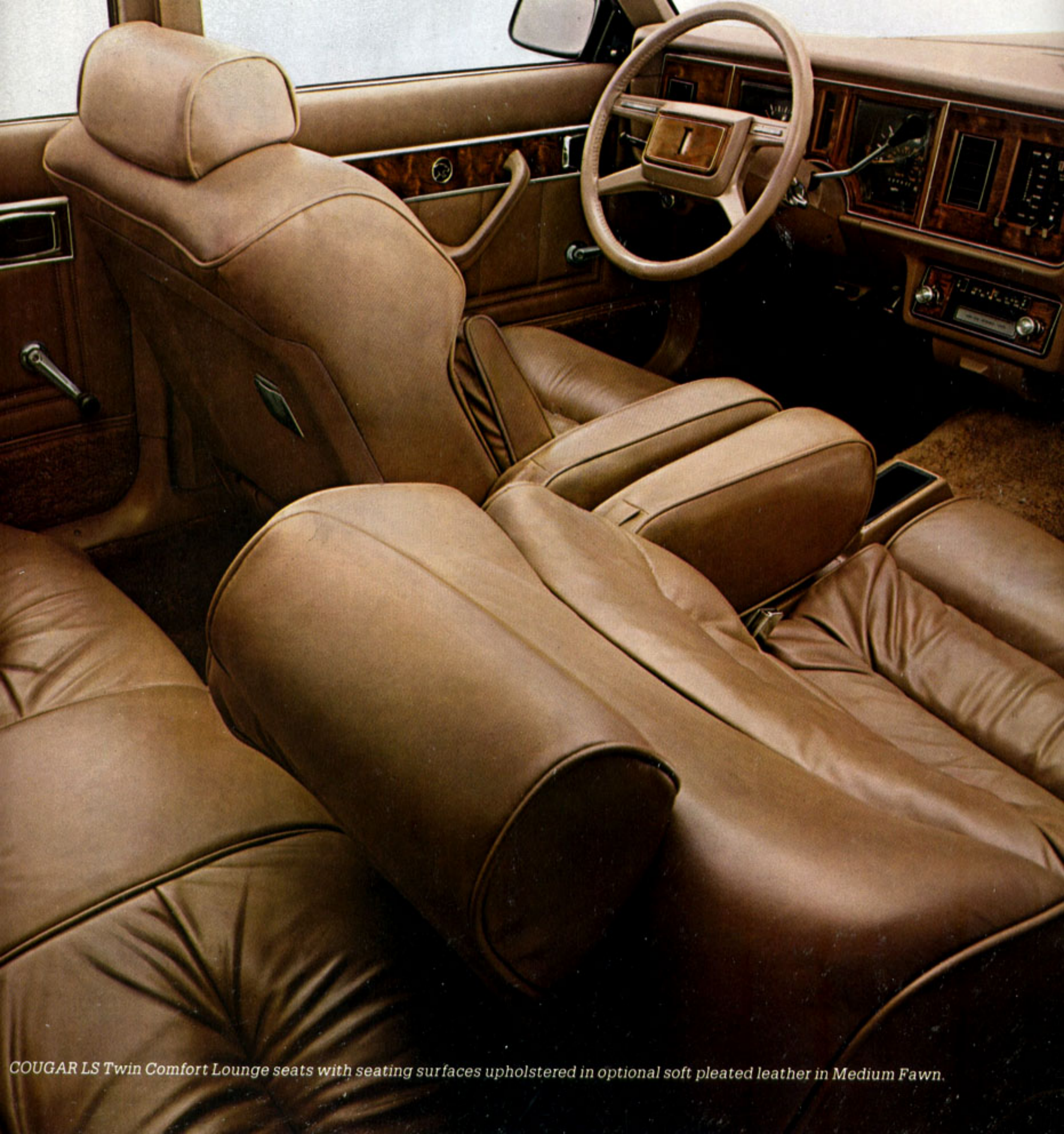
COUGAR LS Twin Comfort Lounge seats with seating surfaces upholstered in optional soft pleated leather in Medium Fawn.