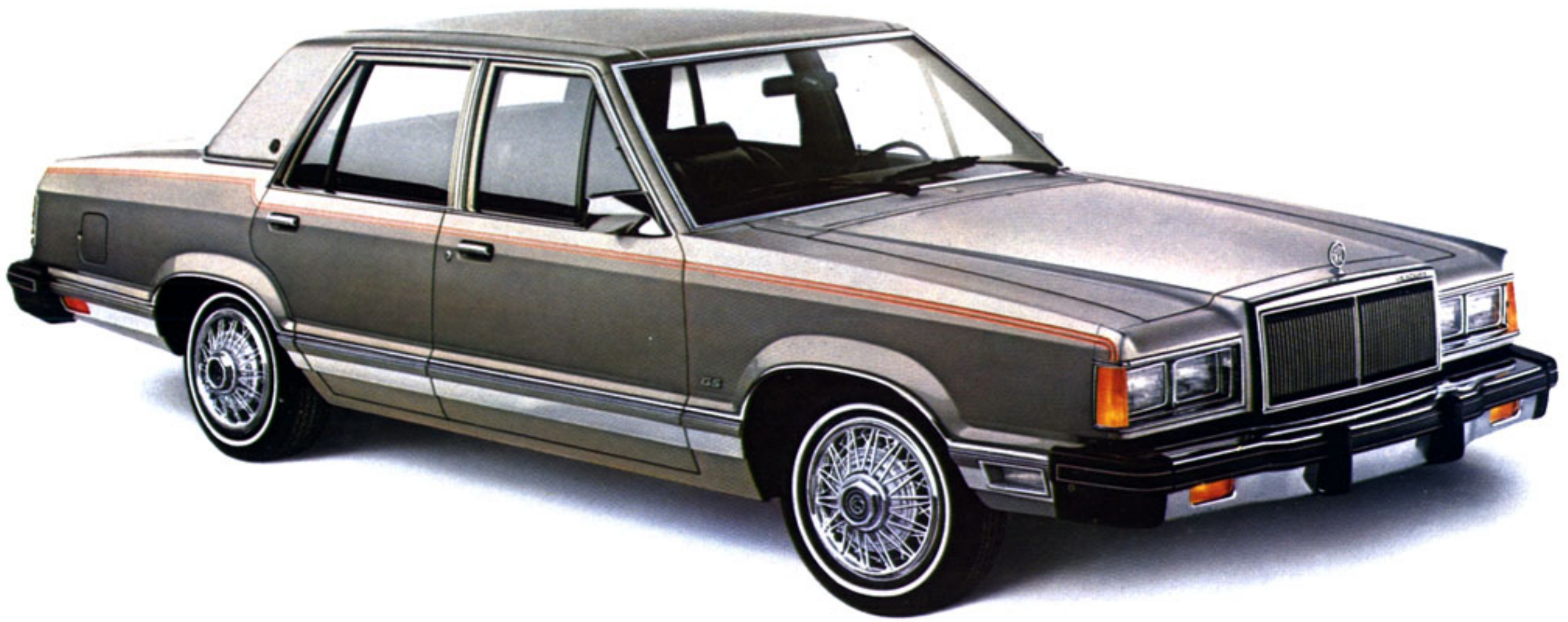
COUGAR GS four-door, in optional Tu-Tone Light Pewter Metallic/Medium Pewter Metallic, with optional Light Pewter vinyl roof and wire wheel covers. COUGAR two-door, in Antique Cream with optional Dark Brown vinyl roof and standard wheel covers.