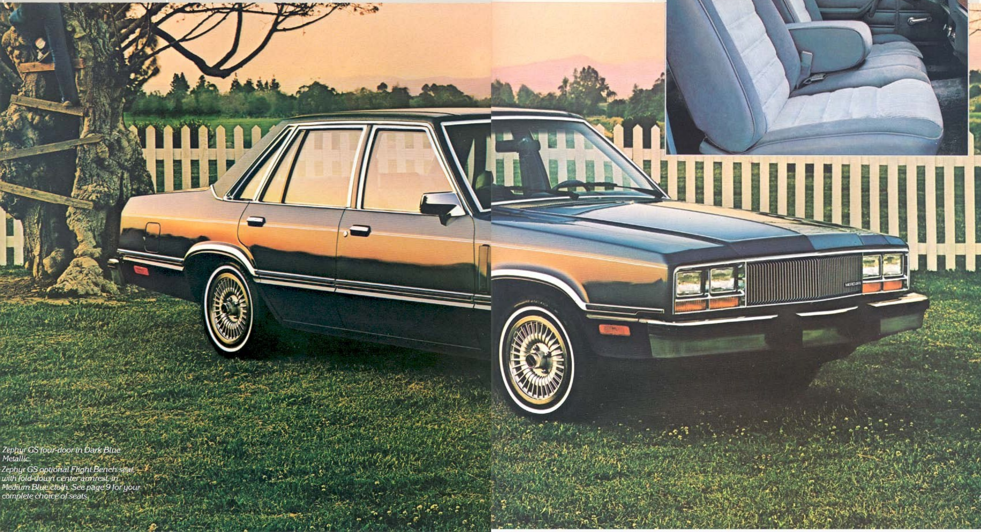
Zephyr GS four-door in Dark Blue Metallic.