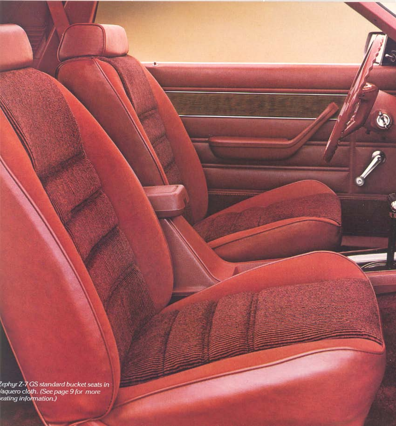
Zephyr Z-7 GS standard bucket seats in vaquero cloth. (See page 9 for more seating information.)

The Zephyr Z-7. Puts a little more Z-est in your life.