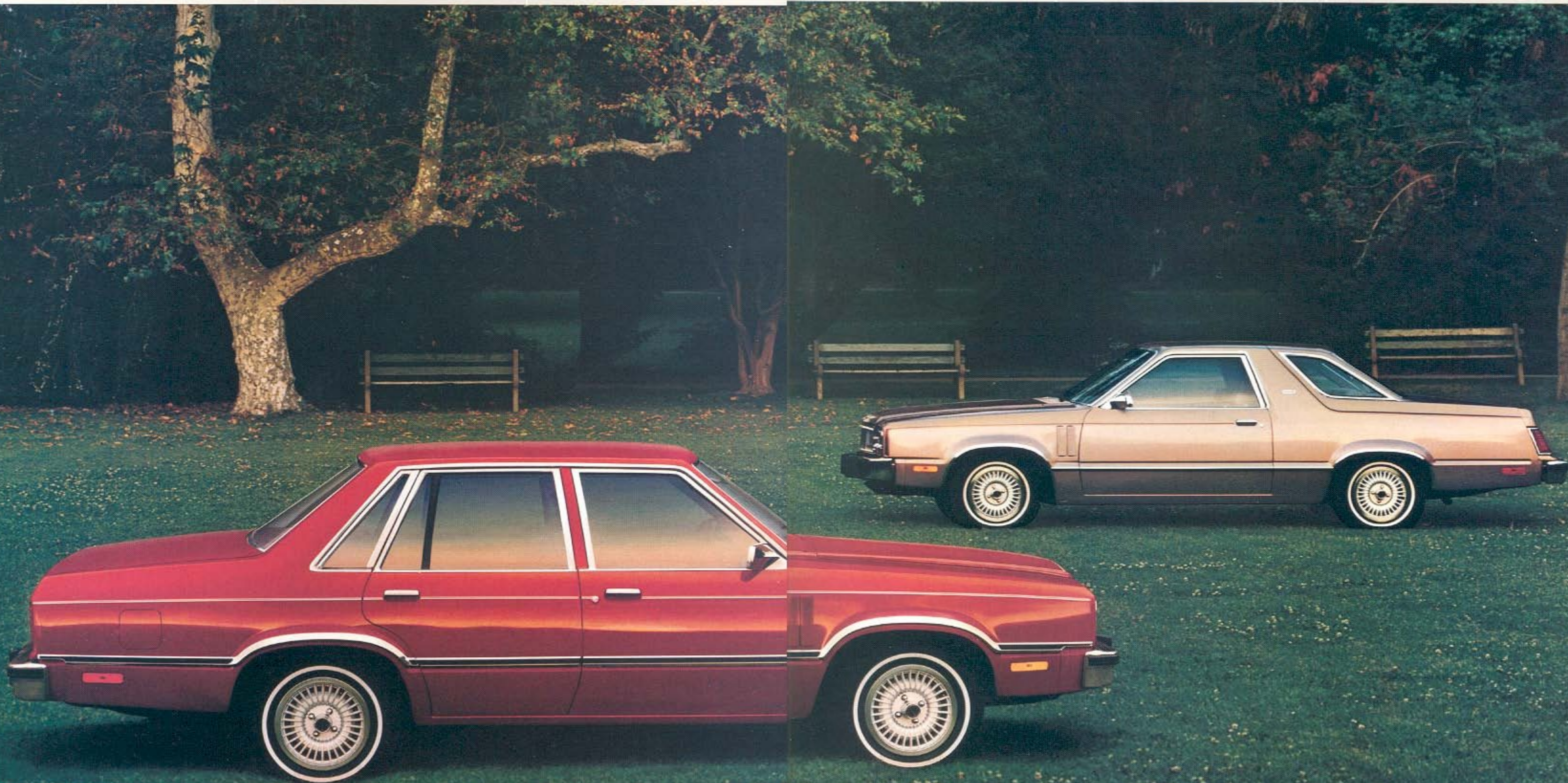
In the foreground: '82 Zephyr GS four-door in Medium Red. Background: Zephyr Z-7 in Fawn.

Some of the equipment shown may be available only at extra cost, and only on specific models. Please see pages 8 through 11 for specific information regarding standard and optional equipment.