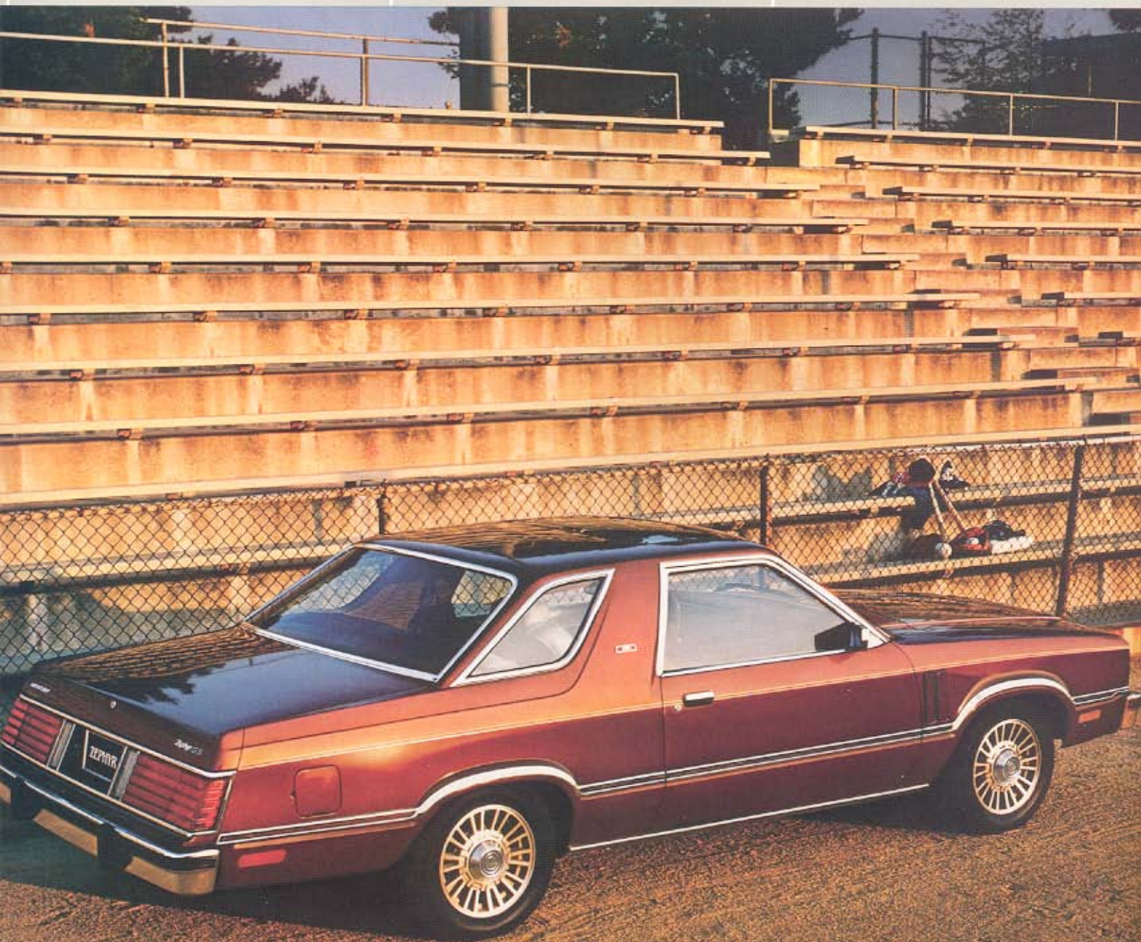
Zephyr Z-7 GS in Medium Vaquero Metallic over Dark Cordovan Metallic, with optional Flip-Up/Open Air Roof.

Inside, there's generous space in this sporty, personal-size car. And a number of thoughtful touches, such as tinted rear window glass and deluxe seat belts with