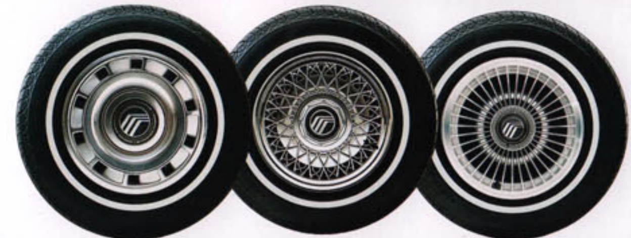
Left to right: full wheel cover, locking wire-style wheel cover, turbine spoke aluminum wheel.