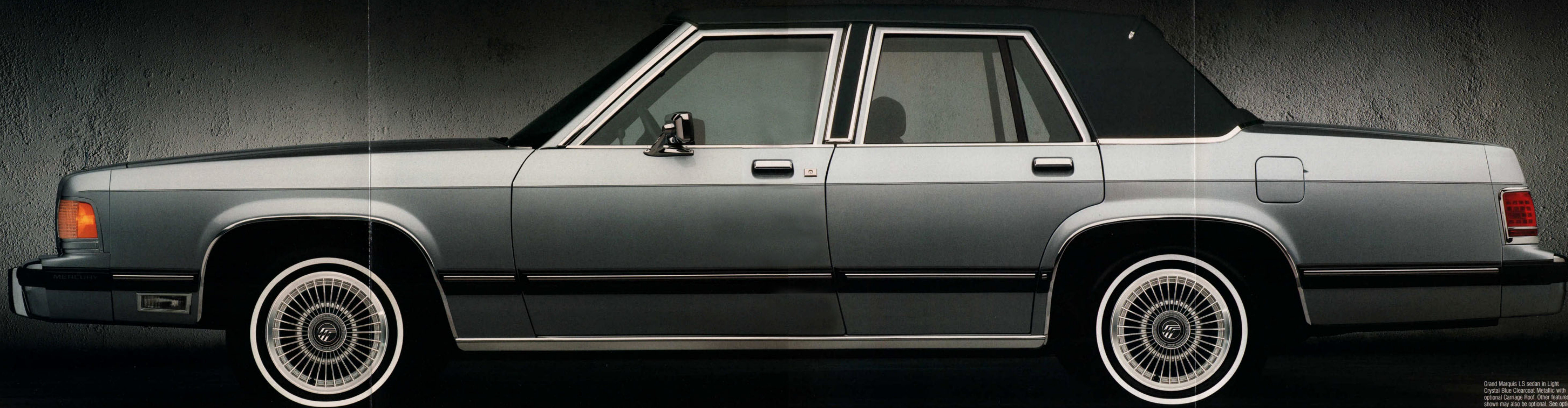
Grand Marquis LS sedan in Light Crystal Blue Clearcoat Metallic with optional Carriage Roof. Other features shown may also be optional. See option list on pages 14 and 15.