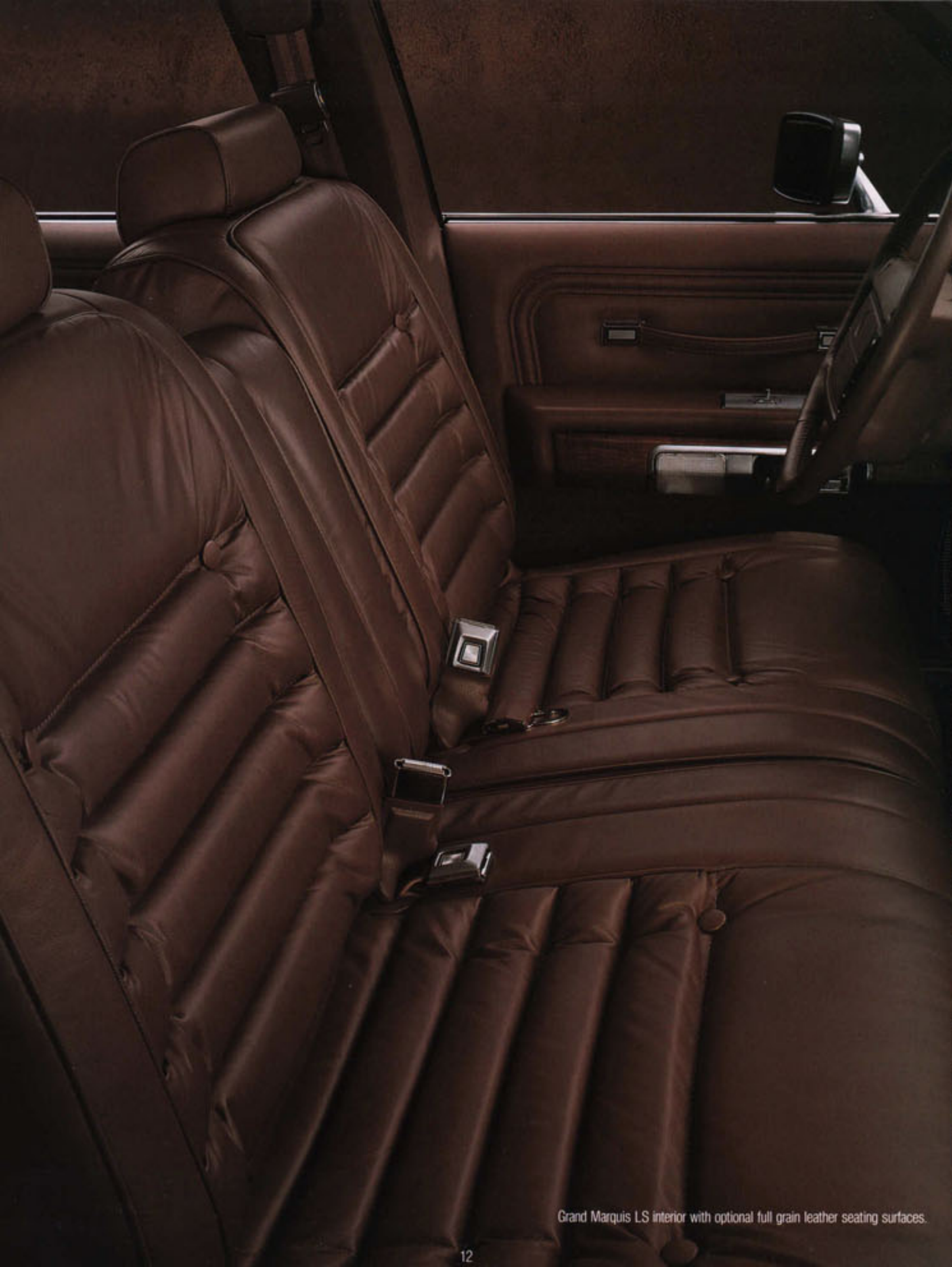
Grand Marquis LS interior with optional full grain leather seating surfaces.