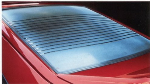
The rear window defroster option enhances visibility by keeping the window clear of frost or mist.