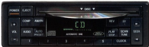
Now available for your listening enjoyment are the extraordinary clarity and performance of Mustang's new 80-watt compact disc player option.