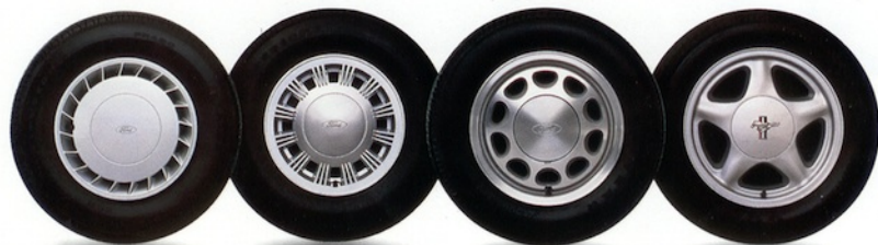
Left to right: tinted wheel cover (standard on LX); styled road wheel (included in LX Preferred Equipment Package); cast aluminum wheel (optional on LX); and 5-spoke cast aluminum wheel (standard on GT and LX 5.0L).