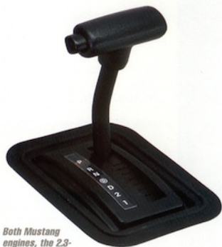
Both Mustang engines, the 2.3- and 5.0-liter, can be teamed with the convenience of an optional floor-mounted automatic overdrive transmission.