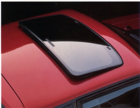
Left: The flip-up open-air roof option, for the hatchback model, lets in extra fresh air (when opened) and more sunshine.

To further personalize your Mustang, choose from the selection of options available separately, some of which are shown here.