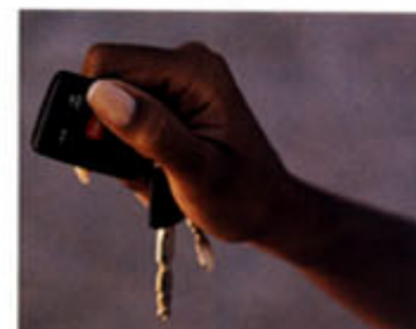
For added security, the remote entry system is included in the optional electronics group (standard with Explorer Limited).