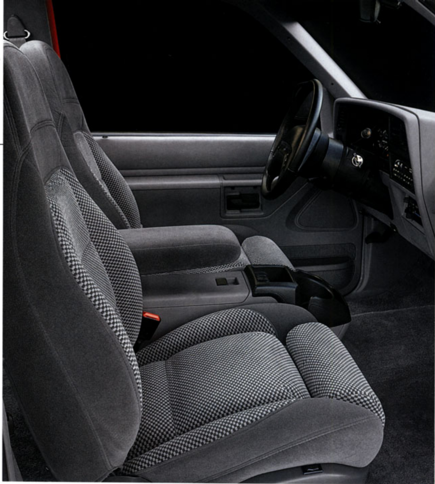
Above: Optional cloth sport bucket seats with console in Opal Grey.