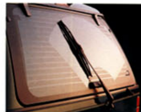
The rear window wiper/washer/defroster (standard on Sport, Eddie Bauer, XLT and Limited) helps clear your view.