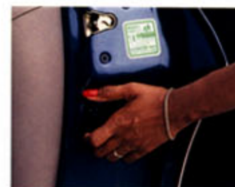
Child-proof rear door locks are standard with 4-door models. When activated, they can't be opened from the inside.