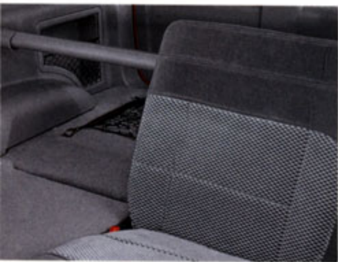
Left: A feature contributing to the Explorer 2-Door's versatility is the 50/50 rear split bench seat. Lower either one or both seat backs.

One thing's sure. With the Sport's power and handling, you're in for fun, whether you're cruising the highway or taking the off-road trails.