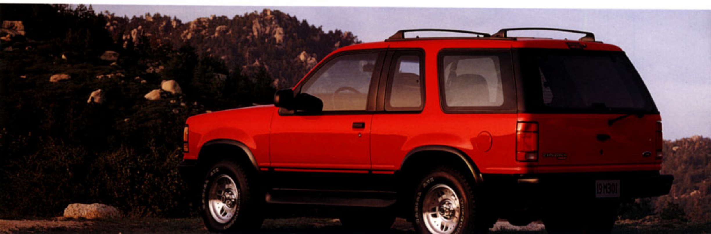
Right and below: Explorer 2-Door Sport in Vibrant Red with unique Black lower two-tone treatment.