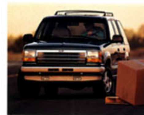
Explorer's 4-wheel anti-lock rear brakes provide greater steering control while braking under certain adverse conditions.

A properly equipped Explorer can tow up to 3,500 pounds with the standard rear step bumper, or a maximum trailer weight of 5,600 pounds (4x2) or 5,400 pounds (4x4). Towing capacity depends on model (2-door or 4-door) and choice of equipment (4x2 or 4x4; transmission; axle ratio; and type of towing receiver or hitch, if any), as well as number of passengers and amount of cargo. Towing hitches and receivers are made by manufacturers other than Ford. For more detailed information, see page 18.