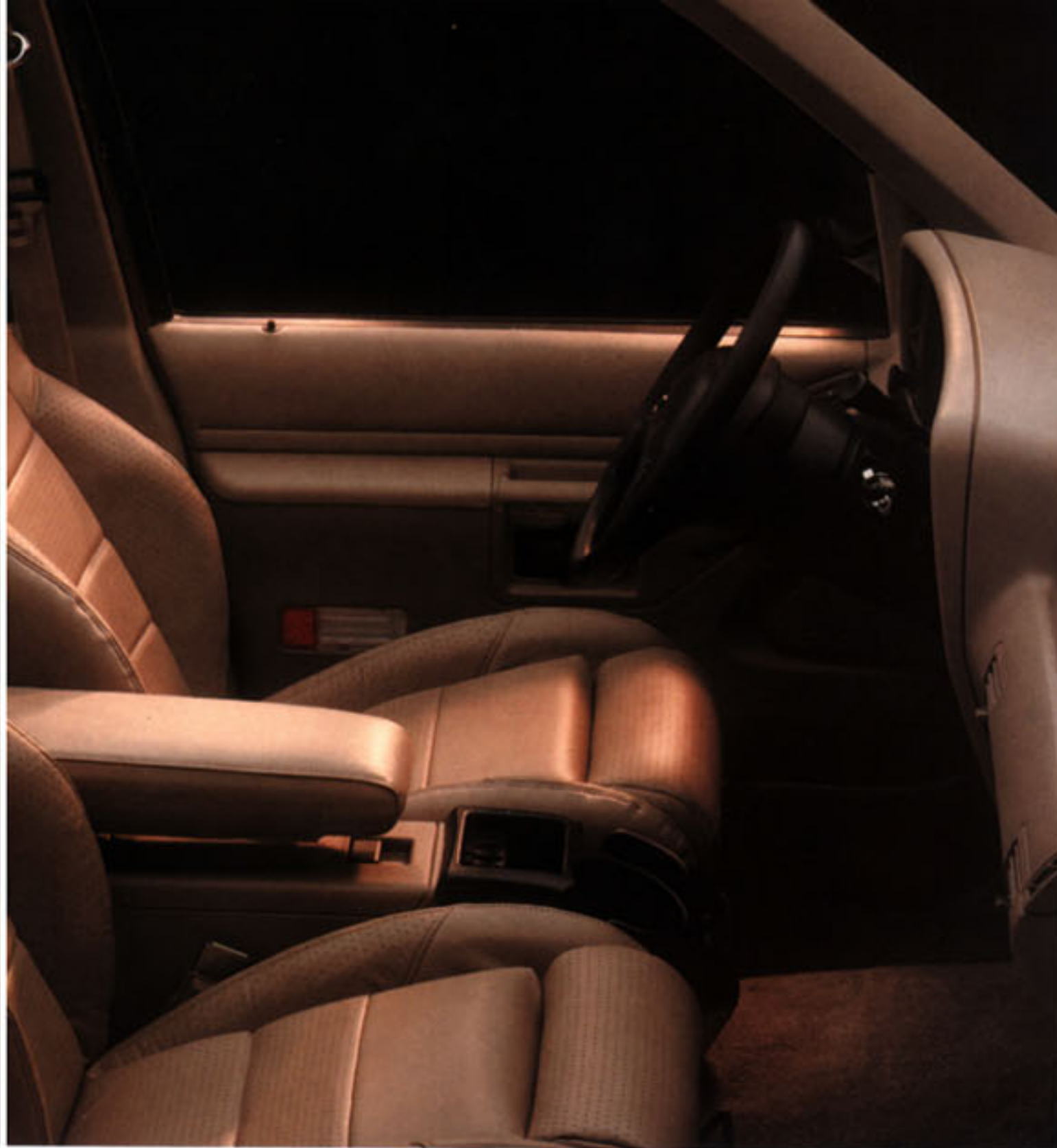
Left: The Eddie Bauer 4-Door interior with reclining sport buckets and leather seating surfaces. Complimentary garment and duffel bags are shipped to you directly from Eddie Bauer.