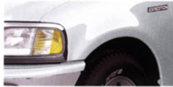
Oxford White Clearcoat