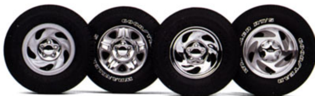
Expedition wheels (left to right): XLT styled steel wheels; forged aluminum wheels (standard with Eddie Bauer trim and included in XLT 685A); optional chrome steel wheels (not available with XLT 684A); optional cast aluminum wheels (included with 4x4 in Eddie Bauer package 687A).