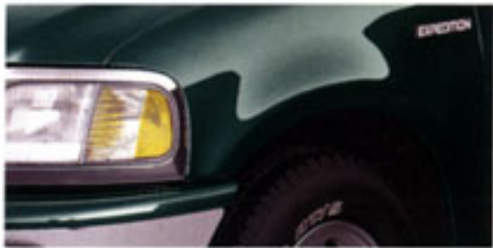
Pacific Green Clearcoat Metallic