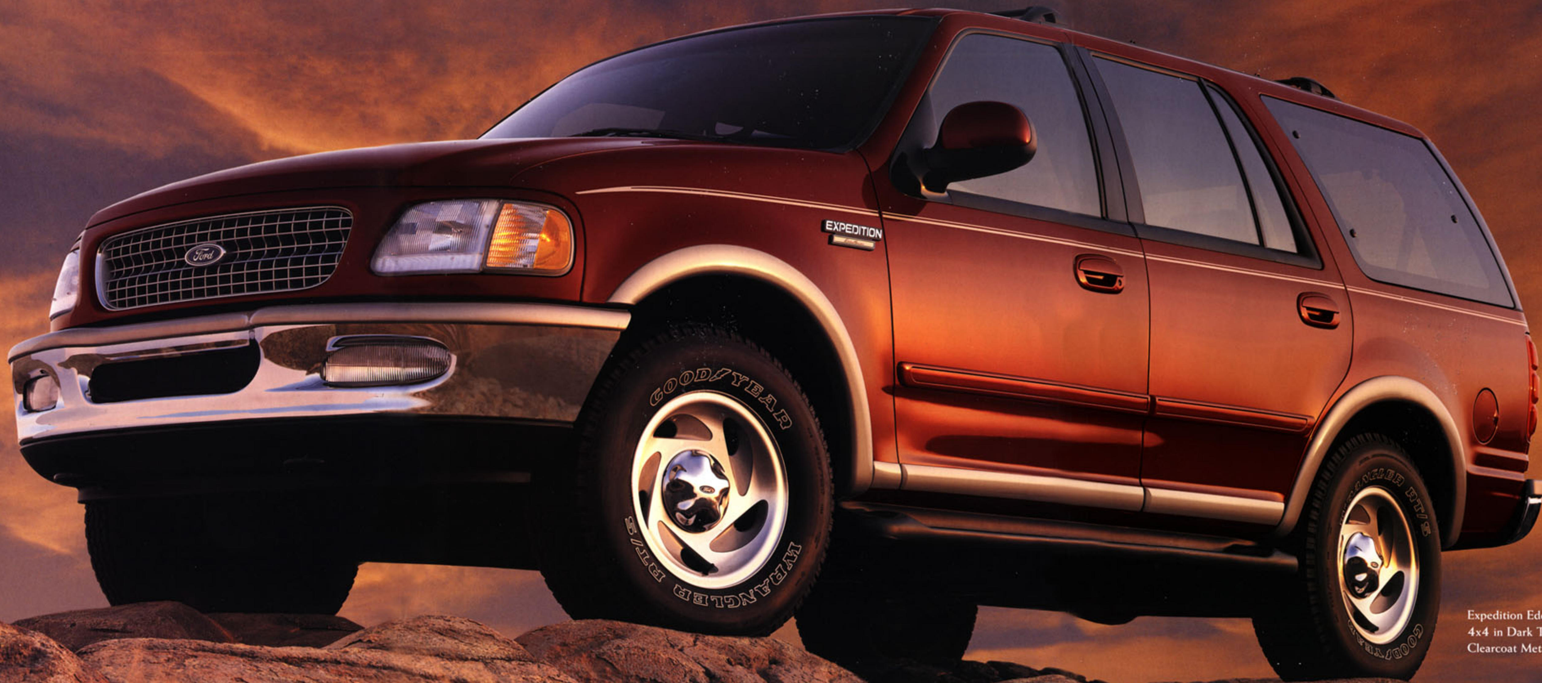
Expedition Eddie Bauer edition 4x4 in Dark Toreador Red Clearcoat Metallic.

A safety/security package includes a dual air bag supplemental restraint system (always wear your safety belt) and four-wheel anti-lock disc brakes – both standard.