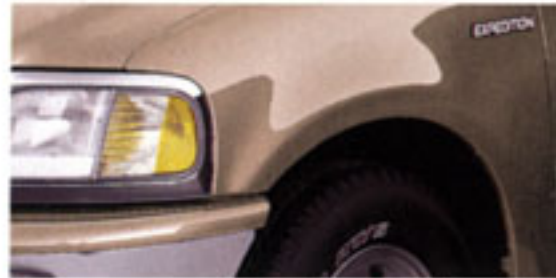
Light Prairie Tan Clearcoat Metallic