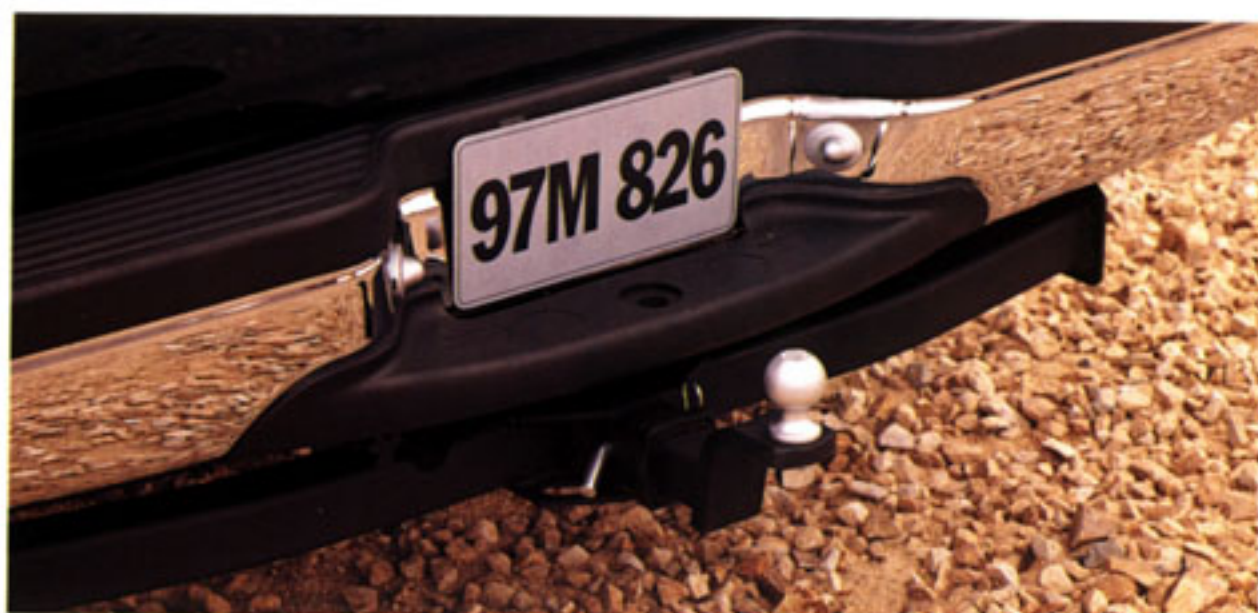
Frame-mounted hitch (trailer tow group)