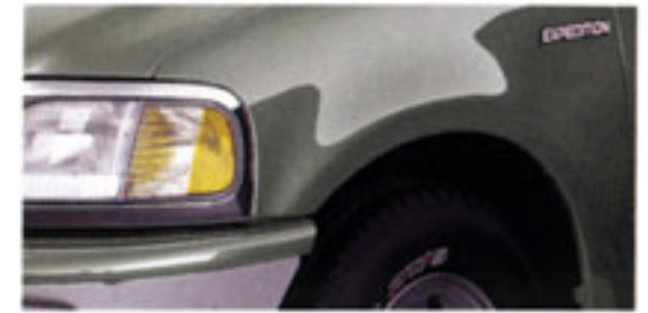
Vermont Green Clearcoat Metallic