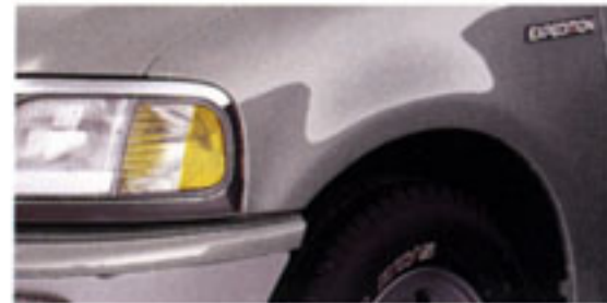
Silver Frost Clearcoat Metallic