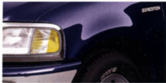
Moonlight Blue Clearcoat Metallic