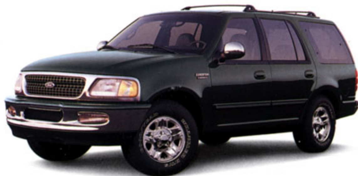
Expedition XLT package 685A in Pacific Green Clearcoat Metallic.