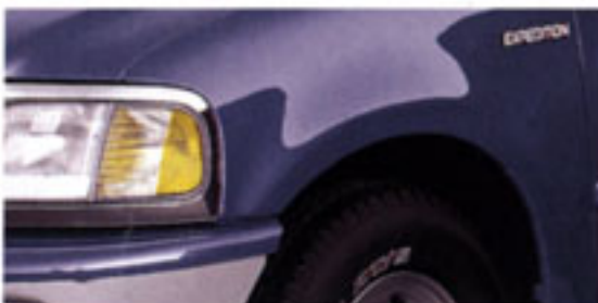
Portofino Blue Clearcoat Metallic