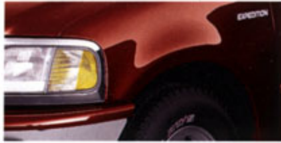
Dark Toreador Red Clearcoat Metallic