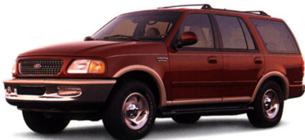
Expedition Eddie Bauer package 687A in Dark Toreador Red Clearcoat Metallic.