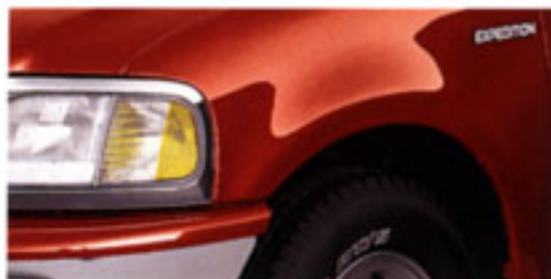
Laser Red Tinted Clearcoat