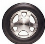
15" x 7" 6-spoke bright machined cast aluminum alloy (V6 Sport Appearance Group)