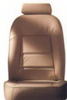
Leather-trimmed bucket seat Optional in V6