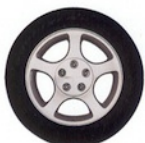
16" x 7.5" 5-spoke bright machine-forged aluminum alloy (V6 Sport Appearance Group)