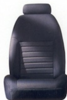
Sport bucket seat Standard in GT