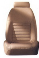
Leather-trimmed sport bucket seat Optional in GT