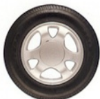
15" x 7" 6-spoke cast aluminum alloy with bright argent paint (V6 coupe and V6 convertible)