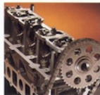
The GT's smooth delivery can be attributed to a silent chain-driven single-overhead cam, coupled with hydraulically adjusted roller finger followers to maintain optimal valve lash adjustment.