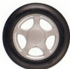
16" x 7.5" 5-spoke forged aluminum alloy with bright argent paint (GT coupe and GT convertible)