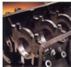
The 4.6-liter Mustang GT crankshaft utilizes durable four-bolt main bearing caps.