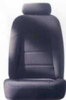
Bucket seat Standard in V6