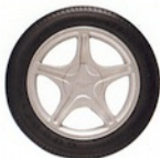
17" x 8" 5-spoke forged aluminum alloy with grooved spokes (Optional on GT coupe and GT convertible)