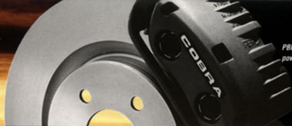
PBR™ calipers clamp on 13.0-inch Brembo™ rotors, which deliver excellent stopping power and resistance to fade.

INTIMATE COMMUNICATION between driver and car lies at the heart of the SVT performance philosophy. A sophisticated and athletic suspension is the nexus.