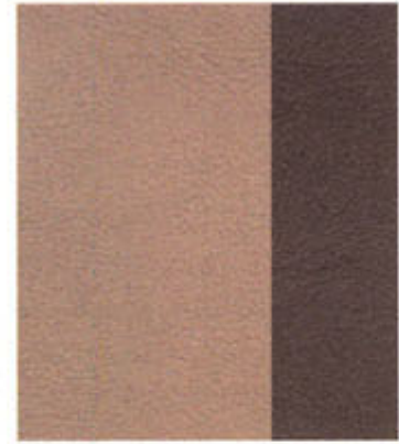
Premium Medium/Dark Parchment Two-Tone Leather Standard on Eddie Bauer