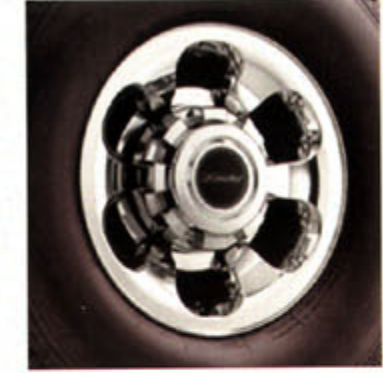
16" Limited Aluminum Wheel