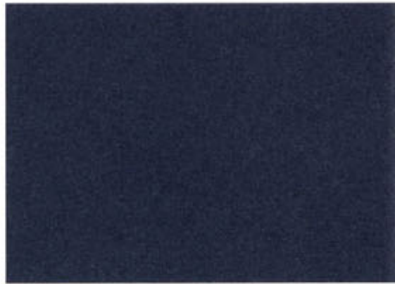
Medium Wedgewood Blue Metallic