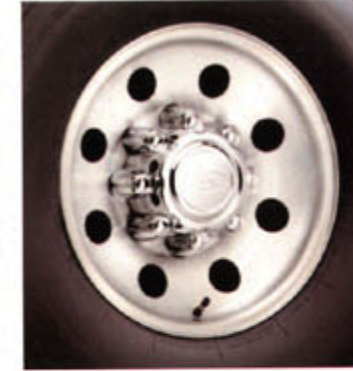
16" XLT Premium Aluminum Wheel