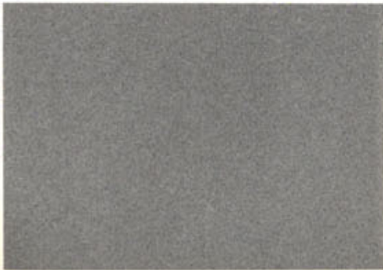
Silver Birch Metallic