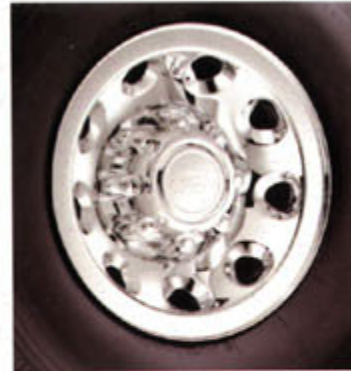
16" XLT Value Chrome Steel Wheel