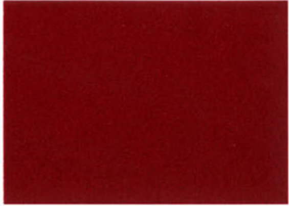
Red Fire Metallic