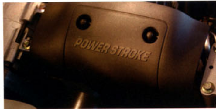
7.3L Power Stroke® Diesel Engine