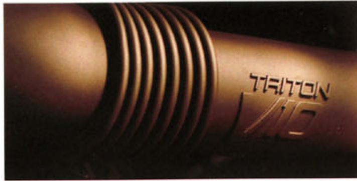
6.8L SOHC Triton™ V10 Engine