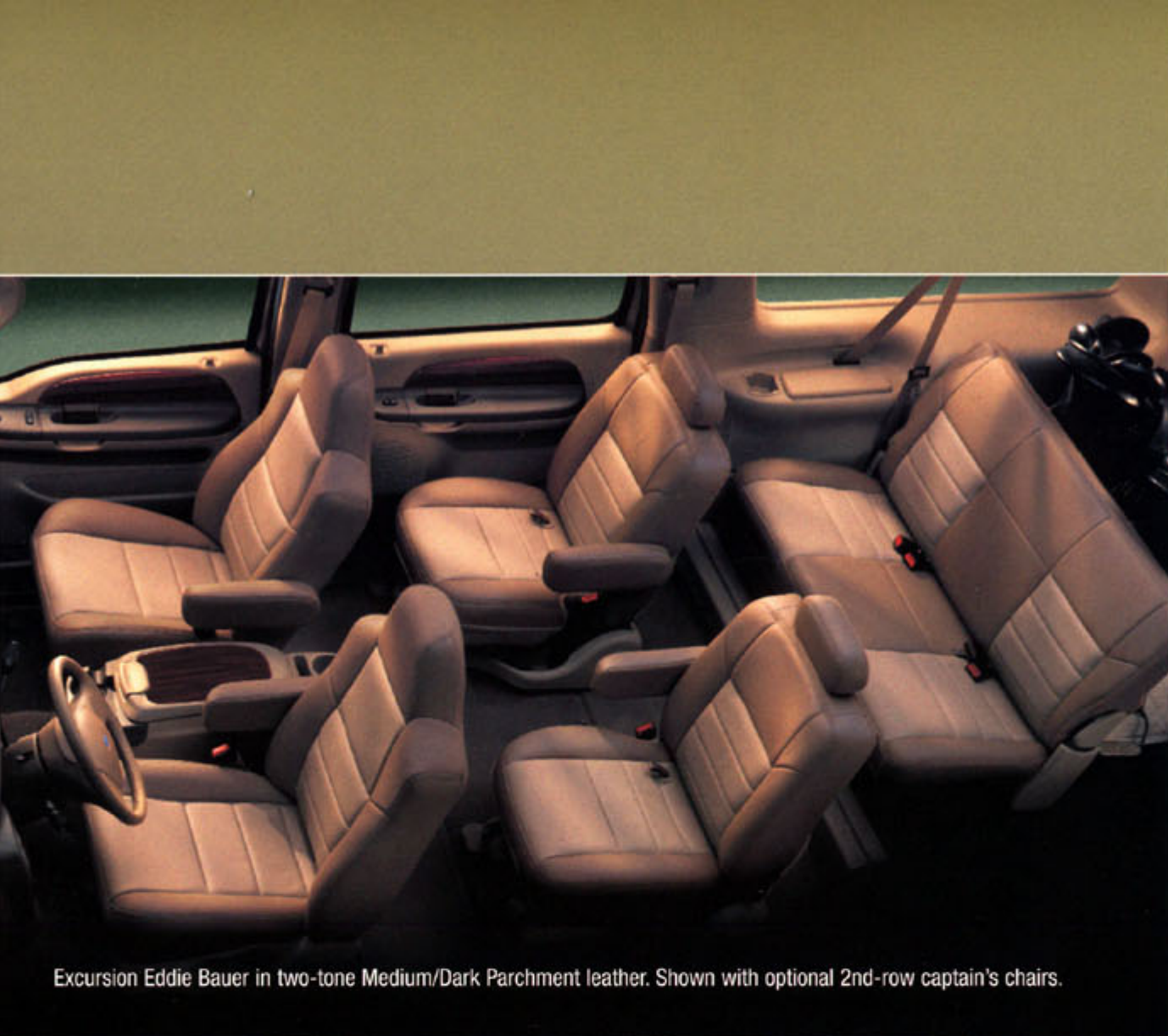
Excursion Eddie Bauer in two-tone Medium/Dark Parchment leather. Shown with optional 2nd-row captain's chairs.