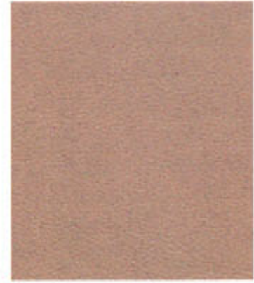
Premium Medium Parchment Leather Standard on Limited