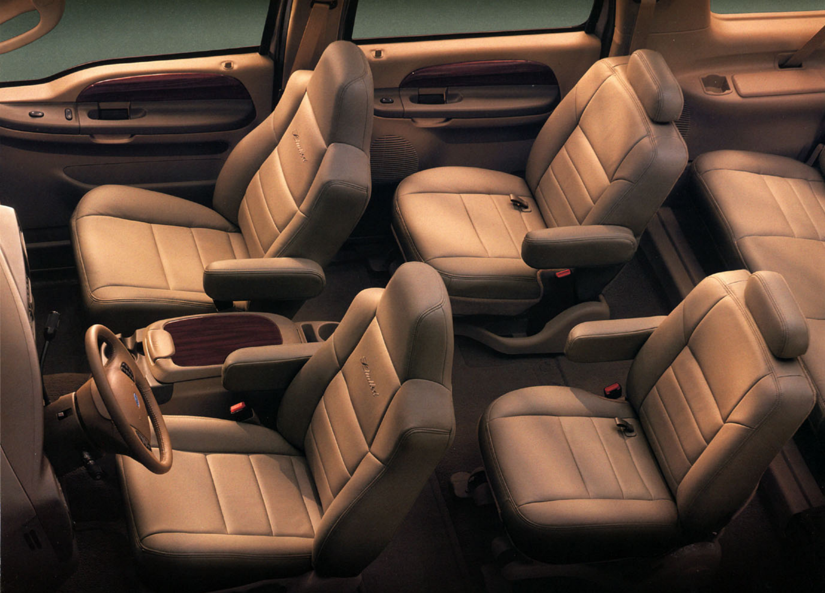
Excursion Limited in Medium Parchment leather. Shown with optional 2nd-row captain's chairs.