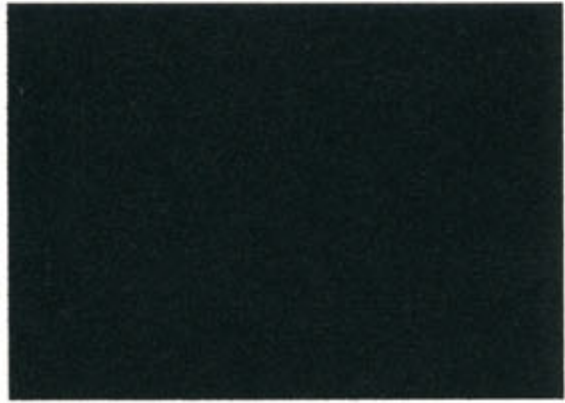
Aspen Green Metallic