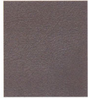
Medium Flint Leather