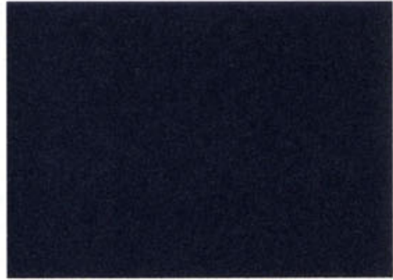
True Blue Metallic