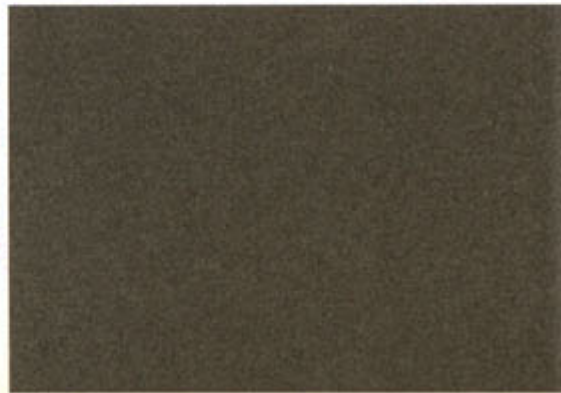
Mineral Grey Metallic