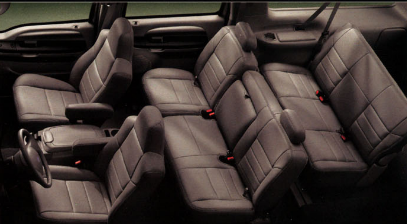
Excursion XLT Premium in Medium Flint. Also available in Medium Parchment. Shown with optional leather seating surfaces. Cloth trim is standard.