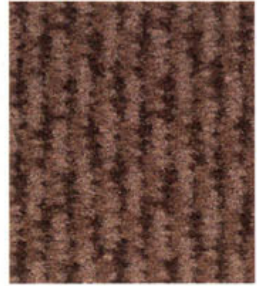
Medium Parchment Cloth