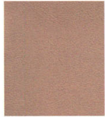
Medium Parchment Leather