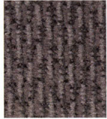
Medium Flint Cloth