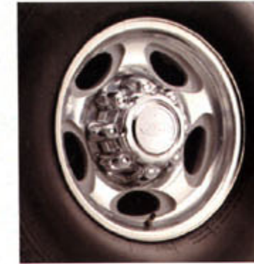
16" Eddie Bauer Aluminum Wheel