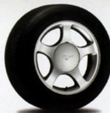
16" Painted Aluminum Wheel (Coupe only) Standard on Coupe and Deluxe Coupe