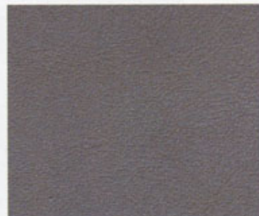
Medium Graphite Leather