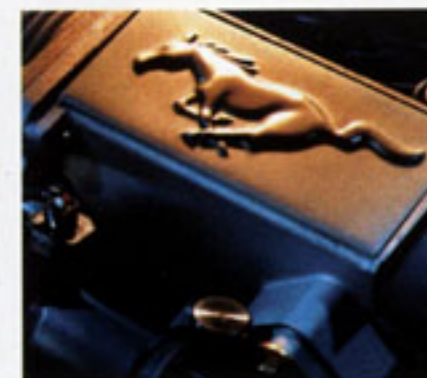
4.6L SOHC 16-Valve V8

Horsepower: 193 hp @ 5500 rpm Torque: 225 lb.-ft. @ 2800 rpm