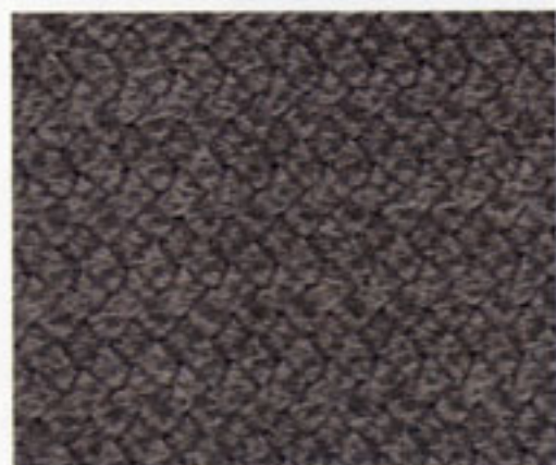
Medium Graphite Cloth