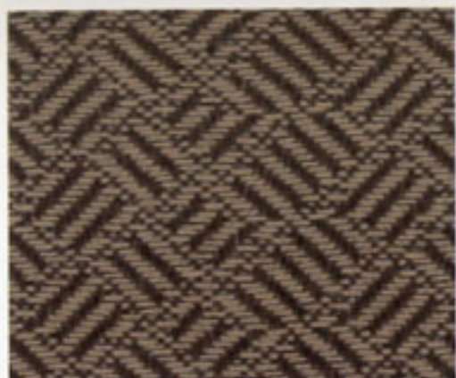
Medium Parchment Cloth