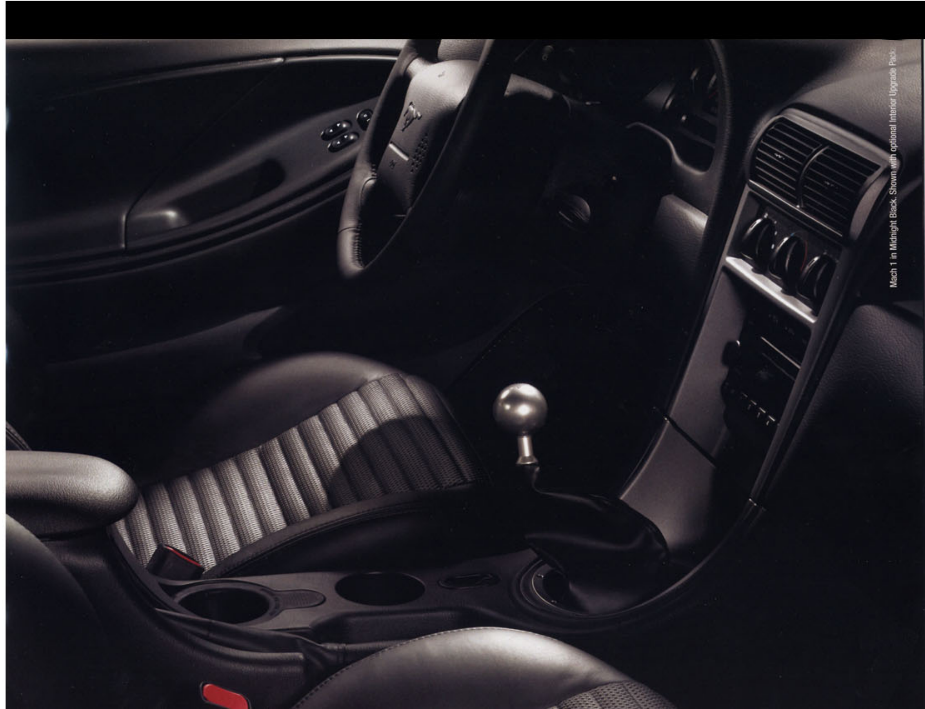
Mach 1 in Midnight Black. Shown with optional Interior Upgrade Package.