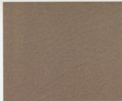
Medium Parchment Leather