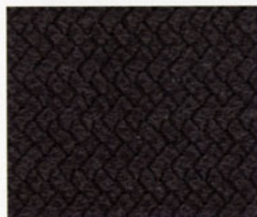
Dark Charcoal Cloth