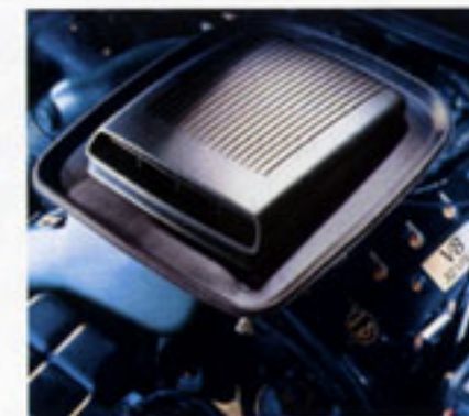
4.6L DOHC 32-Valve V8

Horsepower: 260 hp @ 5250 rpm Torque: 302 lb.-ft. @ 4000 rpm