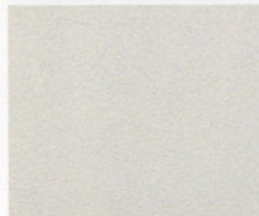
Oxford White Leather