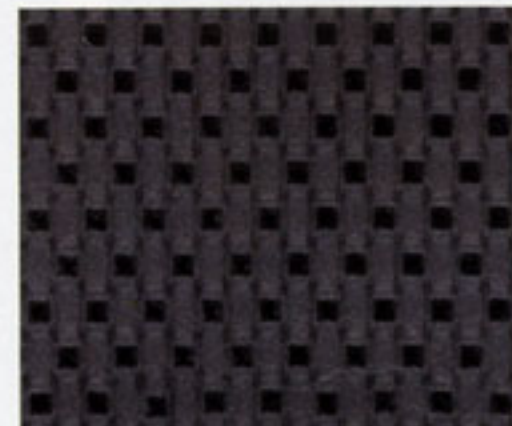
Midnight Black Leather