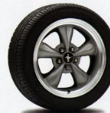
17" Premium Painted Aluminum Wheel with Bright Flange Standard on GT Premium