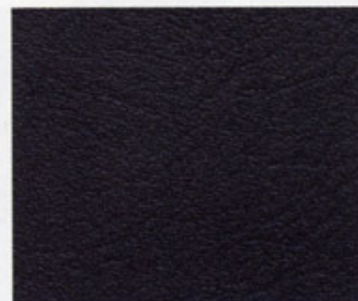
Dark Charcoal Leather