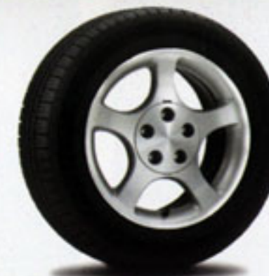
16" Bright Machined-Aluminum Wheel Standard on Deluxe Convertible and Premium Coupe