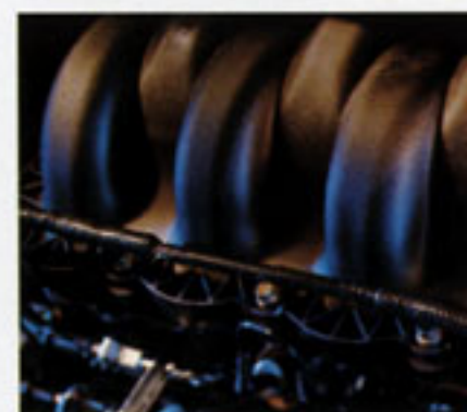
3.8L OHV 12-Valve V6

Horsepower: 193 hp @ 5500 rpm Torque: 225 lb.-ft. @ 2800 rpm