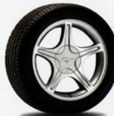
17" Painted Aluminum Wheel Standard on GT Deluxe