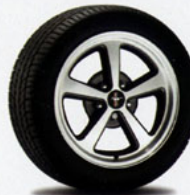
17" Heritage Aluminum Wheel Standard on Mach 1