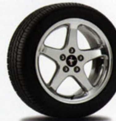
17" Bright Aluminum Wheel Optional on GT Premium