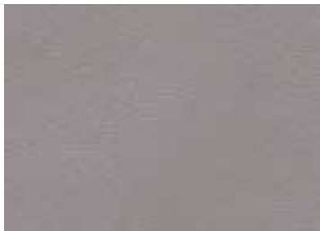
Medium Graphite Leather