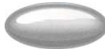
Silver Frost Metallic