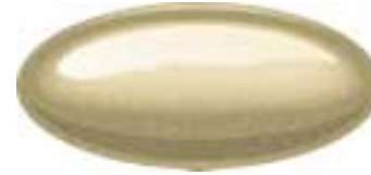
Light Parchment Gold Metallic