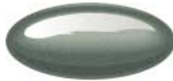
Spruce Green Metallic