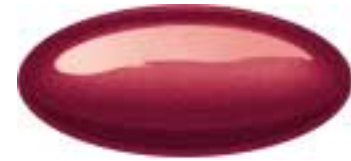
Matador Red Metallic