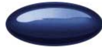
True Blue Metallic