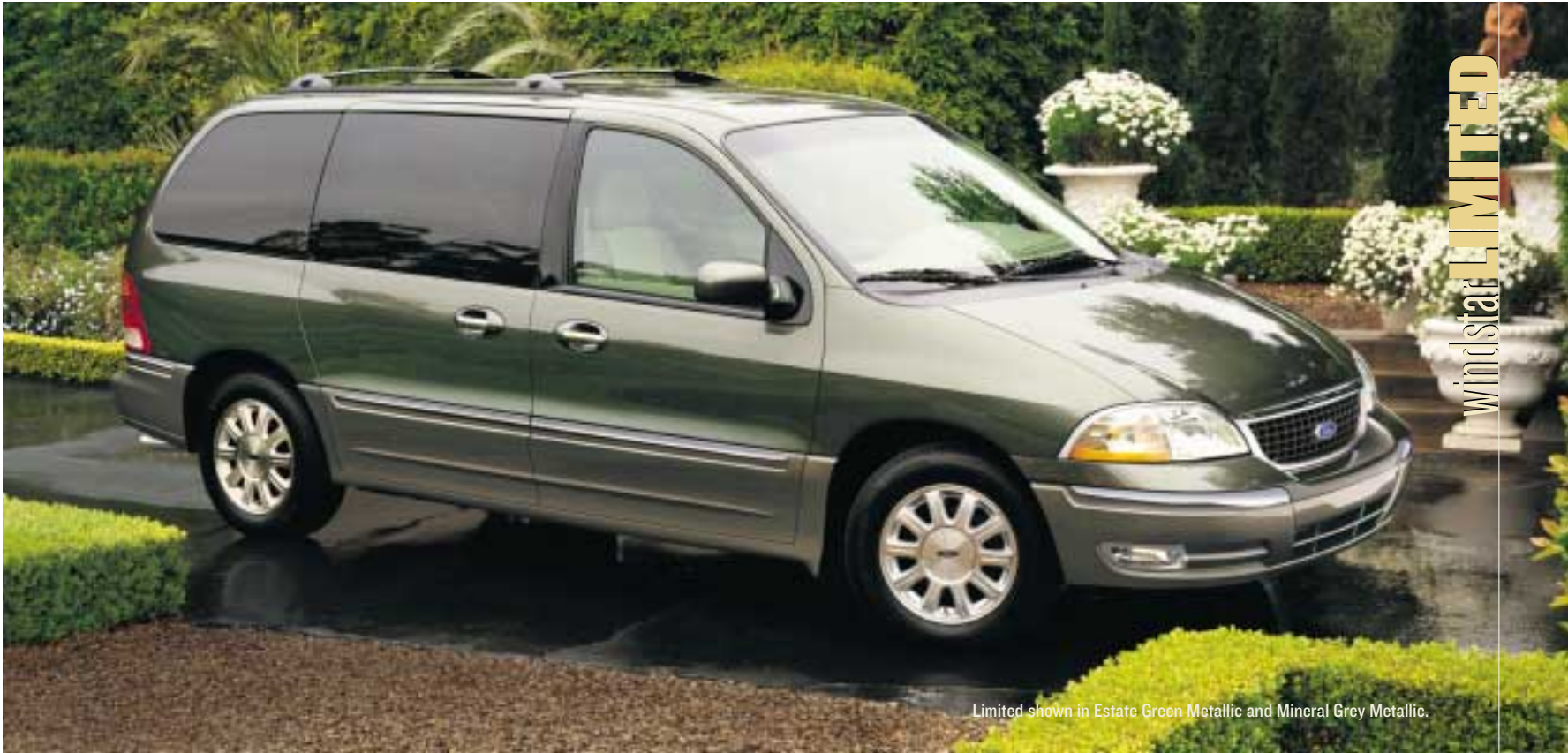
Limited shown in Estate Green Metallic and Mineral Grey Metallic.