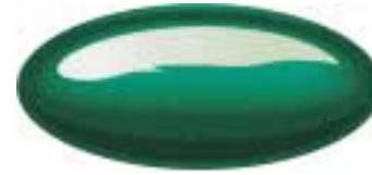
Tropic Green Metallic