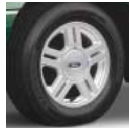
16" 5-Spoke Painted Aluminum Wheel Standard on SE and SEL