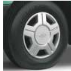
15" Steel Wheel with Cover Standard on LX Base and LX Standard