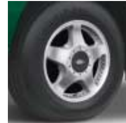
16" 5-Spoke Painted Aluminum Wheel Standard on LX Deluxe