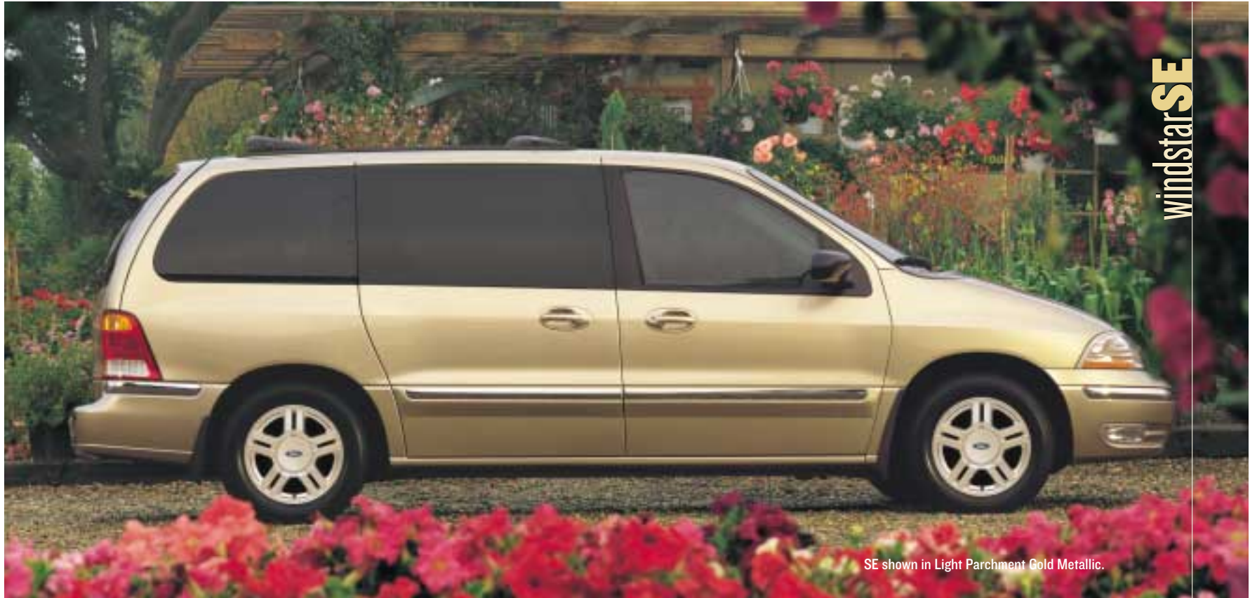
SE shown in Light Parchment Gold Metallic.