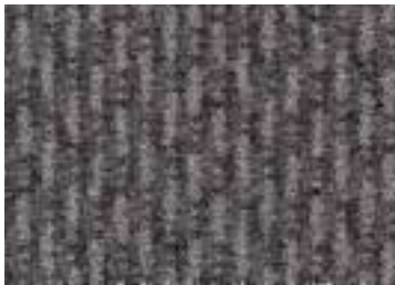
Medium Graphite Cloth