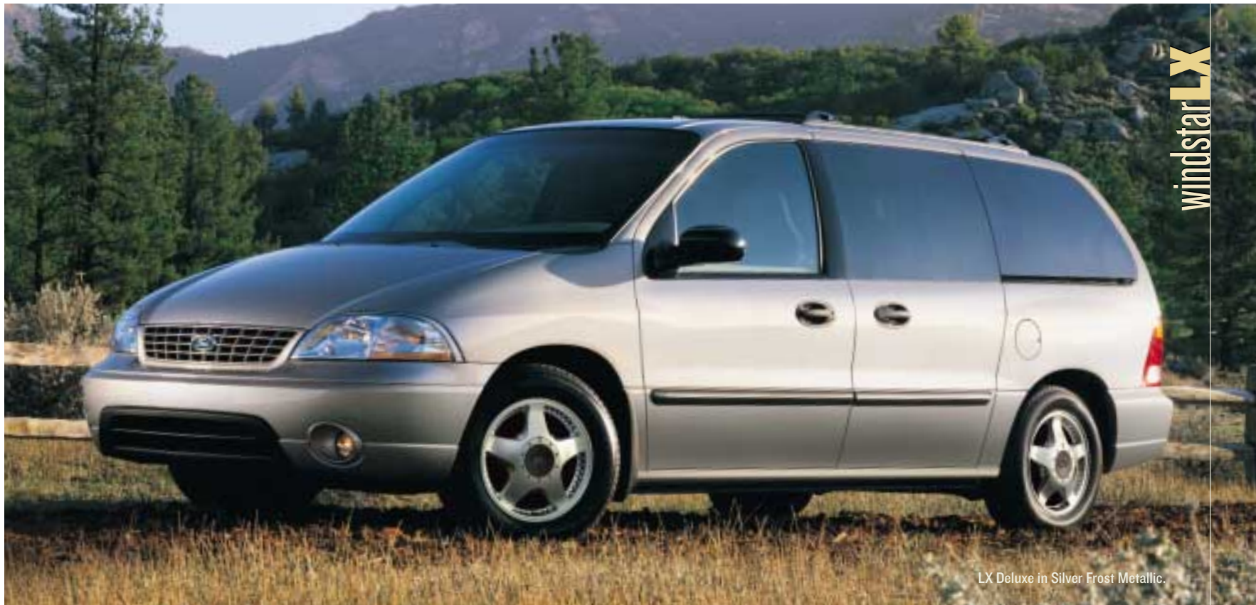
LX Deluxe in Silver Frost Metallic.