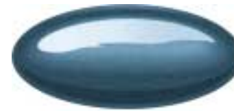
Light Sapphire Blue Metallic