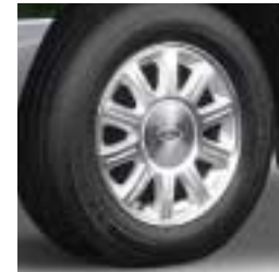
16" 10-Spoke Brushed Aluminum Wheel Standard on Limited