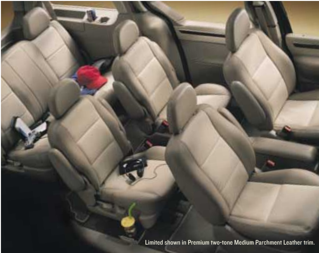
Limited shown in Premium two-tone Medium Parchment Leather trim.