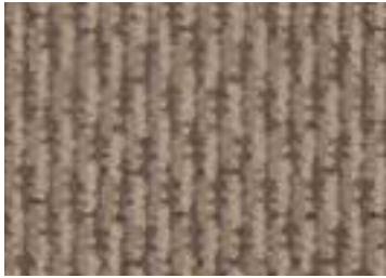
Medium Parchment Cloth