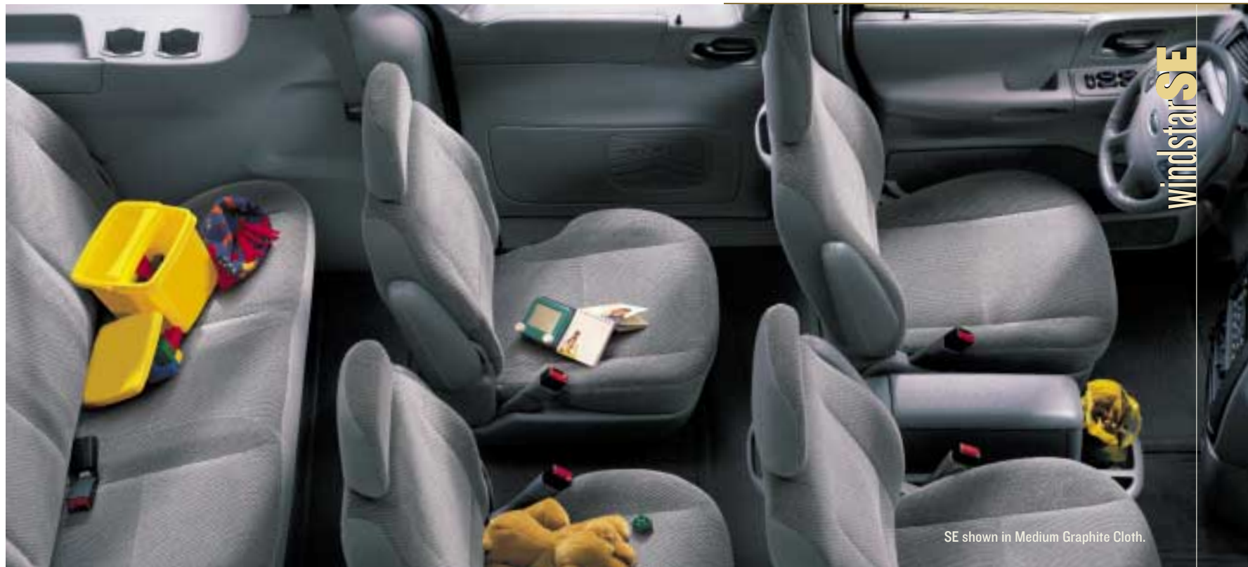
SE shown in Medium Graphite Cloth.