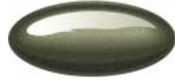
Estate Green Metallic