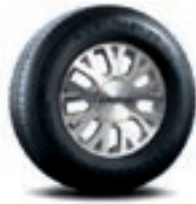
16" Split-Spoke Aluminum Wheel