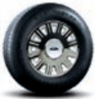
16" Steel Wheel