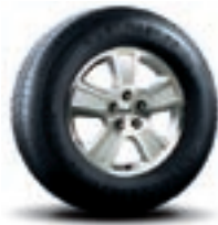
17" 5-Spoke Aluminum Wheel