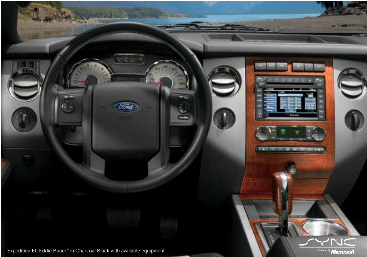
Expedition EL Eddie Bauer® in Charcoal Black with available equipment