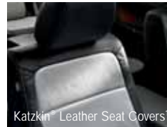
Katzkin® Leather Seat Covers 1