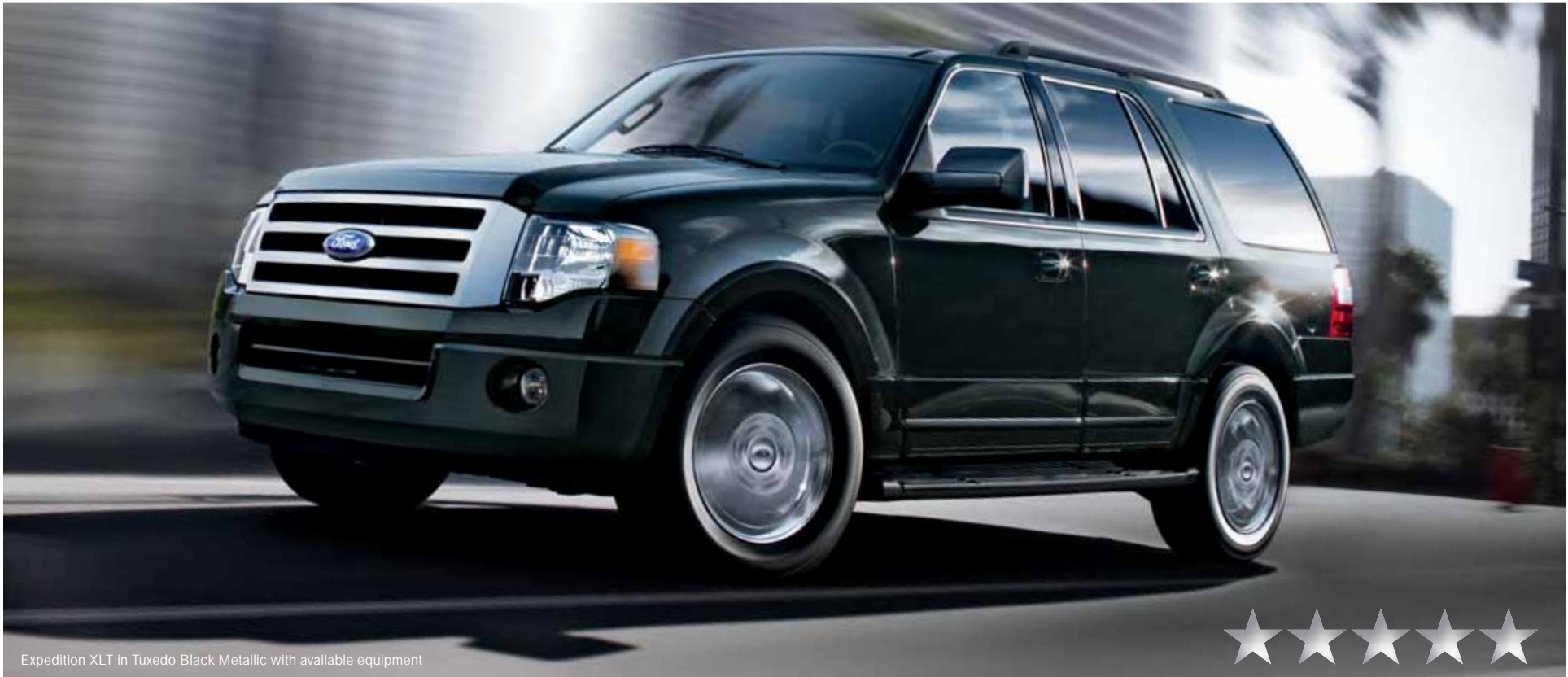
Expedition XLT in Tuxedo Black Metallic with available equipment