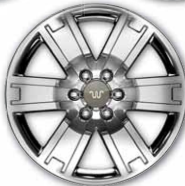
20" Chrome-Clad Aluminum with King Ranch Center Cap Optional on King Ranch

New Vehicle Limited Warranty. We want your Ford Expedition or Expedition EL ownership experience to be the best it can be. So under this warranty, your new vehicle comes with 3-year/36,000-mile Bumper-to-Bumper Coverage, 5-year/60,000-mile Powertrain Warranty Coverage, 5-year/50,000-mile Safety Restraint Coverage, and 5-year/unlimited-mile Corrosion (Perforation) Coverage – all with no deductible. Please ask your Ford Dealer for a copy of this limited warranty.