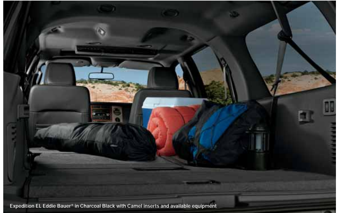
Expedition EL Eddie Bauer ® in Charcoal Black with Camel inserts and available equipment