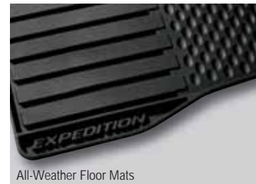
All-Weather Floor Mats