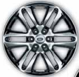
22" Chrome Wheels 2