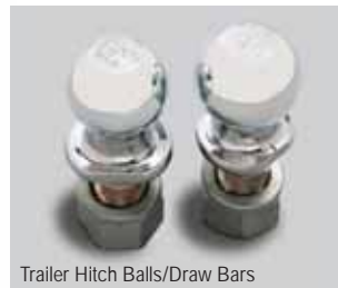
Trailer Hitch Balls/Draw Bars