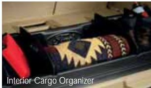
Interior Cargo Organizer