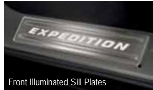
Front Illuminated Sill Plates