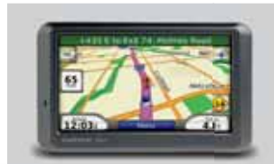
Garmin® Portable Navigation Systems 1