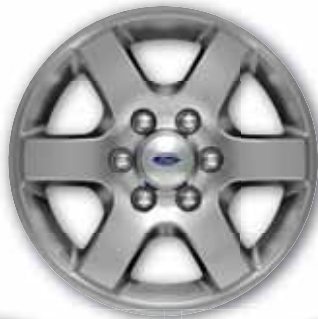
17" Aluminum Standard on XLT