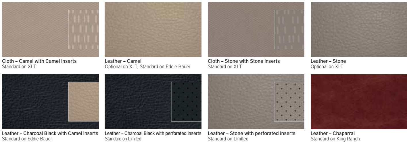
Cloth – Camel with Camel inserts Standard on XLT