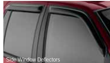
Side Window Deflectors