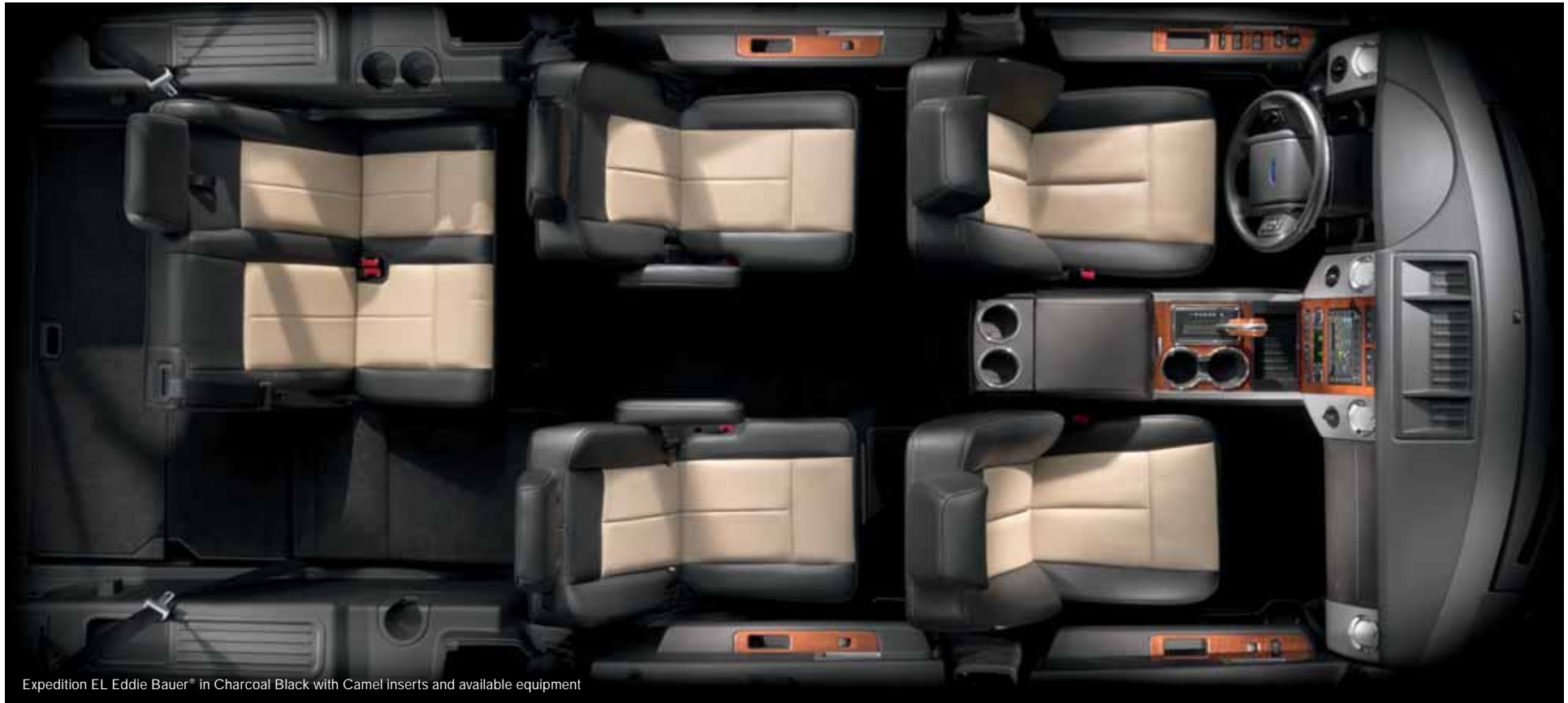
Expedition EL Eddie Bauer® in Charcoal Black with Camel inserts and available equipment