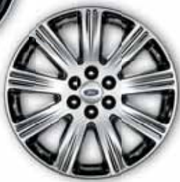
22" Chrome Wheels 2