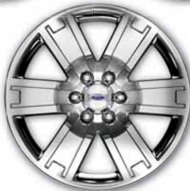
20" Chrome-Clad Aluminum Optional on Eddie Bauer and Limited