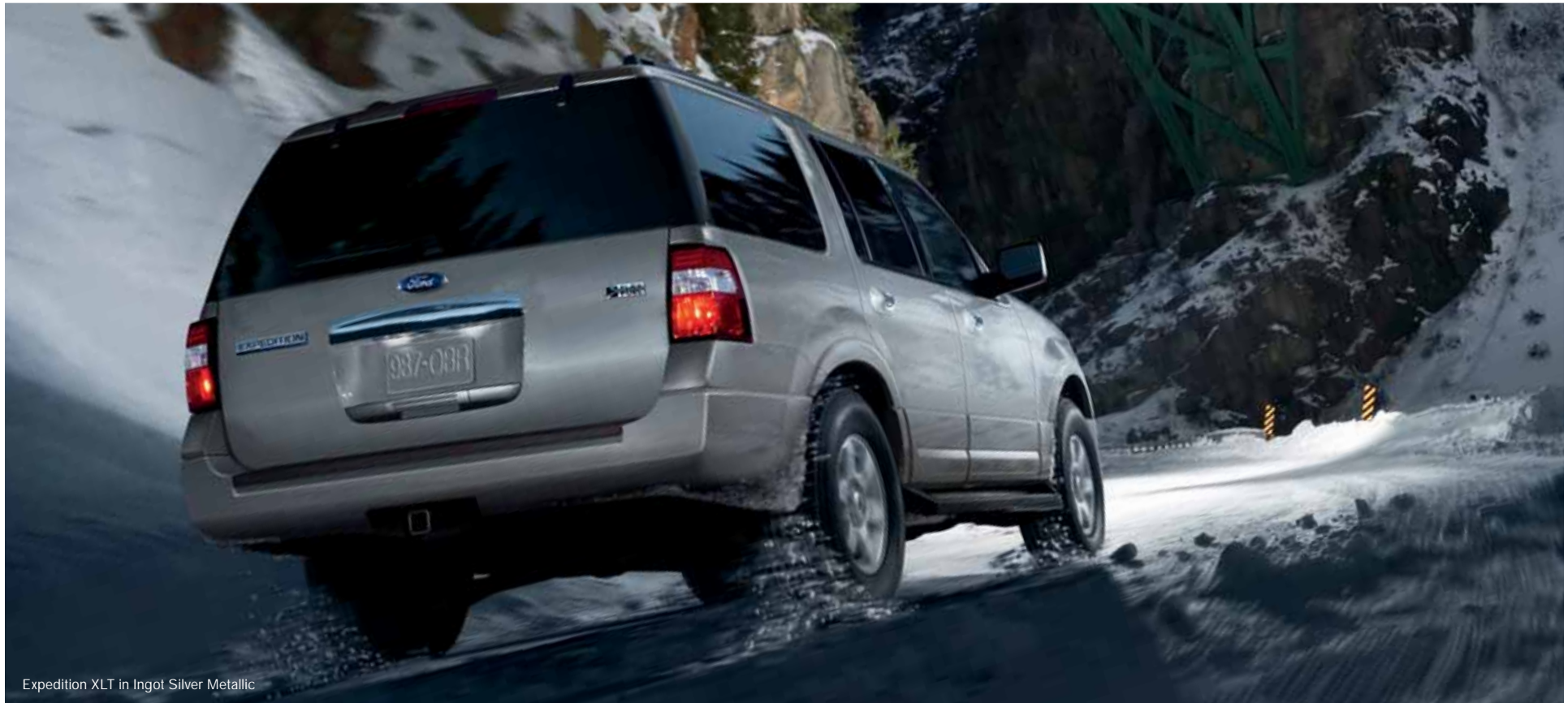
Expedition XLT in Ingot Silver Metallic