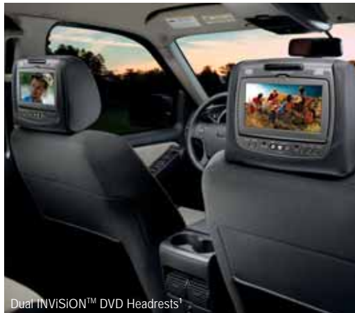
Dual INVISION™ DVD Headrests 1