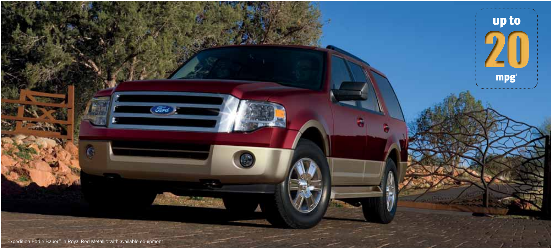
Expedition Eddie Bauer® in Royal Red Metallic with available equipment