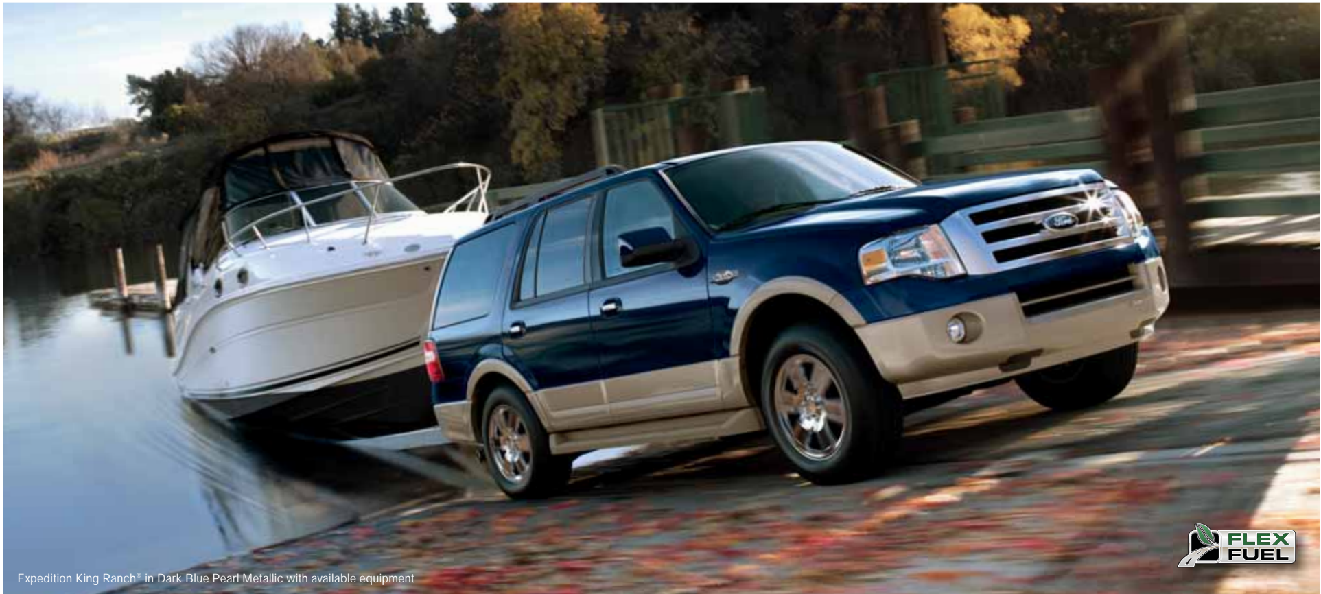
Expedition King Ranch® in Dark Blue Pearl Metallic with available equipment