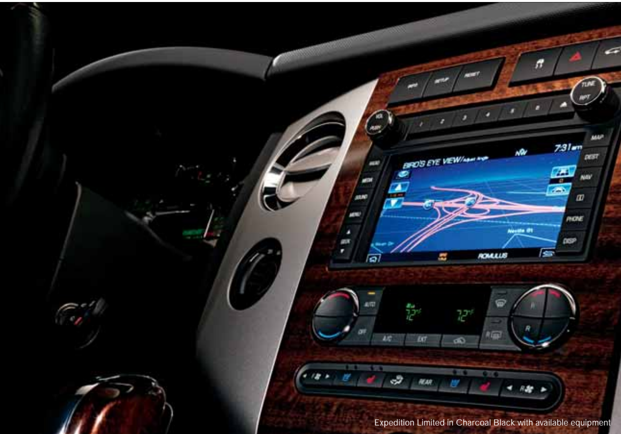
Expedition Limited in Charcoal Black with available equipment

Available SIRIUS Satellite Radio 1 comes with a 6-month subscription to get you surfing over 130 channels of sports, news, entertainment and 100% commercial-free music, coast-to-coast.