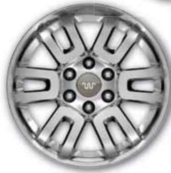
18" Machined-Aluminum with King Ranch® Center Cap Standard on King Ranch