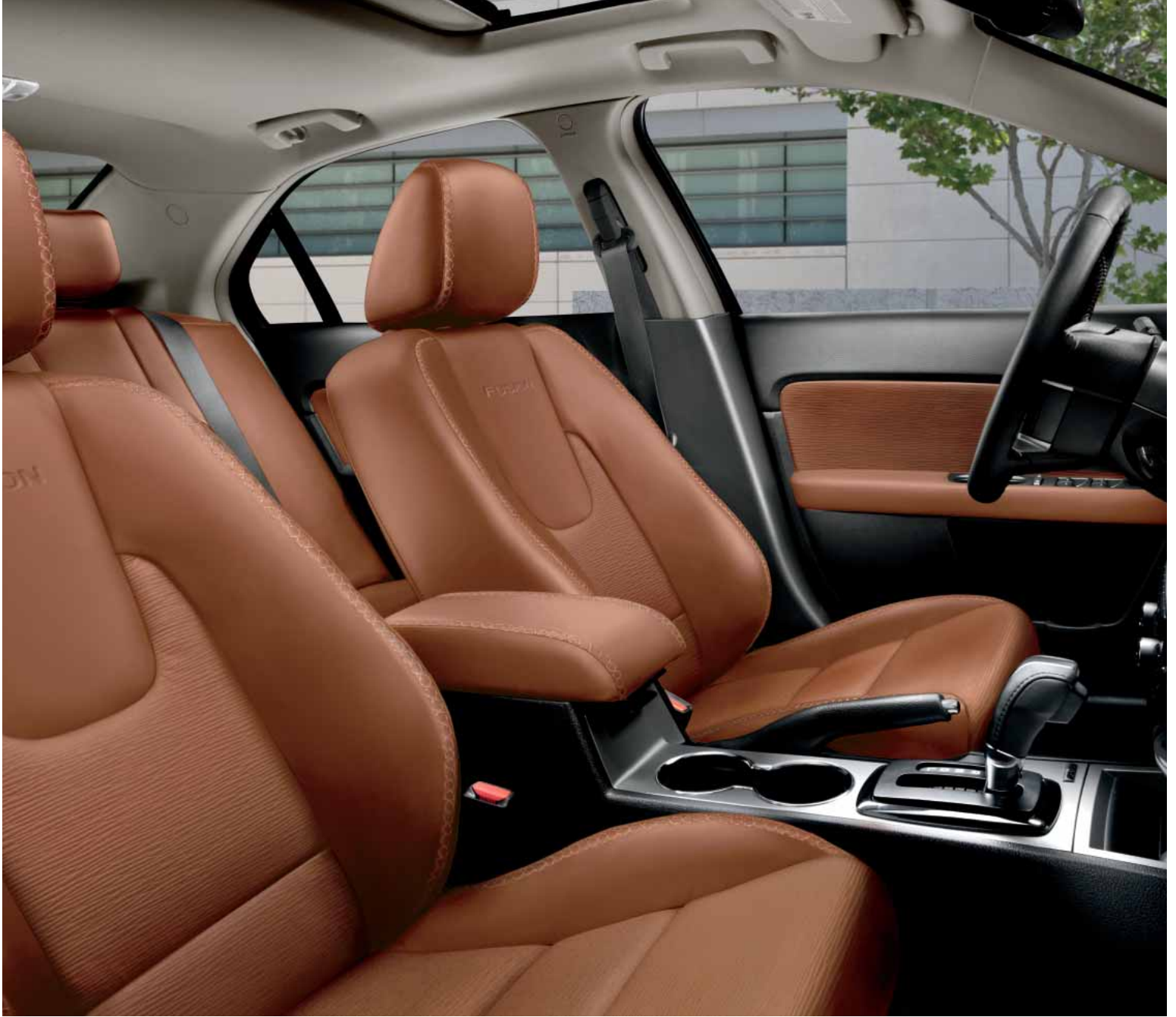
Luxury Package! Ginger leather trim. Available equipment. | Dual-zone electronic automatic temperature control. | Sony® Audio System! | Heated front seats. | Rear view camera!