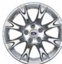
17" Polished Aluminum Included with Luxury Package