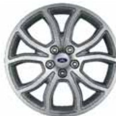
18" Machined Aluminum with Painted Pockets Included with Appearance Package (SE)