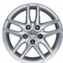
16" 5-Spoke Painted Aluminum Standard on S