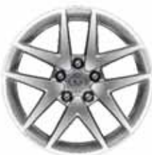
17" 5-Spoke Machined Aluminum Standard