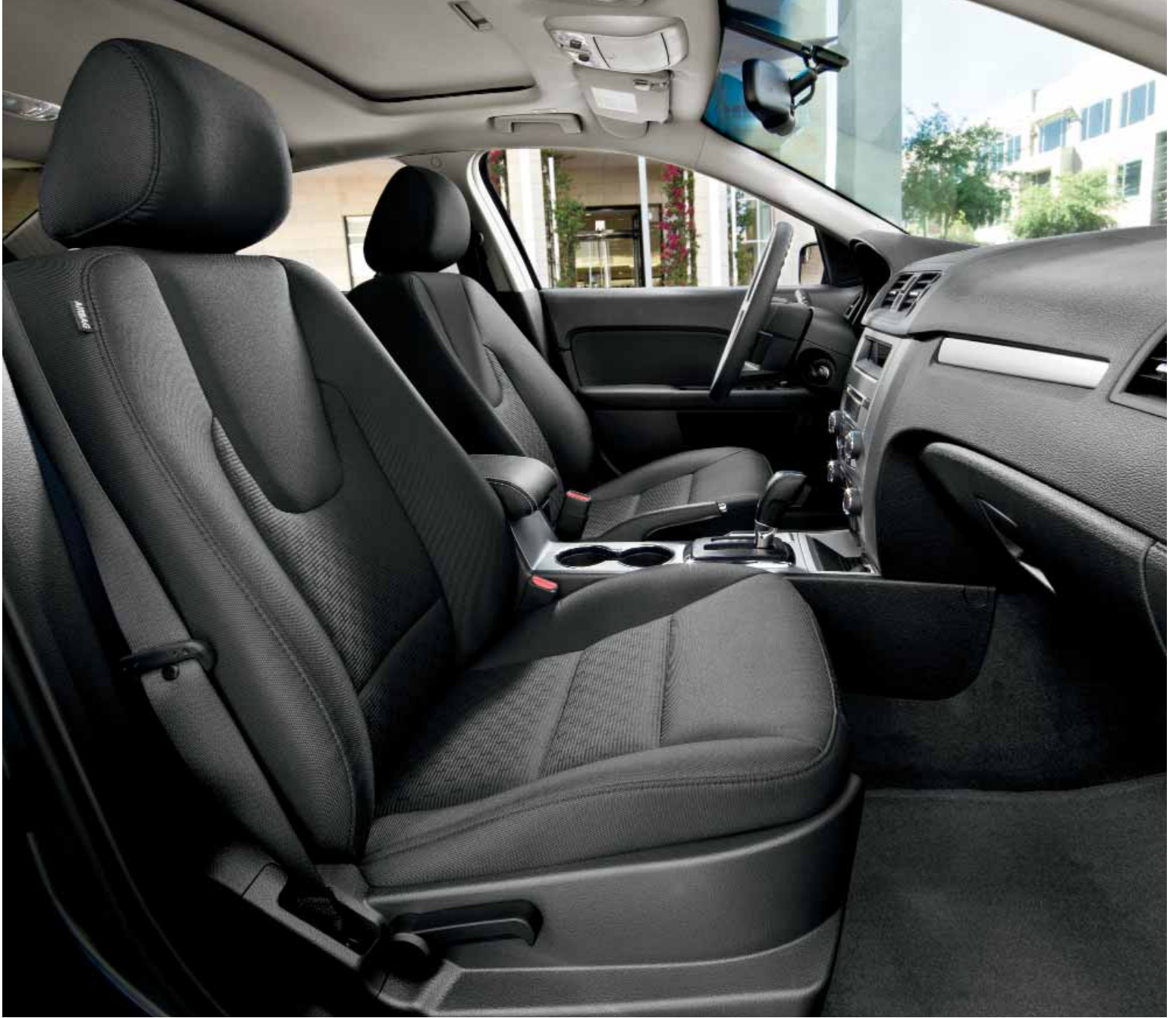
SE. Charcoal Black cloth trim. Available equipment. | Ford SYNC 1 | Rear-seat center armrest. | SE. 8-way power driver's seat. | Easy Fuel ® capless fuel filler.