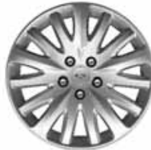
17" 15-Spoke Painted Aluminum Standard