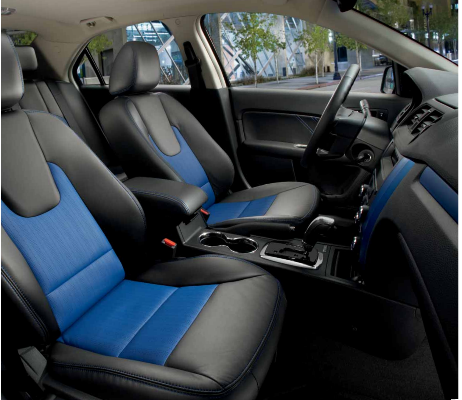
Charcoal Black leather trim. Sport Blue perforated inserts. Available equipment. | Charcoal Black leather trim. Charcoal Black perforated inserts. Available equipment. | "SPORT" badge. | Black-chrome grille.