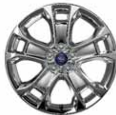
18" Polished Aluminum Available on SE