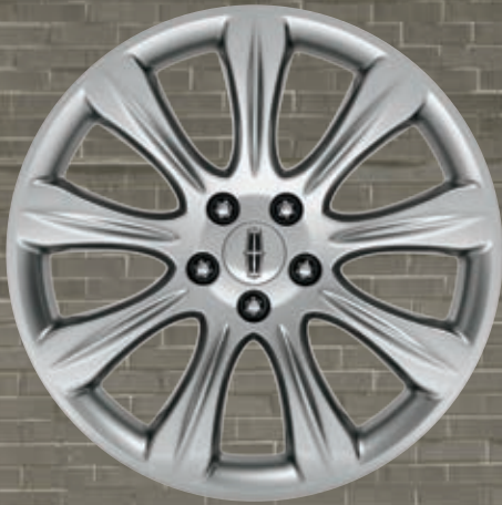
19" Premium Painted Aluminum Standard