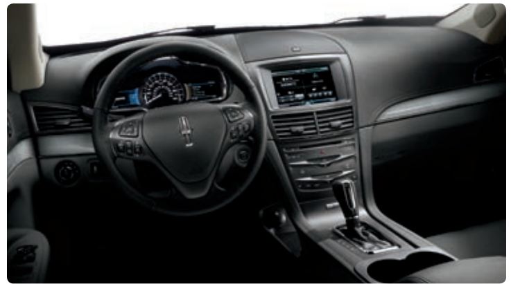
Charcoal Black Leather