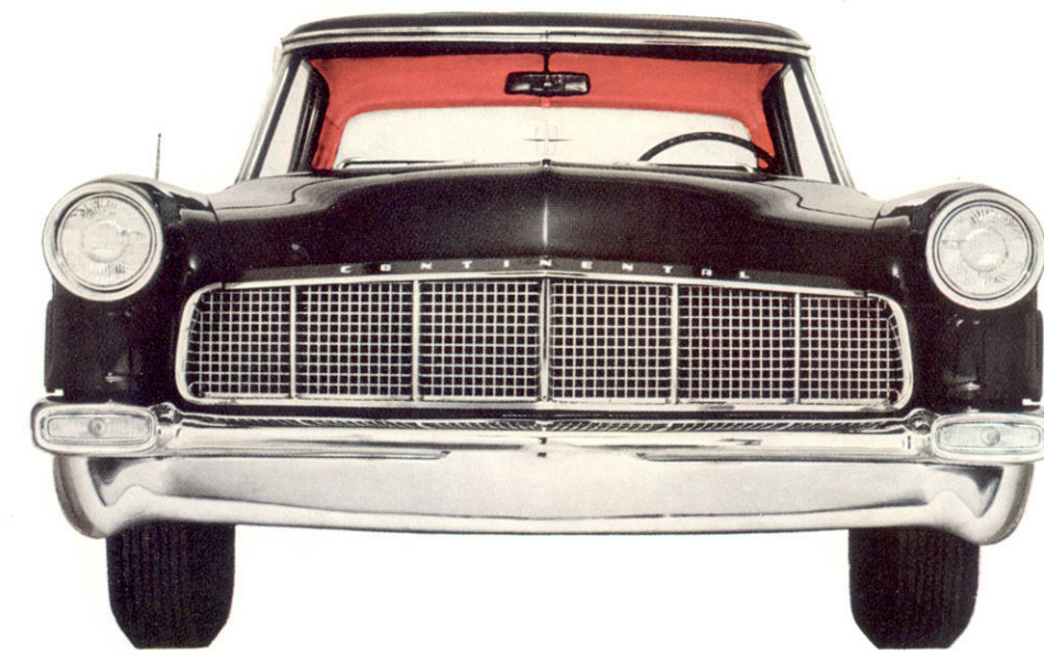
the Continental Mark II