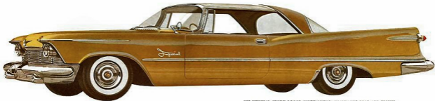
1958 IMPERIAL CROWN 2-DOOR SOUTHAMPTON, CHAMPAGNE GOLD AND ERMINE