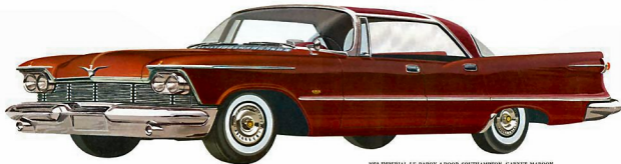
1958 IMPERIAL LE BARON 4-DOOR SOUTHAMPTON, GARNET MAROON