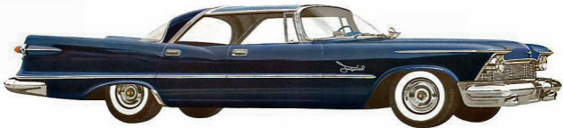
1958 IMPERIAL CROWN 4-DOOR SOUTHAMPTON, MIDNIGHT BLUE AND AIR FORCE BLUE