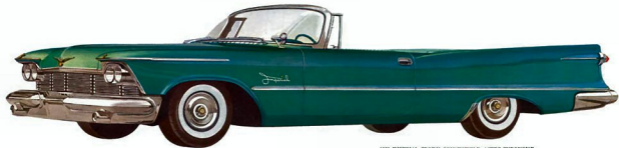
1958 IMPERIAL CROWN CONVERTIBLE, AZTEC TURQUOISE