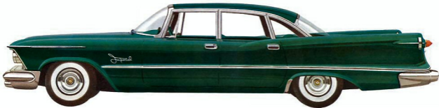
1958 IMPERIAL 4-DOOR SEDAN, SOLID MANDARIN JADE