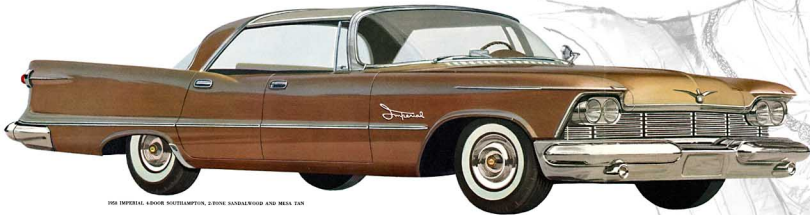
1958 IMPERIAL 4-DOOR SOUTHAMPTON, 2-TONE SANDALWOOD AND MESA TAN

Once into every lucky man's life comes the car he never forgets. It could well be this one... the Imperial 4-Door Southampton. A few moments behind the wheel of this breath-taking automobile will convince you that here is a car of magnificent design and dimension... a car with a remarkable personality of its very own. The classic, yet young and vigorous, flow of its Flight-Sweep lines... the tasteful application of the famous Imperial gunsight taillamps... the exquisite application of the famous Imperial gunsight taillamps... the exquisitely crafted new grille with its integrated dual headlights (standard equipment on all 1958 Imperial models)... all definitely point to the fact that here today is a car that will be revered as a masterpiece in motoring history.