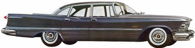
1956 IMPERIAL LE BARON 4-DOOR SEDAN, WINCHESTER GRAY