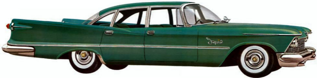
1958 IMPERIAL CROWN 4-DOOR SEDAN, CYPRESS GREEN