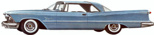
1958 IMPERIAL 2-DOOR SOUTHAMPTON, SOLID BALLETT BLUE