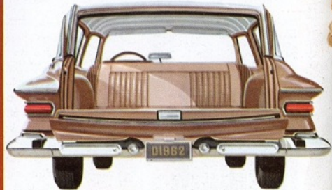
Dodge Custom 880 9-Passenger Wagon

The Dodge Custom 880 is available in two luxurious 4-door hardtop wagons: a 2-seat, 6-passenger model and a 3-seat, 9-passenger model. Third-seat is rear-facing (kids love it). Folds into floor for additional cargo space. Power operated tailgate window is standard on all wagon models. Custom 880 wagons have a mammoth 91.5 cubic-foot cargo capacity. A wide 49.2 inch tailgate opening accepts your load like a bottomless pit. Kegs, cartons, cots, canoes . . . there's room in there for just about anything. (More than ten feet deep from back of front seat to end of open tailgate.) The upholstery is all-vinyl, tailored to take it and come back for more.