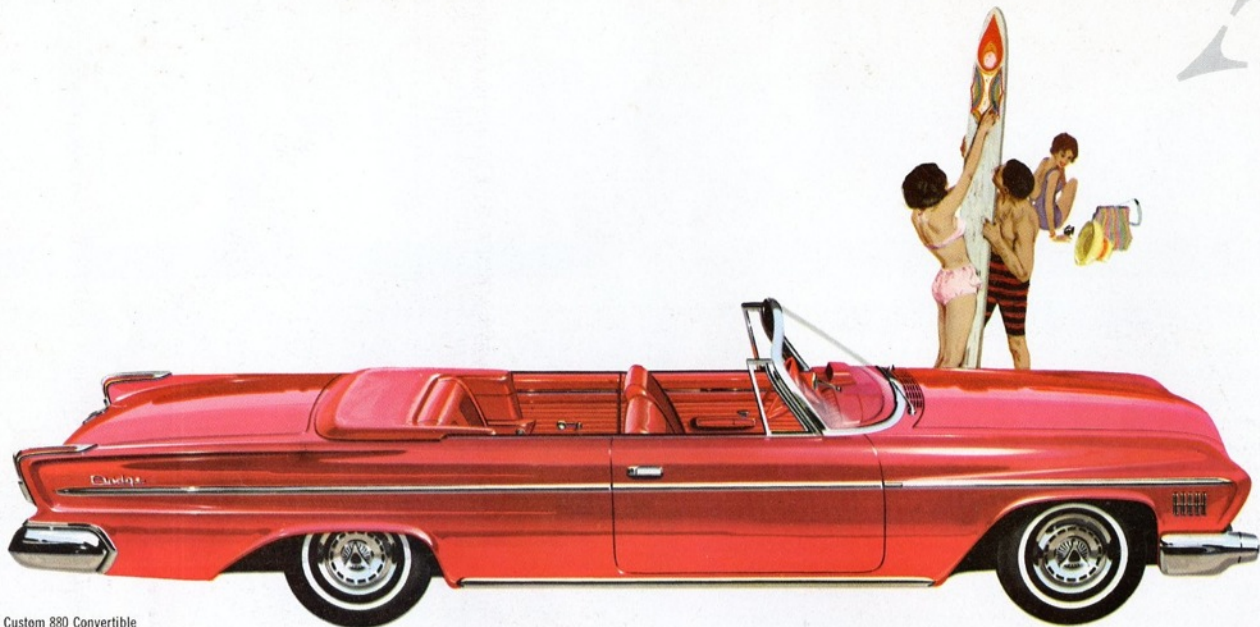
Dodge Custom 880 Convertible