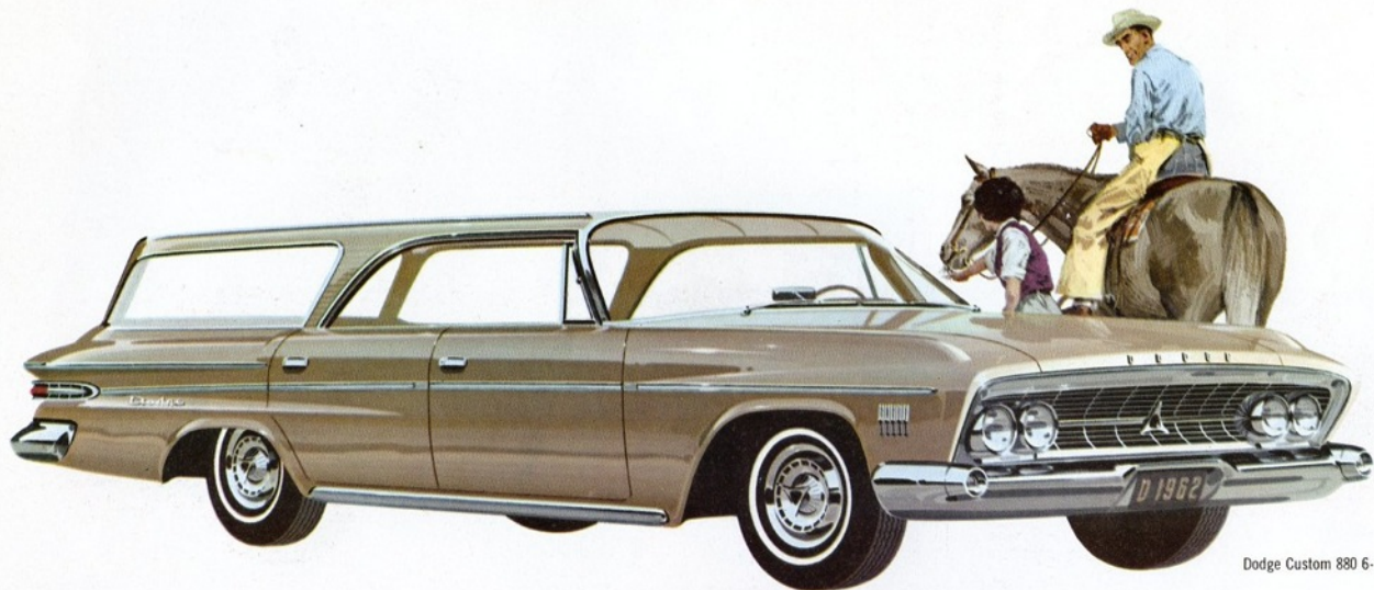
Dodge Custom 880 6-Passenger Wagon

HOLDS THEM ALL! THE LONG THE SHORT & THE TALL!!!