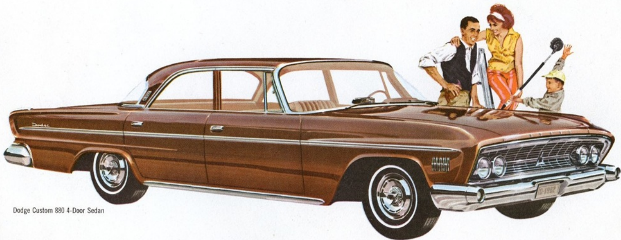
Dodge Custom 880 4-Door Sedan

LOTS OF CAR FOR THE MAN WHO LIKES HIS CAR BIG