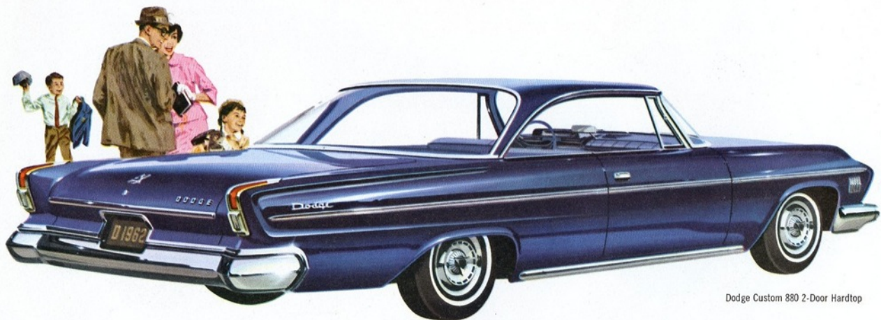
Dodge Custom 880 2-Door Hardtop