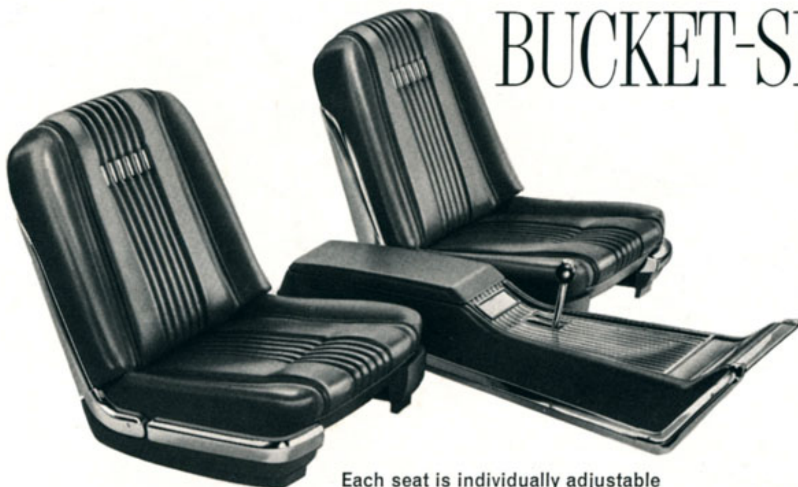
Each seat is individually adjustable

Go Mercury for the best-looking bucket-seat buys . . . now in each size! Five luxury models, each with bucket seats, to suit every purse and personality . . . the compact Mercury Comet S-22, smartly ahead of the compact crowd . . . the compact Comet Villager, newest, most luxurious 6-passenger station wagon with optional front bucket seats . . . the new standard-size Mercury Meteor S-33, the beautiful balance between big cars and compacts . . . and, now, for the big-car man, the ultra-luxurious Mercury Monterey S-Fifty-Five in convertible or hardtop! See them—try them—and buy the one that suits you best!