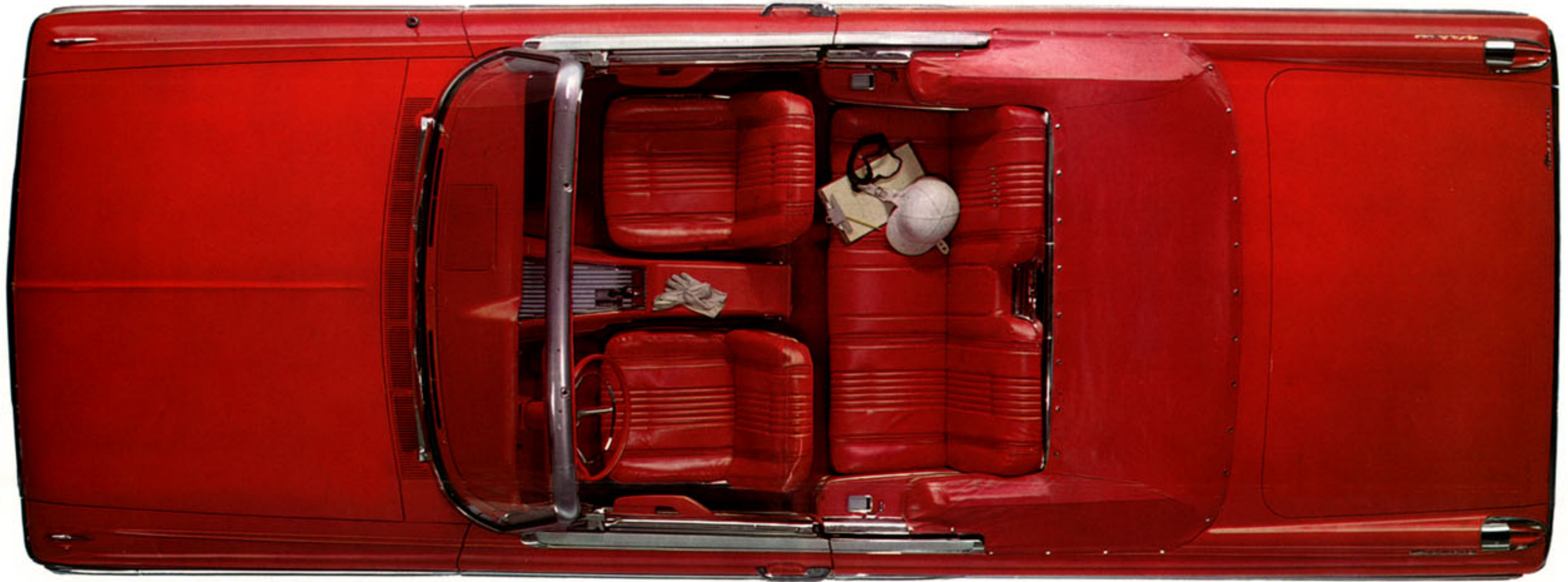
Mercury Monterey S-Fifty-Five convertible. Color: Carnival red with red crush-vinyl interior.