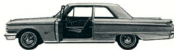
NEW STANDARD-SIZE MERCURY METEOR S-33