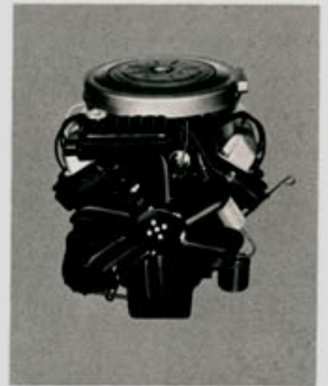
Mercury Monterey 390 V-8