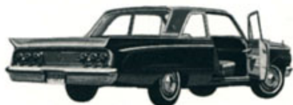
COMPACT MERCURY COMET S-22

Go Mercury for the best-looking bucket-seat buys . . . now in each size! Five luxury models, each with bucket seats, to suit every purse and personality . . . the compact Mercury Comet S-22, smartly ahead of the compact crowd . . . the compact Comet Villager, newest, most luxurious 6-passenger station wagon with optional front bucket seats . . . the new standard-size Mercury Meteor S-33, the beautiful balance between big cars and compacts . . . and, now, for the big-car man, the ultra-luxurious Mercury Monterey S-Fifty-Five in convertible or hardtop! See them—try them—and buy the one that suits you best!