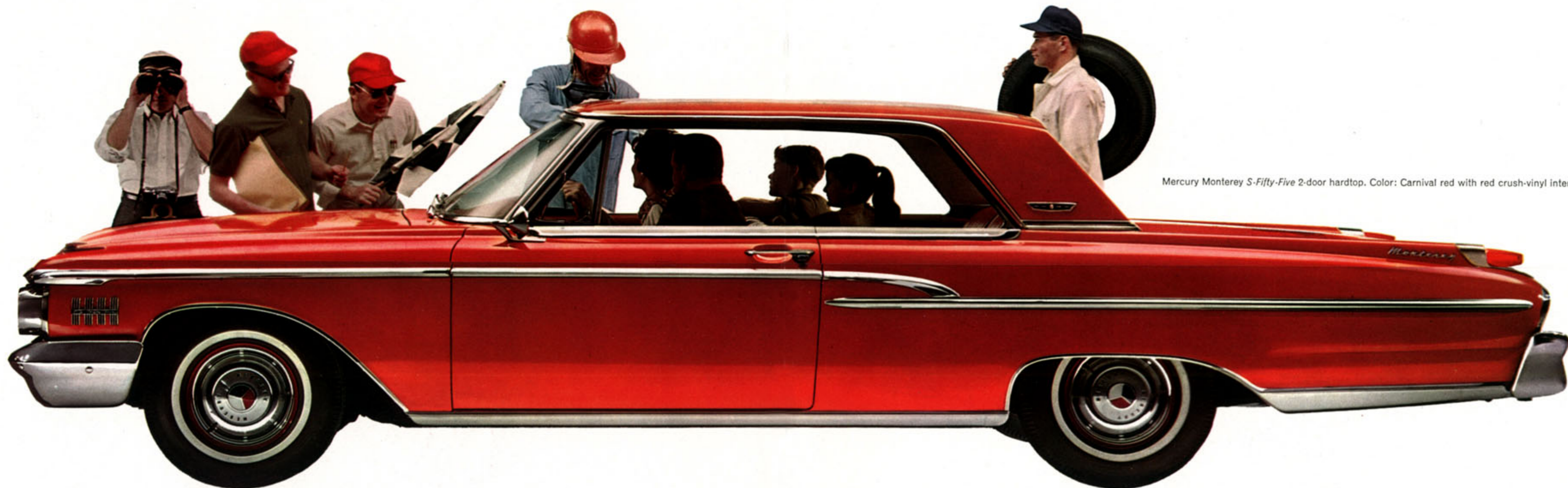
Mercury Monterey S-Fifty-Five 2-door hardtop. Color: Carnival red with red crush-vinyl interior.

Take the sports-car dash of bucket seats, add big-car luxury, combine with sizzling performance and you have the matchless Monterey S-Fifty-Five! Newest of the stunning Mercury line for 1962, the S-Fifty-Five is available in two superb models. The beauty you see here is the Monterey S-Fifty-Five 2-door hardtop. Now lift the page for a look at its rakish running mate, the S-Fifty-Five convertible... plus the features that place this power-packed pair in a class by themselves for elegance and action!