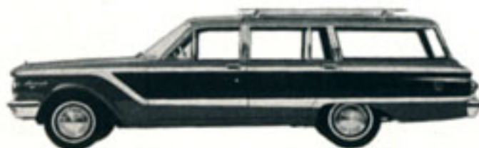
COMPACT MERCURY COMET VILLAGER