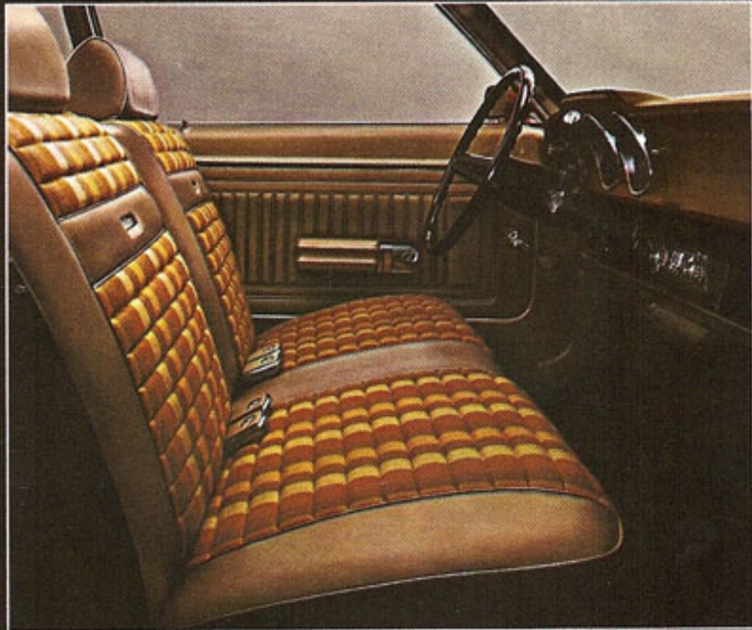
New optional Blazer Stripe Upholstery is offered in two colors.