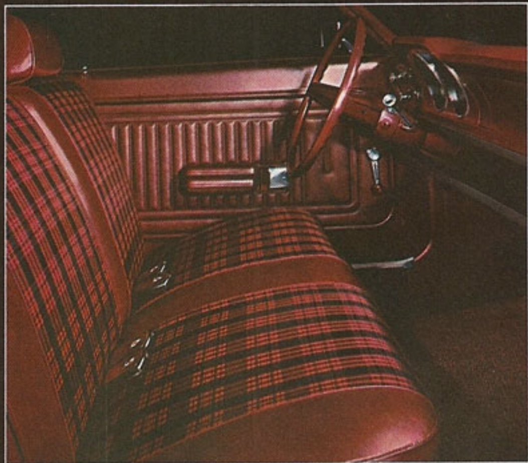
Tartan plaid standard trim comes in three color combinations.