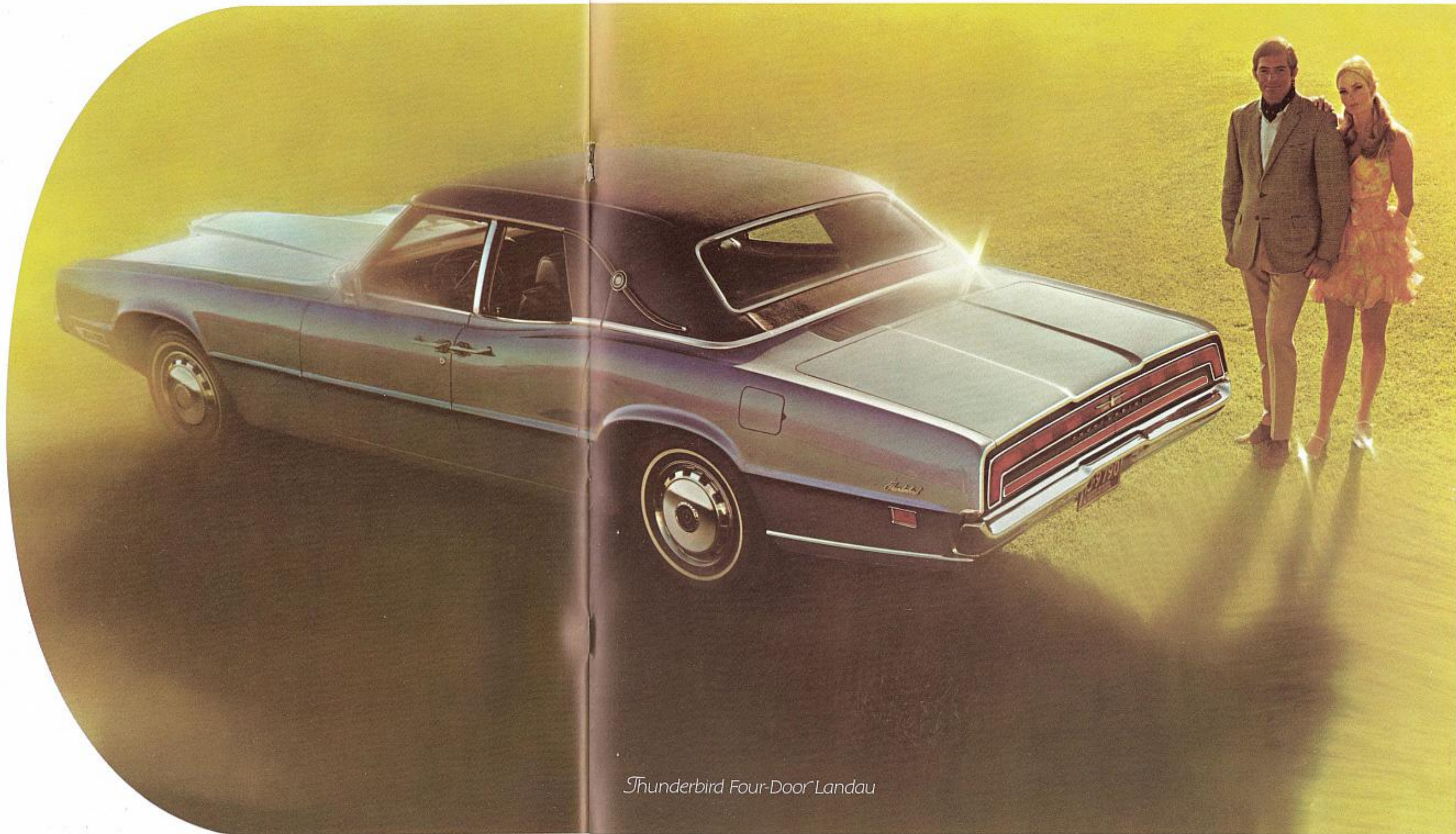
Thunderbird Four-Door Landau

When you consider these attributes along with the exhilarating performance of the Bird . . . the fluid, infinitely graceful feeling of flight, neighborly birdwatching is understandable. What your neighbors really want, of course, is an invitation to enjoy a test flight with you. Why not convert them to the good life?