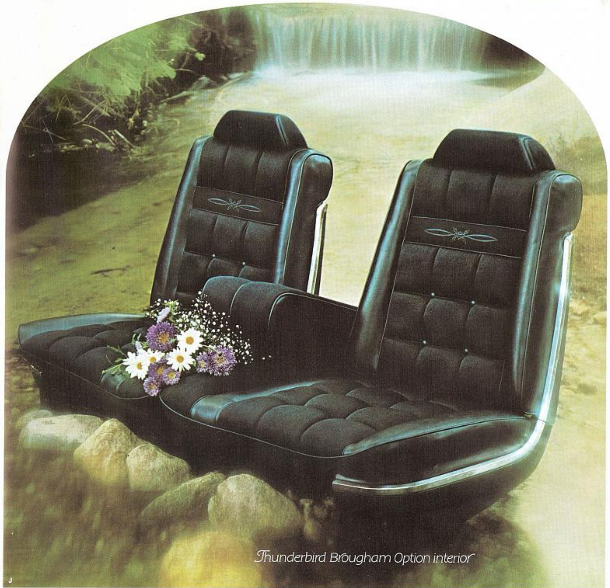
Thunderbird Brougham Option interior

Trim (facing page), a choice of rich cloth and vinyl (Flight Bench Two-Door, split-bench Four-Door) or vinyl with leather seating surfaces (high-back buckets Two-Door, split-bench Four-Door). Includes special door trim, woodtone appointments, cut-pile carpeting, courtesy lights, deluxe 3-spoke Rim-Blow Steering Wheel, rear seat fold-down armrest. Other comfort ideas — Tinted glass • Stereo-Sonic Tape/AM Radio System (with four speakers). Convenience ideas — Power trunk lid release • Fingertip Speed Control. Appearance ideas — Deluxe wheel covers, simulated "mag" wheel covers • White sidewall radial ply tires. Performance ideas — High axle ratio • Traction-Lok differential • Heavy-duty suspension • Sure-Track brake control system, and more.