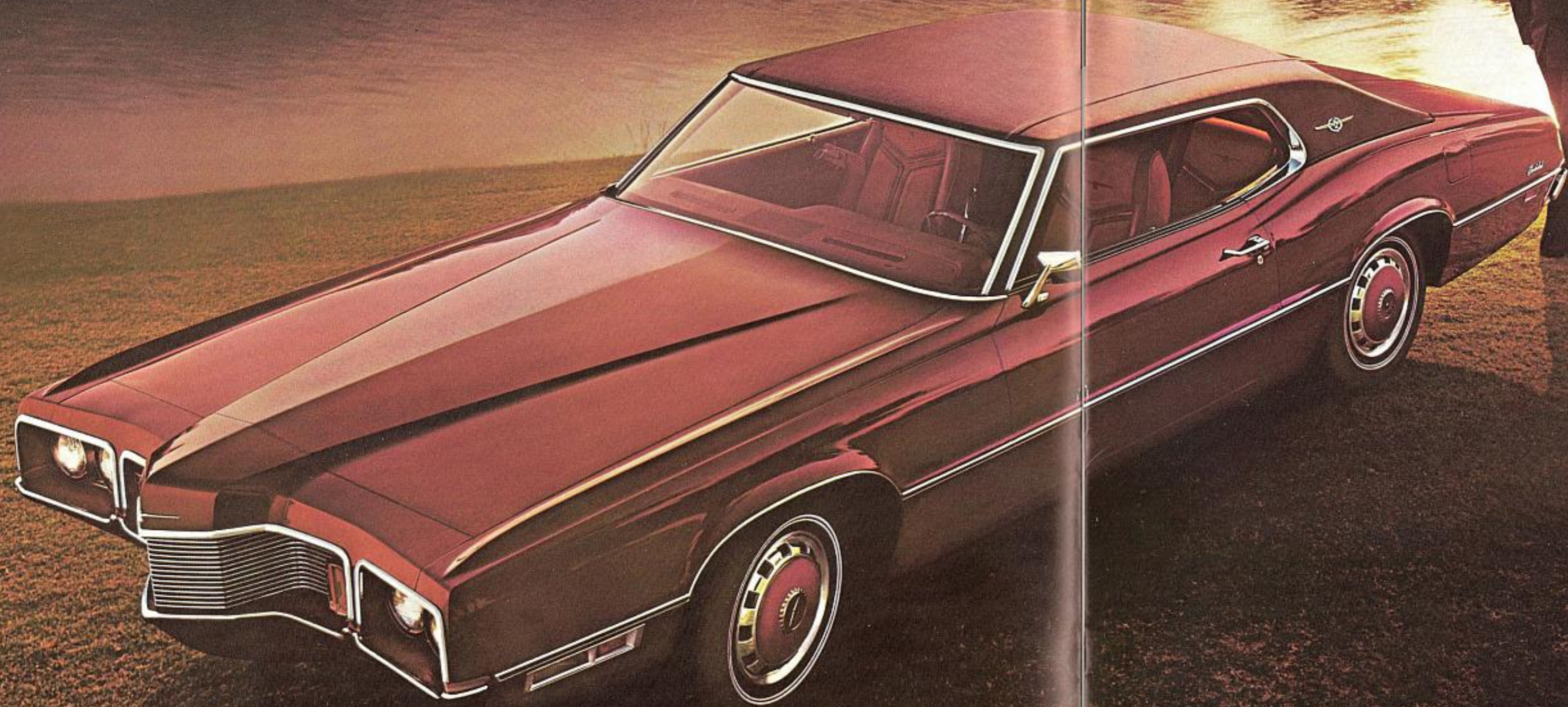
Thunderbird Two-Door Landau with Special Brougham Option