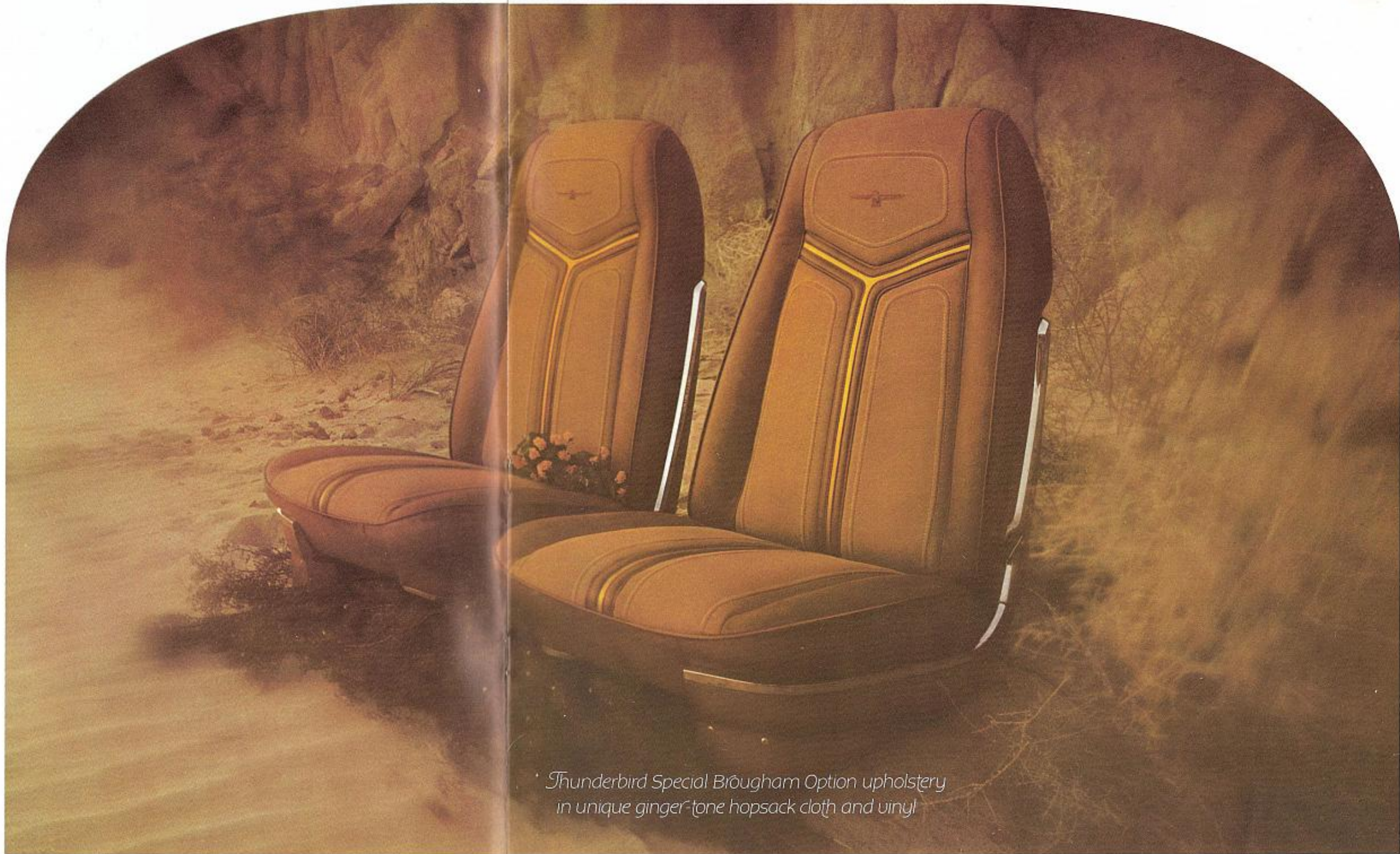
Thunderbird Special Brougham Option upholstery in unique ginger-tone hopsack cloth and vinyl

Standard trim on all models with bench or bucket seats is an attractive, sumptuous, glove-soft vinyl. Beautiful and functional, in four colors — ivy, black, white, blue. All fabrics, handsomely tailored, add that special touch of rare distinction you've come to expect from innovative Thunderbird. A total of 31 decorator color combinations offers ample opportunity to make your Bird more individually yours.