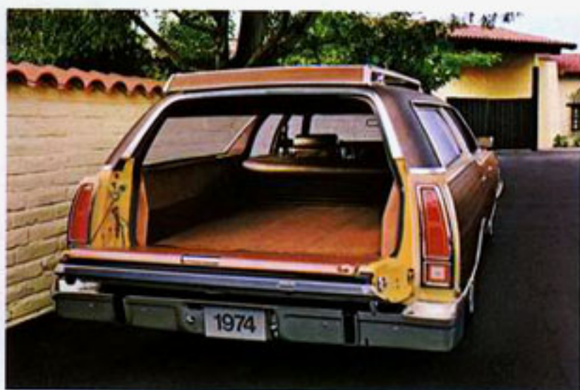
Mercury's 3-way tailgate in its role as a drop gate. Also swings away as a door. Standard on all Mercury wagons for '74.

No matter what kind of station wagon life your family leads, you'll find a Mercury wagon ready to go calling or hauling in stride. From versatile 3-way tailgate, standard in all models, to wide-ranging and unique options, Mercury wagons possess great talents for suiting personal needs.