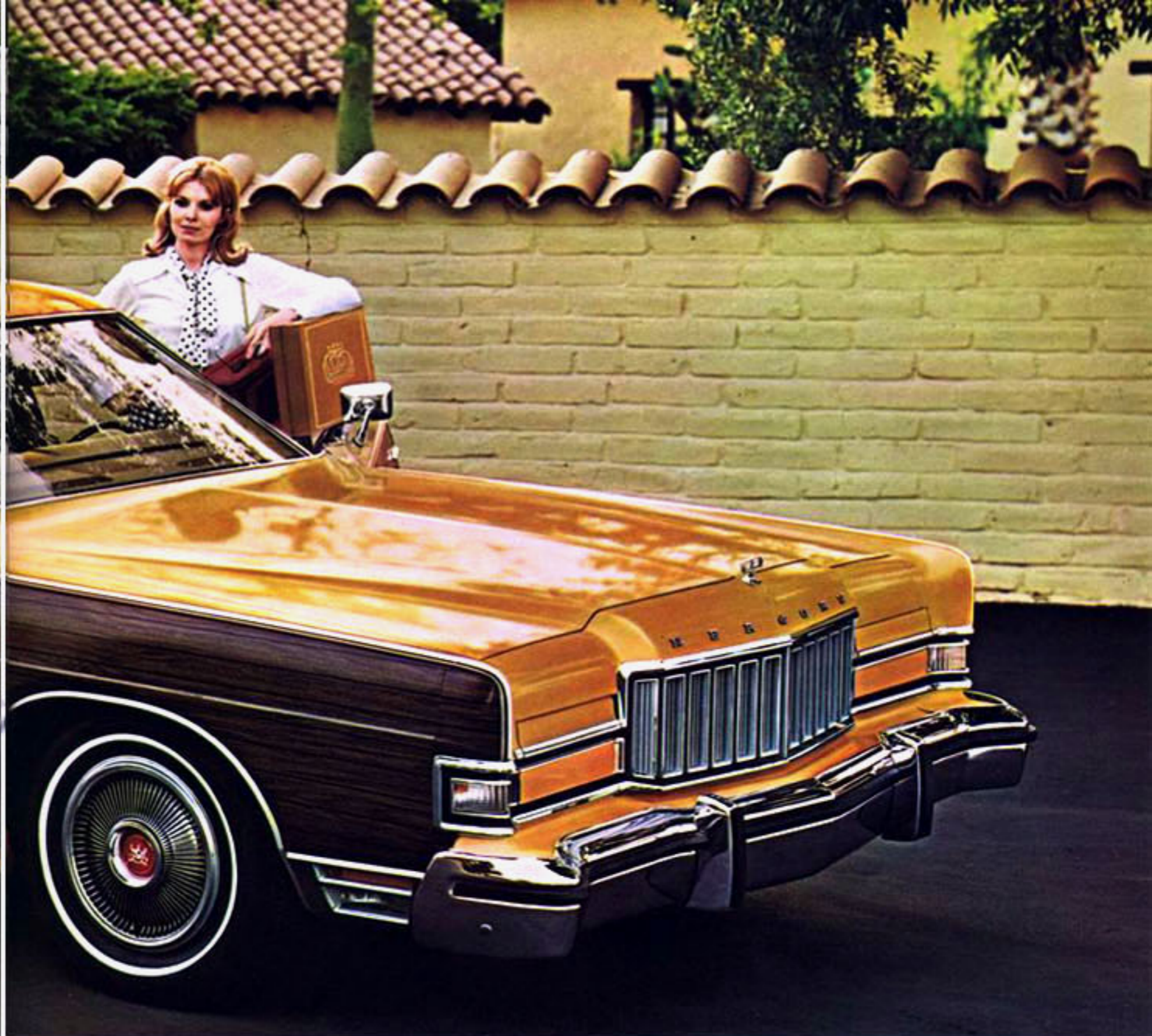
Mercury Colony Park Station Wagon