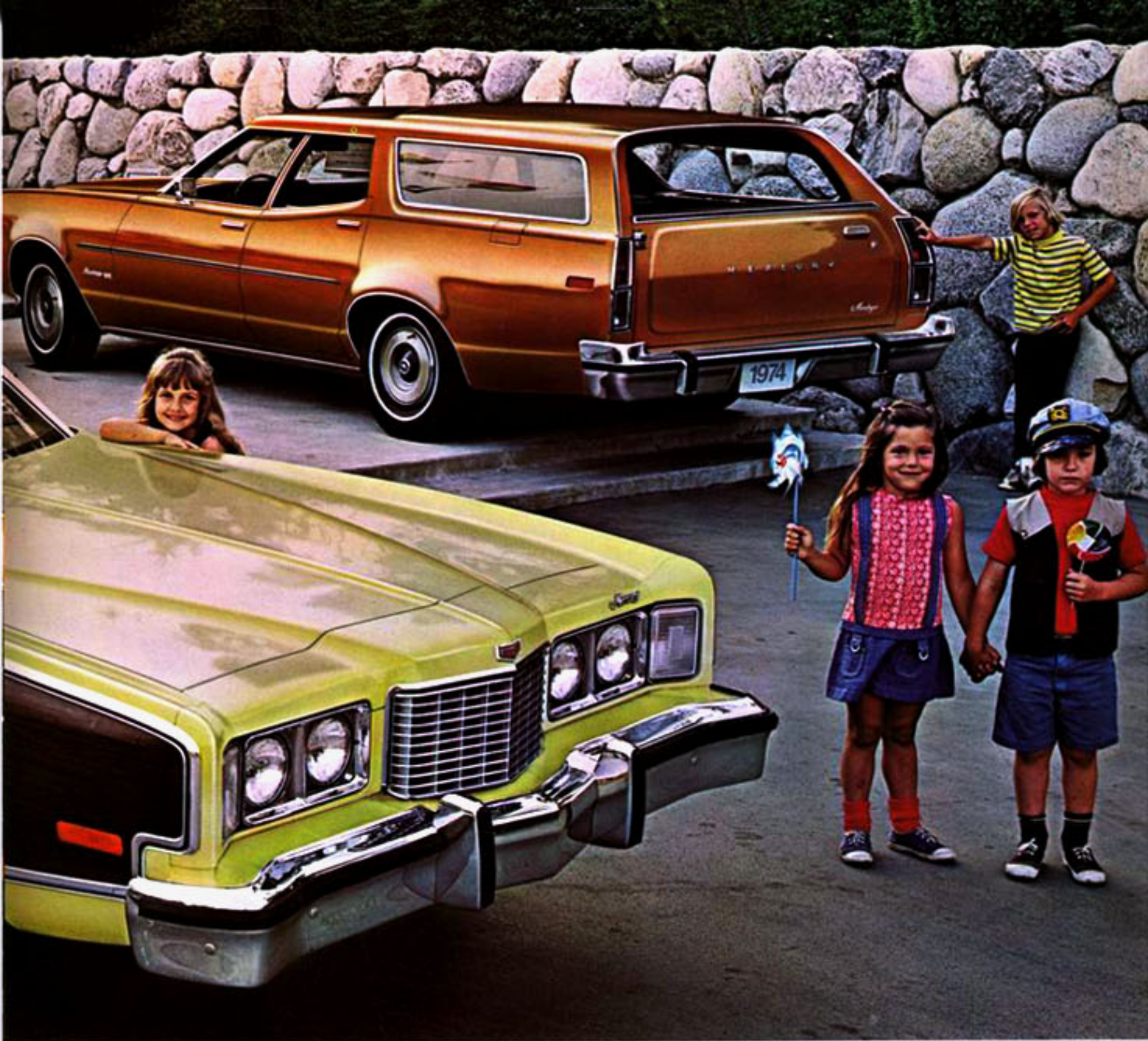
Mercury Montego MX Villager, foreground; Montego MX Station Wagon, background.