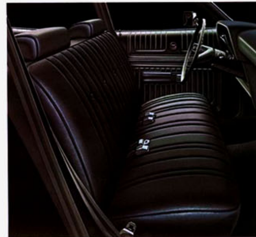
Mercury Montego MX Station Wagon standard interior

In addition, the Montego MX Villager offers: Simulated woodgrain bodyside and tailgate paneling with bright moldings • Power tailgate window • HR78 x 14 steel-belted radials • Flight bench seat with center armrest • Simulated cherrywood on instrument panel cluster face.