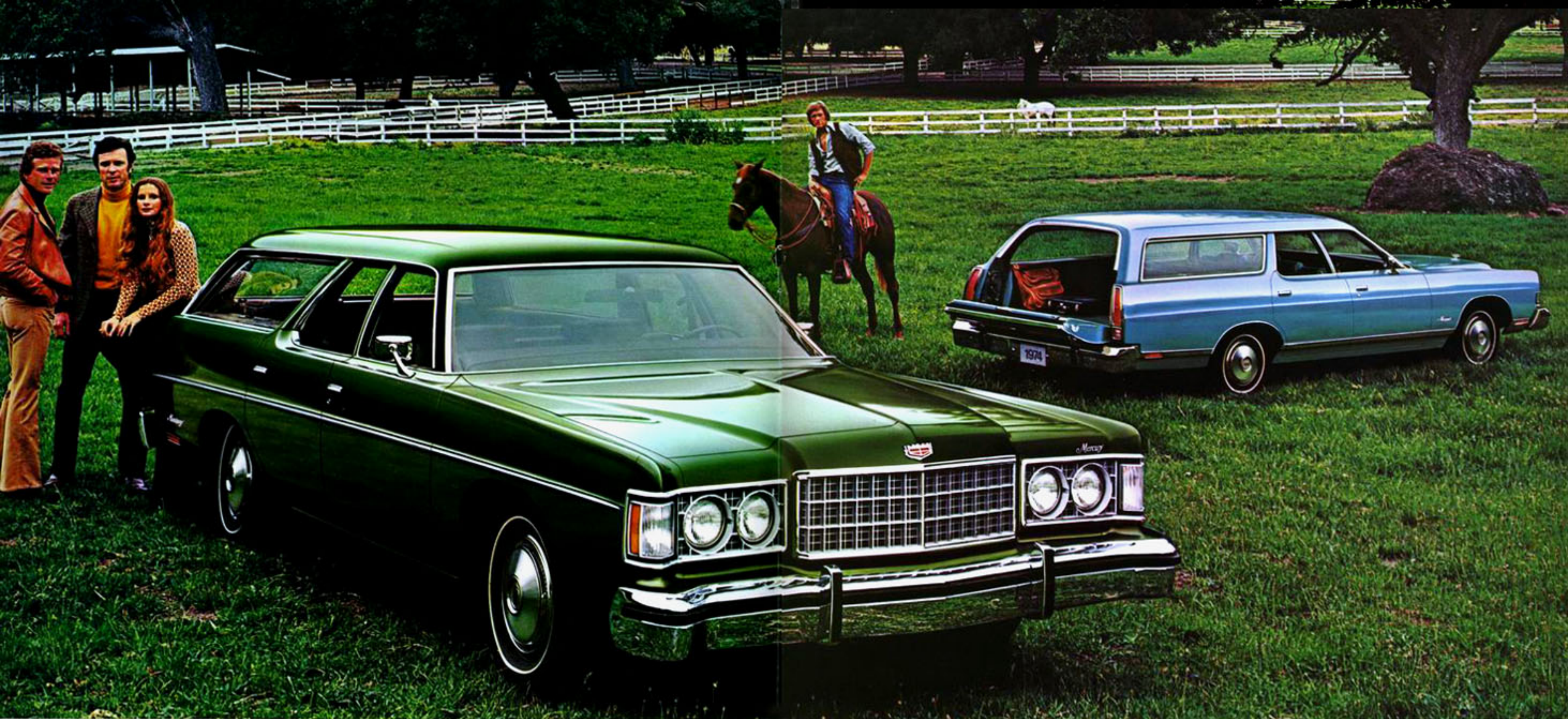
Foreground: Mercury Monterey Station Wagon; Mercury Marquis Station Wagon in background.