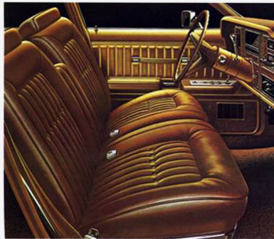
Mercury Colony Park with Grand Marquis Trim Option

Colony Park is as distinguished in the smoothness, quiet and comfort of its ride (steel-belted radial tires are standard) as in its notable look of luxury. Luxury not only on the outside, but in interiors too, as shown on the opposite page in the extra-cost Luxury Trim Option interior with Twin Comfort Lounge Seats in polyknit vinyl. This decor is available in medium blue, medium green and saddle. In super-soft all-vinyl it can be chosen in these colors plus black, tan and beige. This page shows the extra-cost Grand Marquis Luxury Trim Option with Twin Comfort Lounge Seats in vinyl with leather seating surfaces, available in tan.