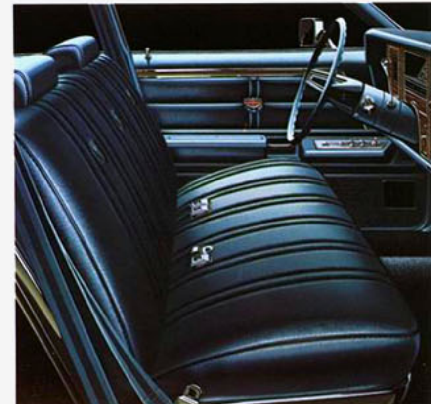
Mercury Marquis Station Wagon standard interior.

In addition, the Marquis Station Wagon offers: Electric clock • Deluxe two-spoke steering wheel • Bright seat side shields • Cargo area light • Rear door light switches