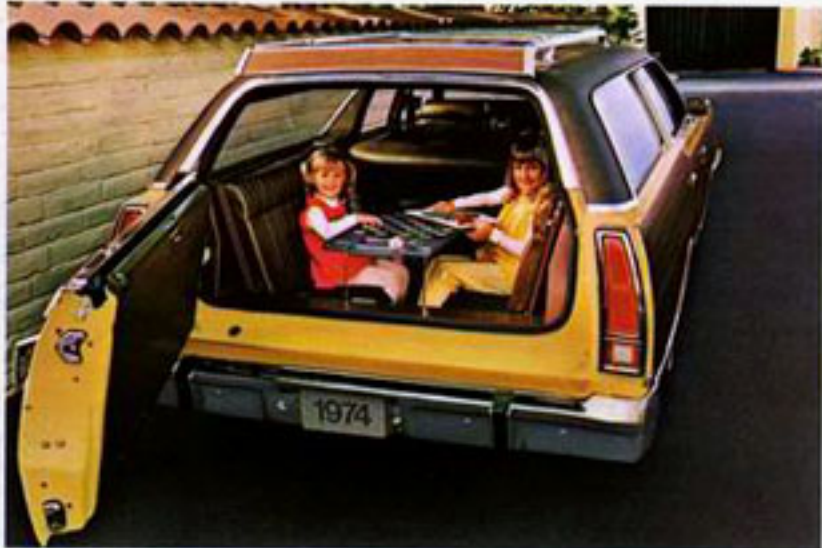
Dual center-facing rear seats are available as an option on all big Mercury wagons. Extra room for big families.