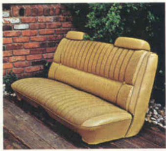
Royal Monaco interior features a deluxe Dorchester and Oxford cloth-and-vinyl bench seat standard.