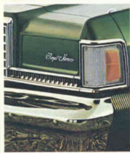
Hidden headlights are standard on Royal Monaco and Royal Monaco Brougham.