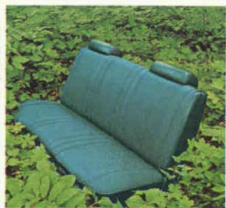
Standard Monaco interior includes cloth-and-vinyl front bench seats in blue, gold, green, and parchment.