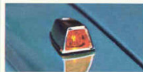
Monaco's standard Electronic Ignition and optional Fuel Pacer System.