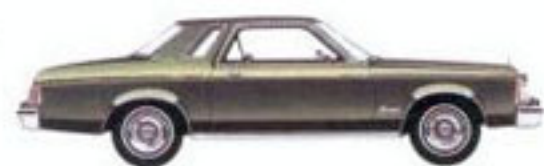
Granada 2-Door Sedan, Dark Yellow Green Metallic (4V). Granada 4-Door Sedan also available.