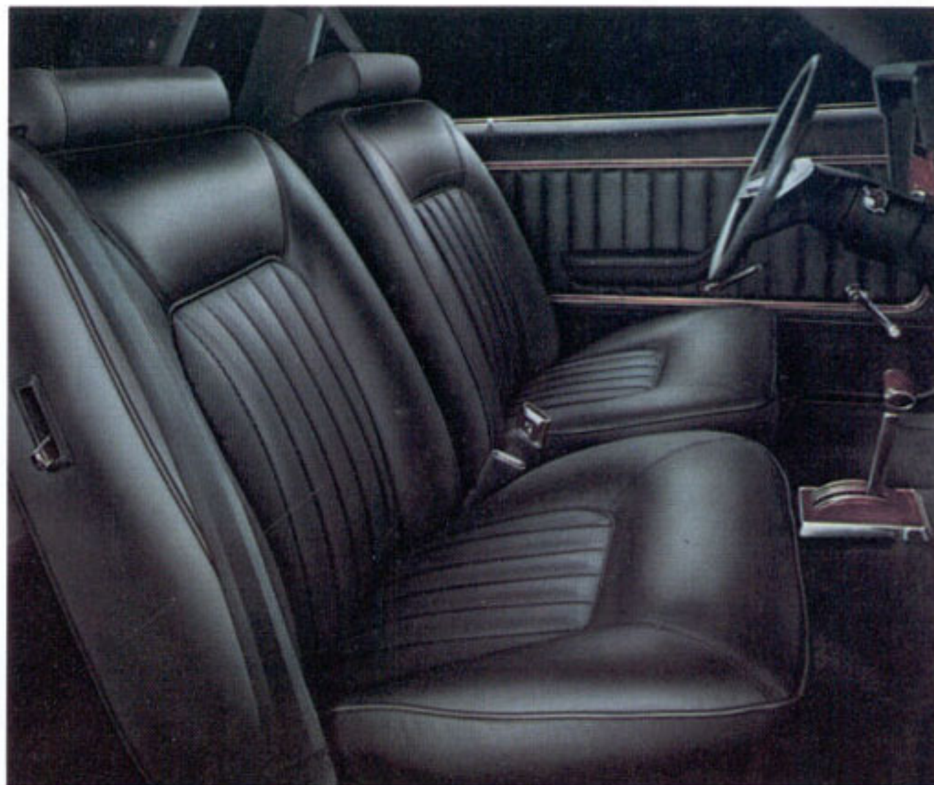
Granada 2-Door Sports Sedan