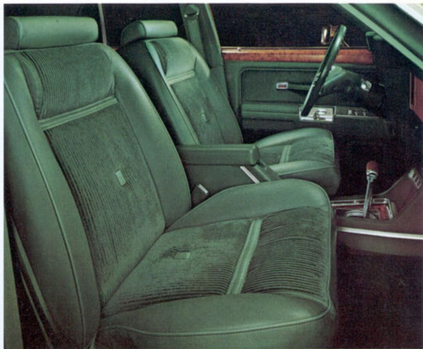
Ghia 4-Door Sedan with Luxury Decor Option