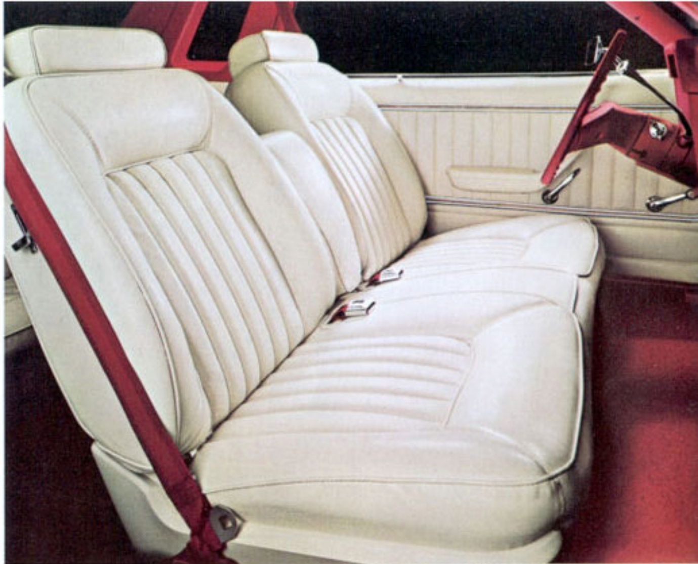
Granada 2-Door Sedan