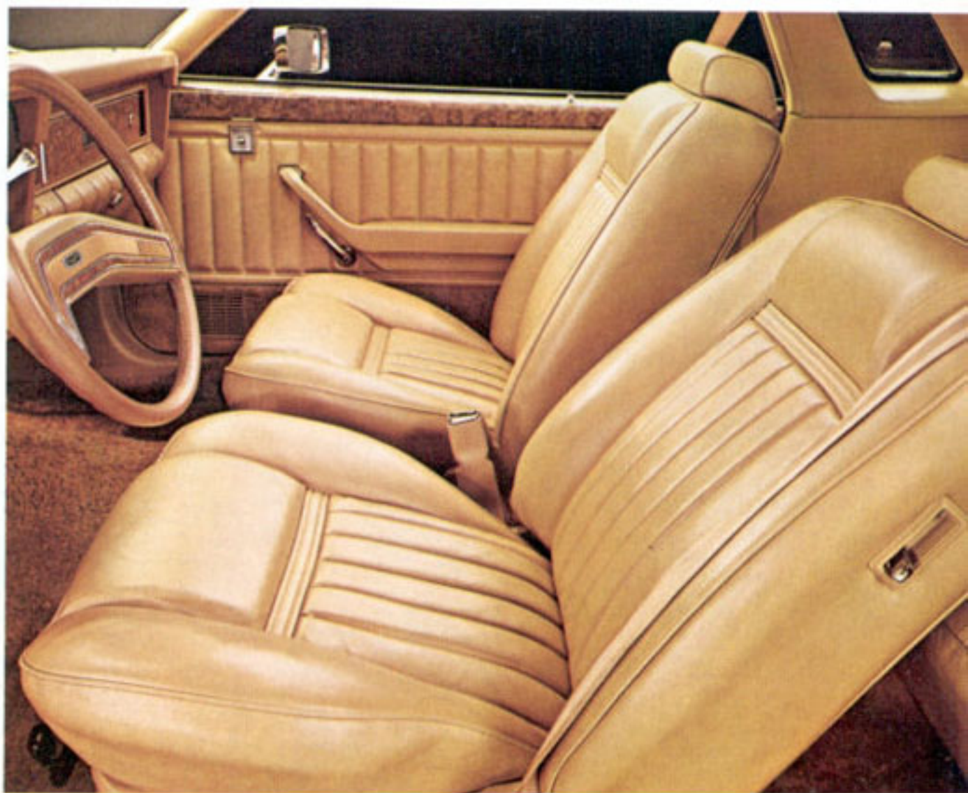
Granada Ghia 2-Door Sedan