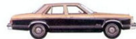
Granada Ghia 4-Door Sedan, Tan Glow/Black (5U, 1C). Granada Ghia 2-Door Sedan also available.