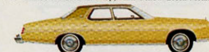
LTD 4-Door Pillared Hardtop, Tan Glow (5U).