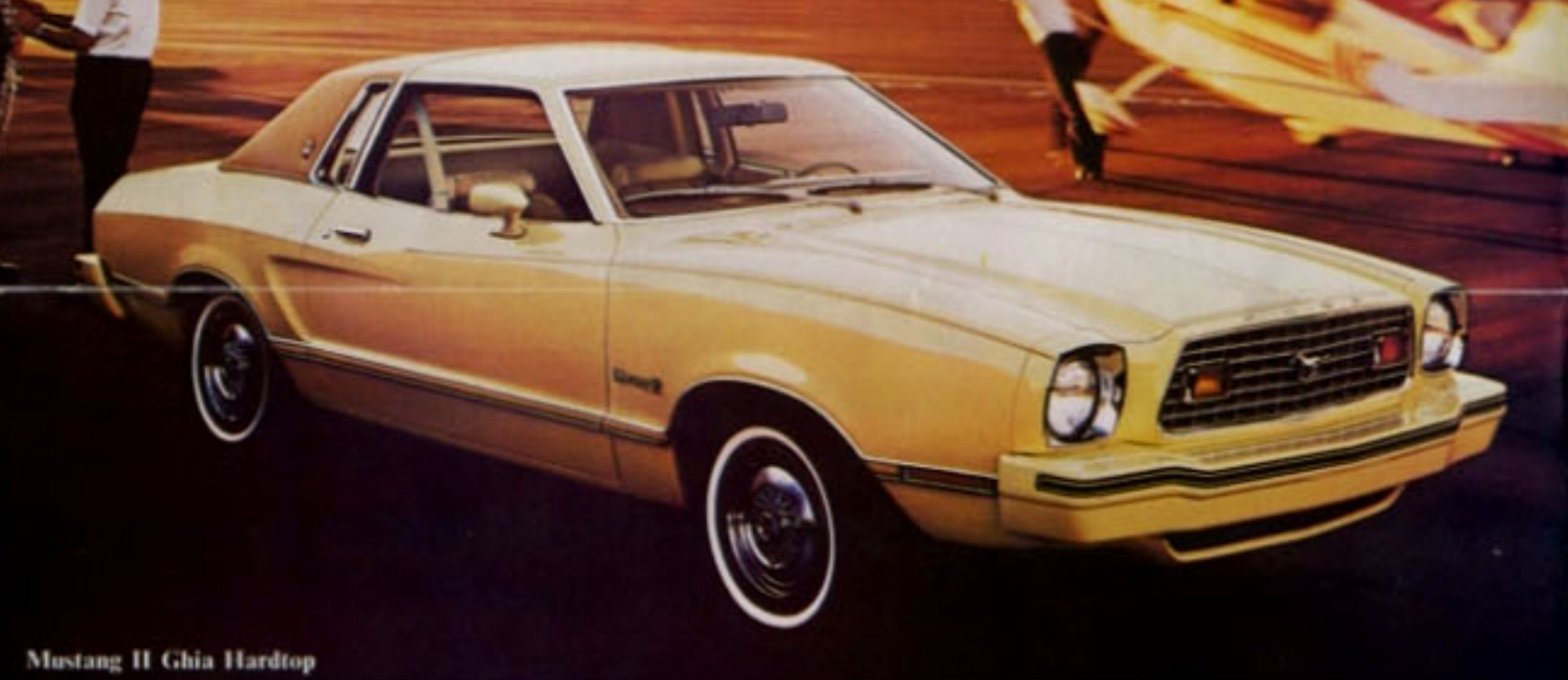
Mustang II Ghia Hardtop

America's best-selling small luxury car. You'll feel younger as soon as you see Mustang II's exciting choice of models and options. There are three glamorous Luxury Groups for your selection: Silver, Tan Glow or Silver Blue Glow. Mustang II offers two body styles in four models: the fastback-styled 3-door 2+2 and Mach 1 with fold-down rear seat, or the formal roofline Hardtop and Ghia. The standard power is a thrifty 2.3 liter engine with 4-speed floor shift. You can get the optional 302 CID V-8 (with SelectShift Cruise-O-Matic) or 2.8 liter V-6 (with manual 4-speed). Or choose the exciting new Stallion Group exterior for the 2+2 and 2-Door Hardtop models. In small sporty cars, too, Ford means value. Mustang II Ghia Hardtop (left) is shown in Creme (Code 6P) with Creme vinyl half roof. Exterior appointments include opera windows, wire design wheel covers, bright ornamentation and color-keyed urethane-covered bumper. Mustang II Ghia Interior (right) is shown in Creme and Gold Westminster cloth (Code DV) □ Standard features include low-back bucket seats, shag carpeting, woodtone accents, deluxe door trim panels and choice of cloth or vinyl seats. For more details and illustrations, see your Ford Dealer for a 1976 Mustang II Catalog.