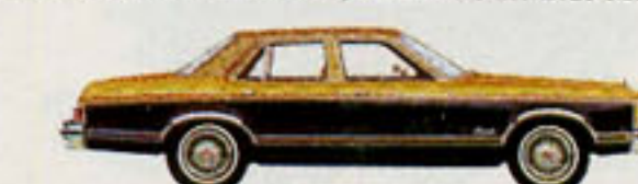
Granada Ghia 4-Door Sedan, Black/Tan Metallic (1C, 5U).