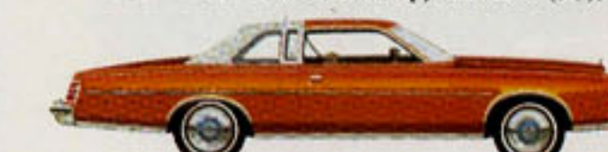
LTD Brougham 2-Door Pillared Hardtop, Saddle Bronze Metallic (5T).