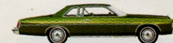
LTD 2-Door Pillared Hardtop, Dark Yellow Green Metallic (4V).