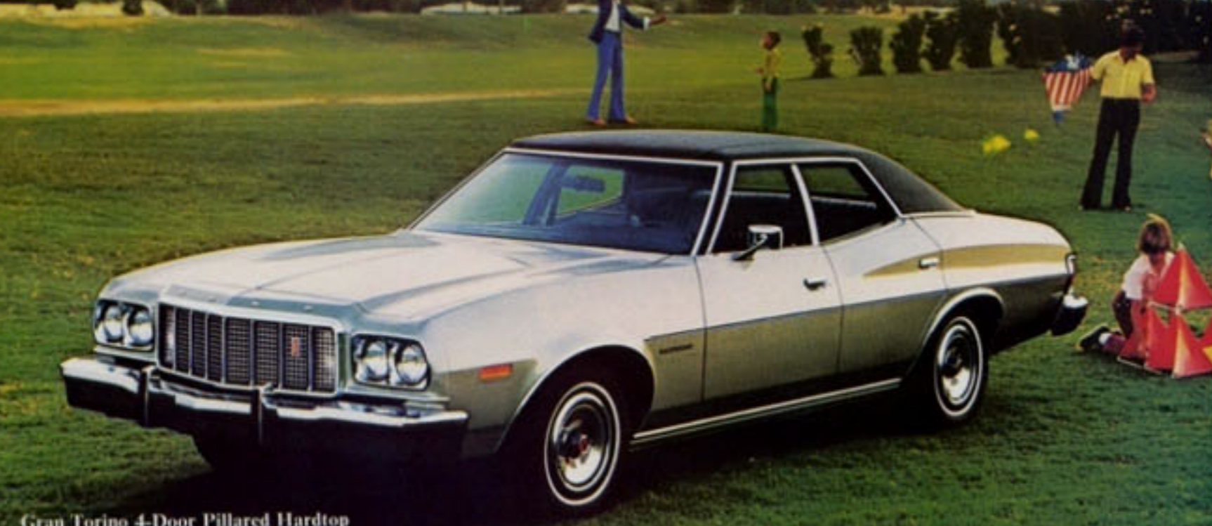
Gran Torino 4-Door Pillared Hardtop

Torino is the great mid-size buy. Torino is a roomy, well-equipped mid-size. Smooth, responsive V-8. Automatic transmission. Power steering. Power front disc brakes. Steel-belted radial ply tires. Six-passenger comfort. Plus the looks, finish and appointments of more expensive cars. Torino is noted for its smooth, solid ride and famous Ford quiet. Satisfy your budget and your good taste with a choice of six 2- and 4-door models: 2 Torinos, 2 Gran Torinos and 2 Gran Torino Broughams, including the elegant 2-Door Hardtop with vinyl roof and opera windows. Even three wagons. Ford means value in the mid-size field and Torino is the proof. Gran Torino 4-Door Pillared Hardtop (left) is shown in Silver Metallic (Code 1G) with Black vinyl roof. Roomy six-passenger family-size comfort with 4-door convenience. Exterior features include bright belt, drip, quarter window, windshield and wheel lip moldings. Gran Torino Cloth and Vinyl Interior (right) with deep-cushioned bench seat, features handsome pleated brocade pattern cloth in Medium Blue (Code BB). Cut-pile carpeting is color-keyed. For more details and illustrations, see your Ford Dealer for a 1976 Torino Catalog.