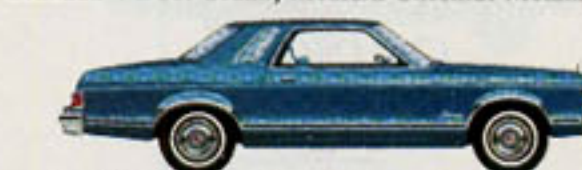
Granada Ghia 2-Door Sedan, Medium Slate Blue Metallic (1H).