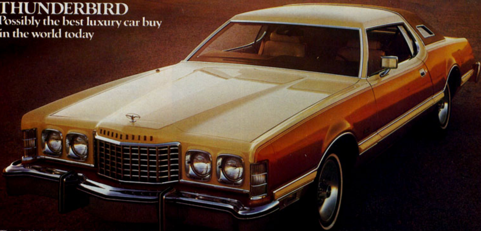
Thunderbird with Creme and Gold Luxury Group

Possibly the best luxury car buy in the world today