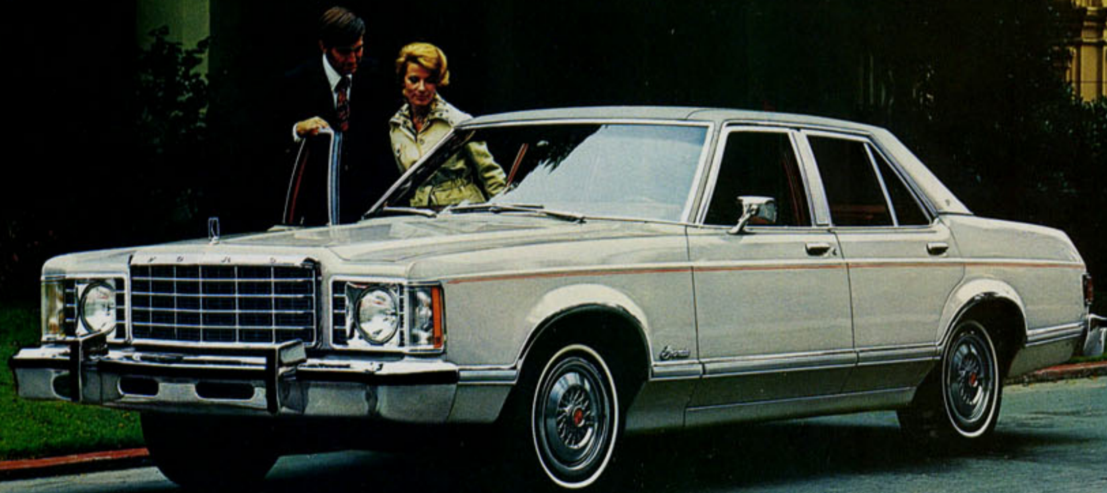
Granada Ghia 4-Door Sedan