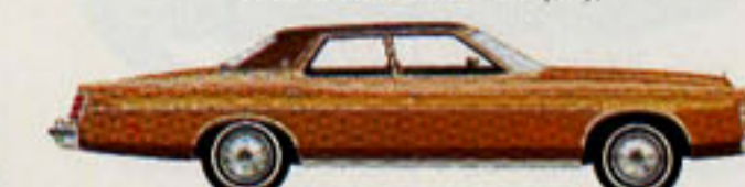
LTD Brougham 4-Door Pillared Hardtop, Light Gold (6W).