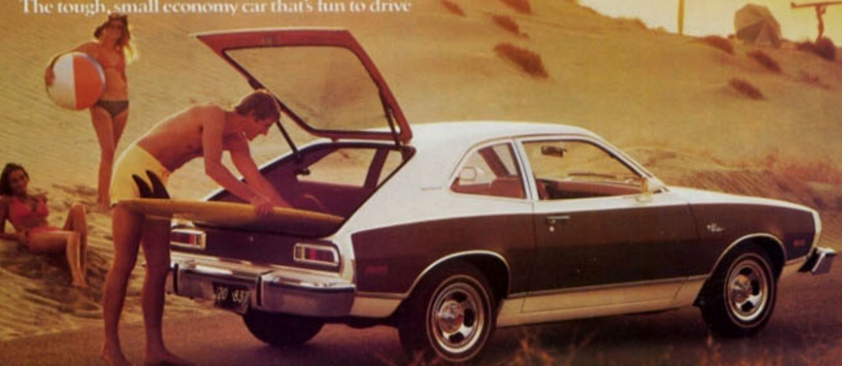
Pinto 3-Door Runabout with Squire Option

Easy price, easy upkeep, easy at the wheel. That's the combination that has made Pinto a best seller year after year. And for 1976 Pinto takes on a brighter, fresher look—with new grille and front end ornamentation and a choice of all-vinyl or cloth and vinyl seats, and, of course, Pinto's traditional economy in initial price, fuel and scheduled maintenance. It all adds up to new evidence that Ford means value. There's a 2-Door Sedan, 3-Door Runabout and the Wagon that outsells them all, big or small. A 2.3 liter 4-cylinder engine with solid state ignition is standard. So are bucket seats, rack and pinion steering and 4-speed floor shift. Even a modest budget will cover options like the new Stallion Group which gives your Runabout special sporty exterior styling. Pinto 3-Door Runabout with Squire Option (left) features woodgrain vinyl paneling on bodyside and lower back panel with bright surround moldings, belt, drip and window moldings and wheel covers. Easy-lift door opens to 29 cu. ft. of cargo space with rear seat down. Shown in Tan (Code 6U). Handsome Plaid Cloth Interior (right). Add touches of luxury to your little economy Pinto with the Luxury Decor Group: woodtone instrument panel applique, deluxe door trim panels, custom steering wheel, passenger door courtesy light switch, rear seat ash tray, and more. Tan (Code DU). For more details and illustrations, see your Ford Dealer for a 1976 Pinto Catalog.