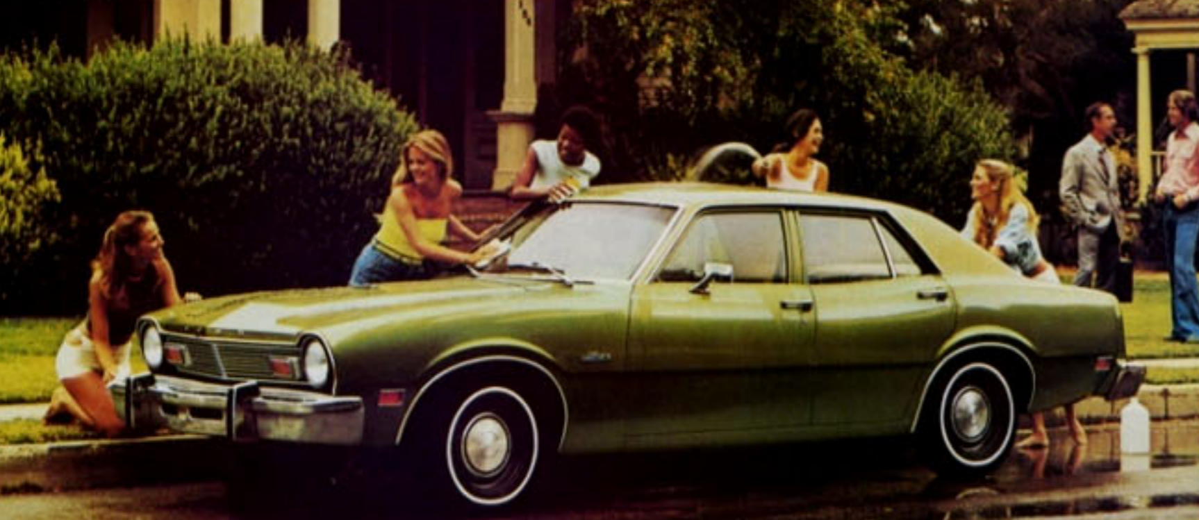
Maverick 4-Door Sedan

Backed by millions of owner-driven miles. No compact car has more going for it than Maverick. It's a simple, reliable family-size compact with a reputation for dependability, easy service and low scheduled maintenance expense. When you compare compacts, you'll see that Ford means value. Maverick offers models and options to suit every taste and driving need. Choose the 2- or 4-Door Sedan, or give your Maverick 2-Door the sports car look with the new Stallion Group option of distinctive exterior dress-up trim. There are two thrifty 6-cylinder engines, a 200* and 250 CID, and a peppy 302 CID V-8. New this year are standard equipment front disc brakes. Maverick 4-Door Sedan (left) in Green Glow (Code 4T). It's big enough to seat five adults and carry more than 13 cu. ft. of luggage, yet small enough to park and handle easily. An ideal economical compact car. And has the same-type Lifeguard Design Safety Features found in our bigger Fords. Maverick's roomy standard interior (right) has deep-cushioned bench seats nearly 5 feet across. They're trimmed in attractive Random stripe cloth and vinyl, shown here in Green (Code BG). Carpeting, European-type door pull armrests, recessed door handles are standard. For more details and illustrations, see your Ford Dealer for a 1976 Maverick Catalog.