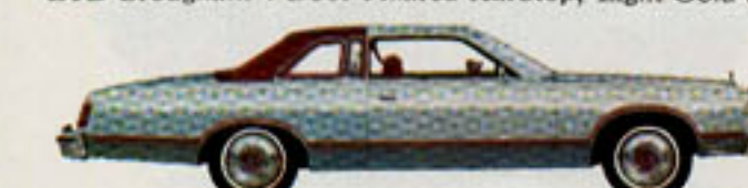
LTD Landau 2-Door Pillared Hardtop, Silver Metallic (1G).