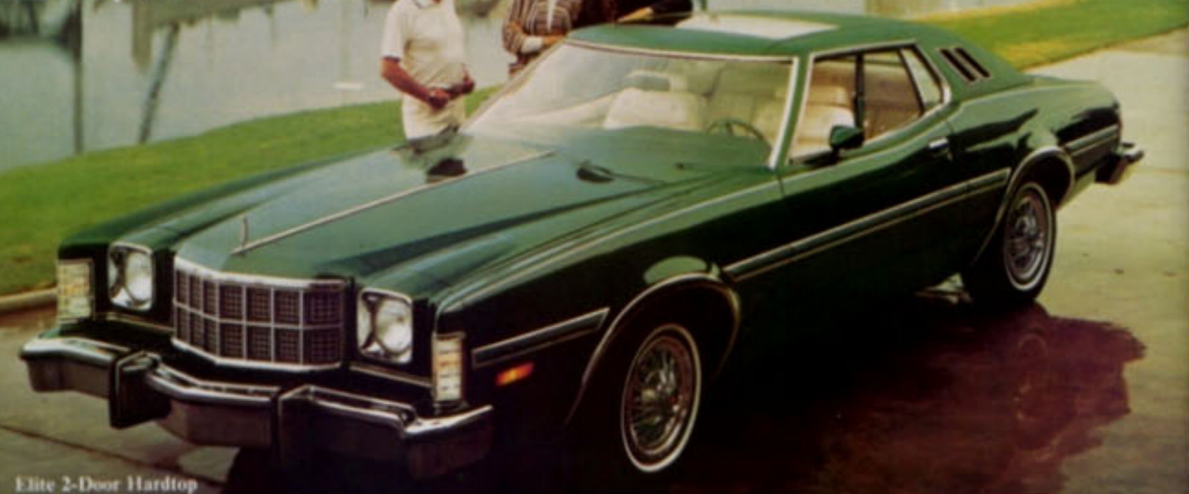
Elite 2-Door Hardtop

Styled to keep you apart from the crowd, priced so you can enjoy it now. Ford has brought a fine road car into the mid-size field. Along with its superb roadability, the Elite gives you a full measure of luxury at a reasonable price. You see elegant Elite touches everywhere—full or half vinyl roof standard at no extra charge, twin opera windows, distinctive exterior brightwork, generous soundproofing, and interior appointments that distinguish Elite as a personal car. Besides all its standard features, the Elite is available with a wide variety of options, including a power Moonroof. While the Elite keeps costs down with its many maintenance-reducing features—it lifts your spirits up every time you take to the road. Elite—spirited proof that Ford means value. Elite 2-Door Hardtop (left) has a look of its own with its distinctive grille, twin opera windows and vinyl roof. Dark Jade Metallic (Code 46) with Jade vinyl roof. Interior Decor Group (right) is a personal luxury option that includes individually adjustable split bench seats with dual armrests, automatic seat back release, your choice of soft cashmere-like cloth or soft all-vinyl trim, shag carpeting, visor vanity mirror, color-keyed deluxe belts, dual note horn, and even a special 8-pod instrument panel with tachometer. Shown in super-soft vinyl, White with Jade trim (Code D2). Bucket seats also available. For more details and illustrations, see your Ford Dealer for a 1976 Elite Catalog.