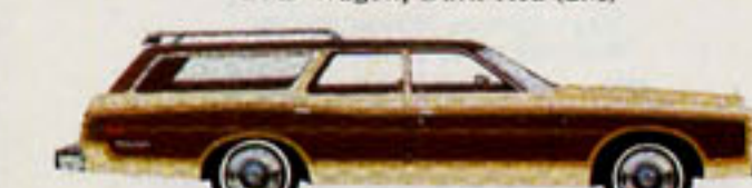
LTD Country Squire, Creme (6P).