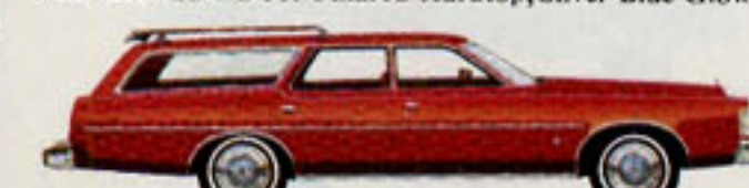
LTD Wagon, Dark Red (2M).