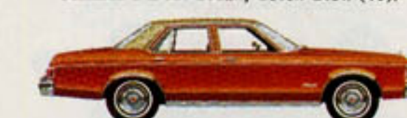
Granada 4-Door Sedan, Medium Chestnut Metallic (5M).