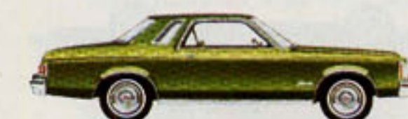
Granada 2-Door Sedan, Green Glow (4T).