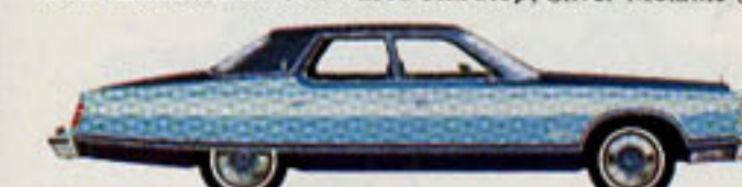
LTD Landau 4-Door Pillared Hardtop, Silver Blue Glow (3M).