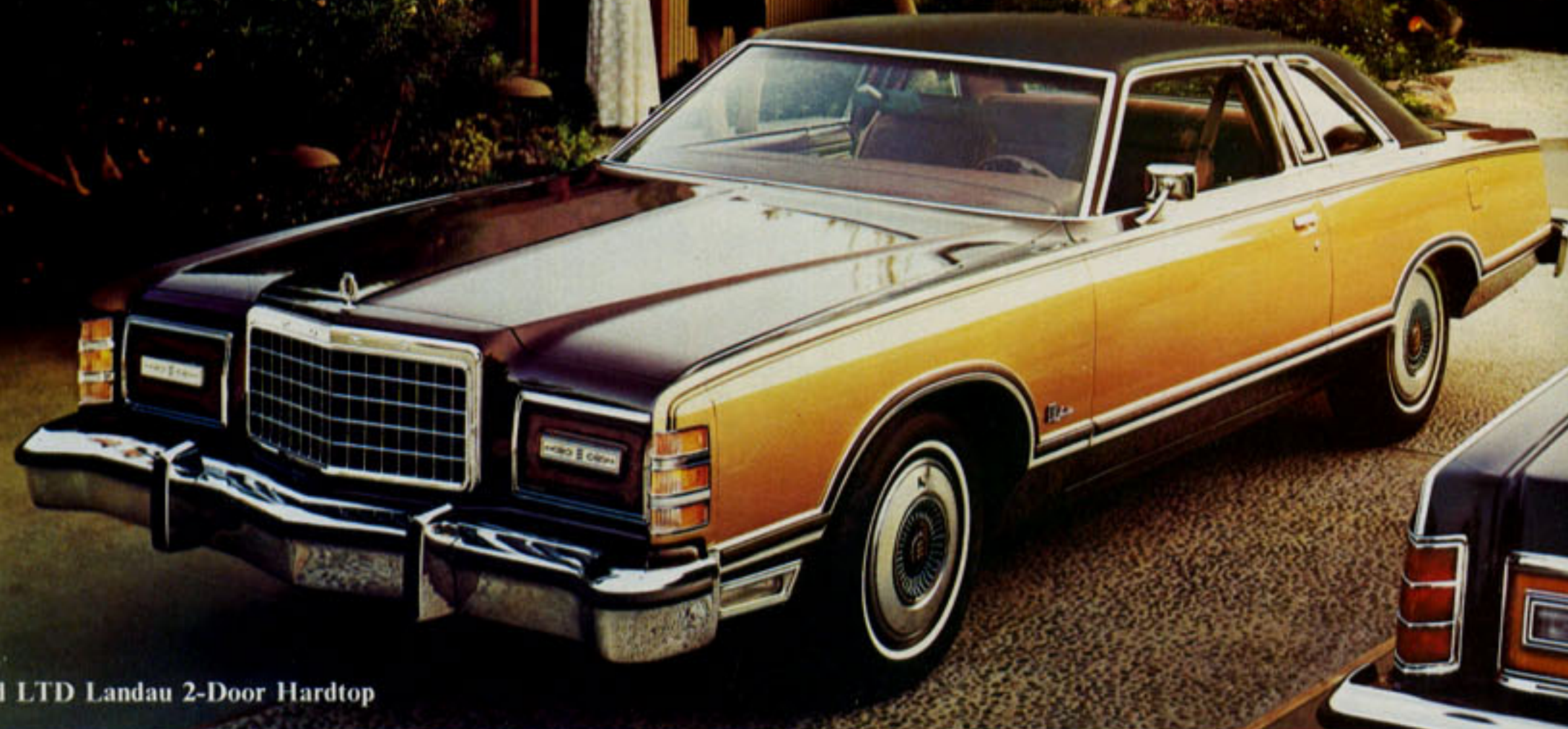
Ford LTD Landau 2-Door Hardtop