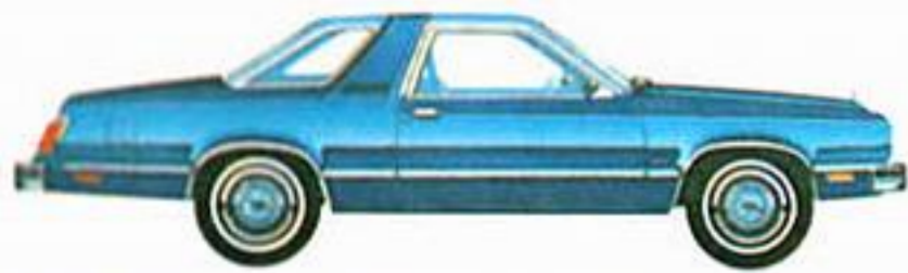
Fairmont Futura, Blue Glow (3H)