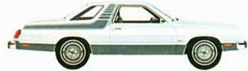
Fairmont Futura with Sport Group,* Tu-Tone Silver Metallic (1G)/Med. Grey Metallic (1P)