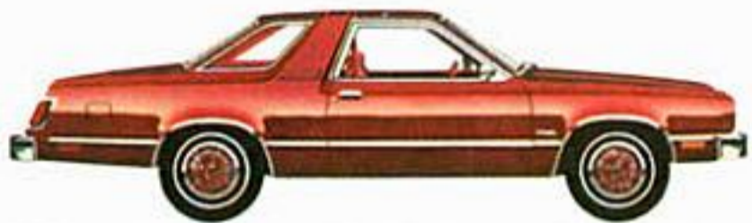
Fairmont Futura with Ghia Luxury Group,* Red Glow (2H)