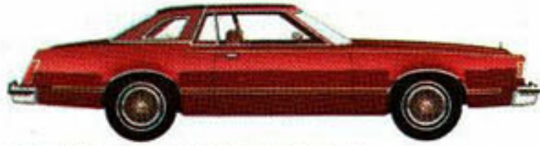
LTD II Brougham 2-Door Hardtop. Dark Red (2M)