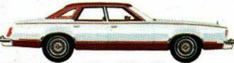
LTD II Brougham 4-Door Pillared Hardtop. Tu-Tone Silver Metallic (1G), with Dark Red (2M)