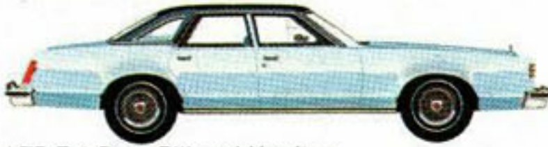
LTD II 4-Door Pillared Hardtop. Light Medium Blue (3F)