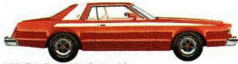
LTD II 2-Door Hardtop with Sports Appearance Package.* Burnt Orange Glow (5N)