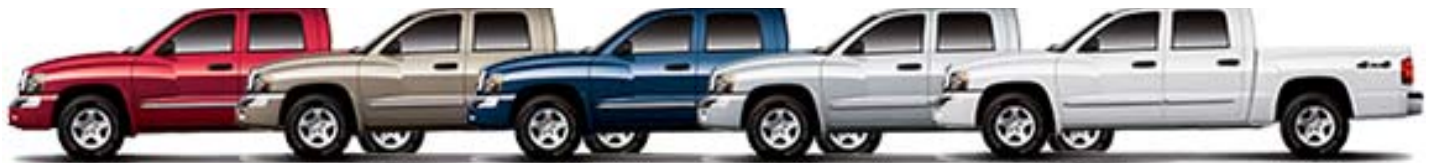
Inferno Red Crystal Pearl