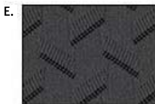
A. Laguna cloth in Slate Gray