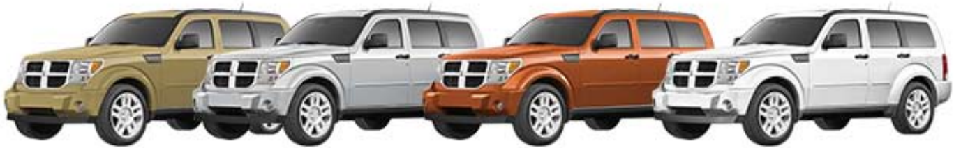
Light Khaki Metallic Clear Coat