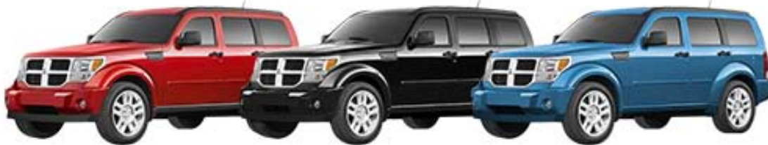
Inferno Red Crystal Pearl Coat