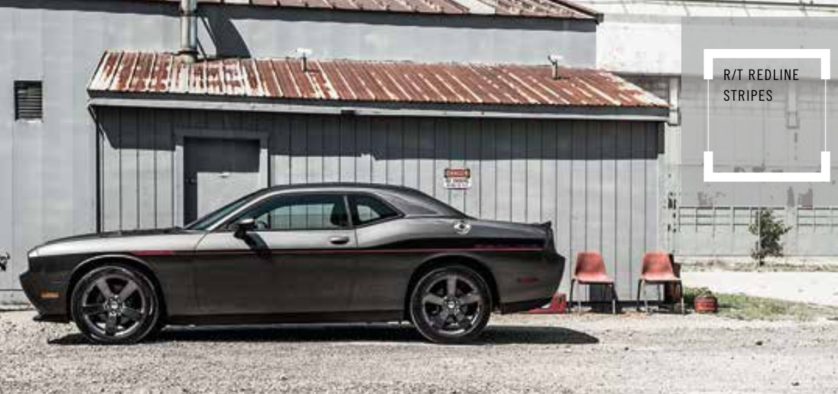
R/T REDLINE STRIPES