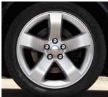
18-inch aluminum (standard on SXT, SXT Plus, R/T and R/T Plus)