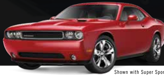
Shown with Super Sport Group