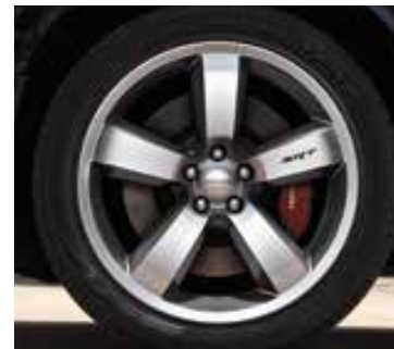
20-inch polished forged aluminum with Black pockets (standard on SRT 392)