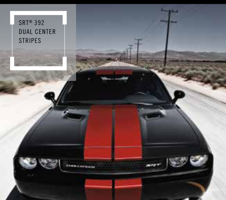
SRT® 392 DUAL CENTER STRIPES