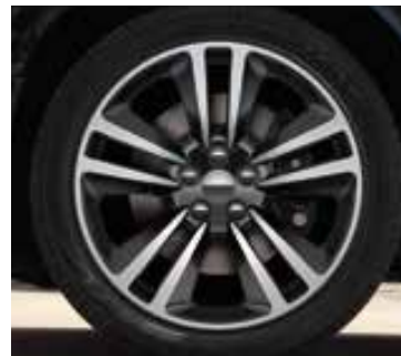
20-inch cast aluminum with Black pockets (standard on SRT® Core)