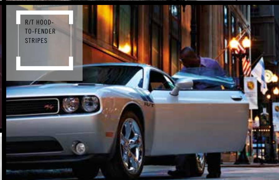
R/T HOOD-TO-FENDER STRIPES