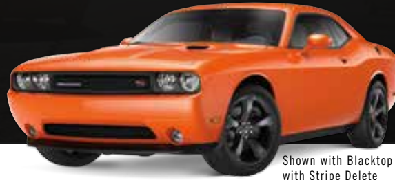
Shown with Blacktop Package with Stripe Delete