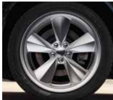
20-inch Heritage II polished forged aluminum (optional on R/T Classic)