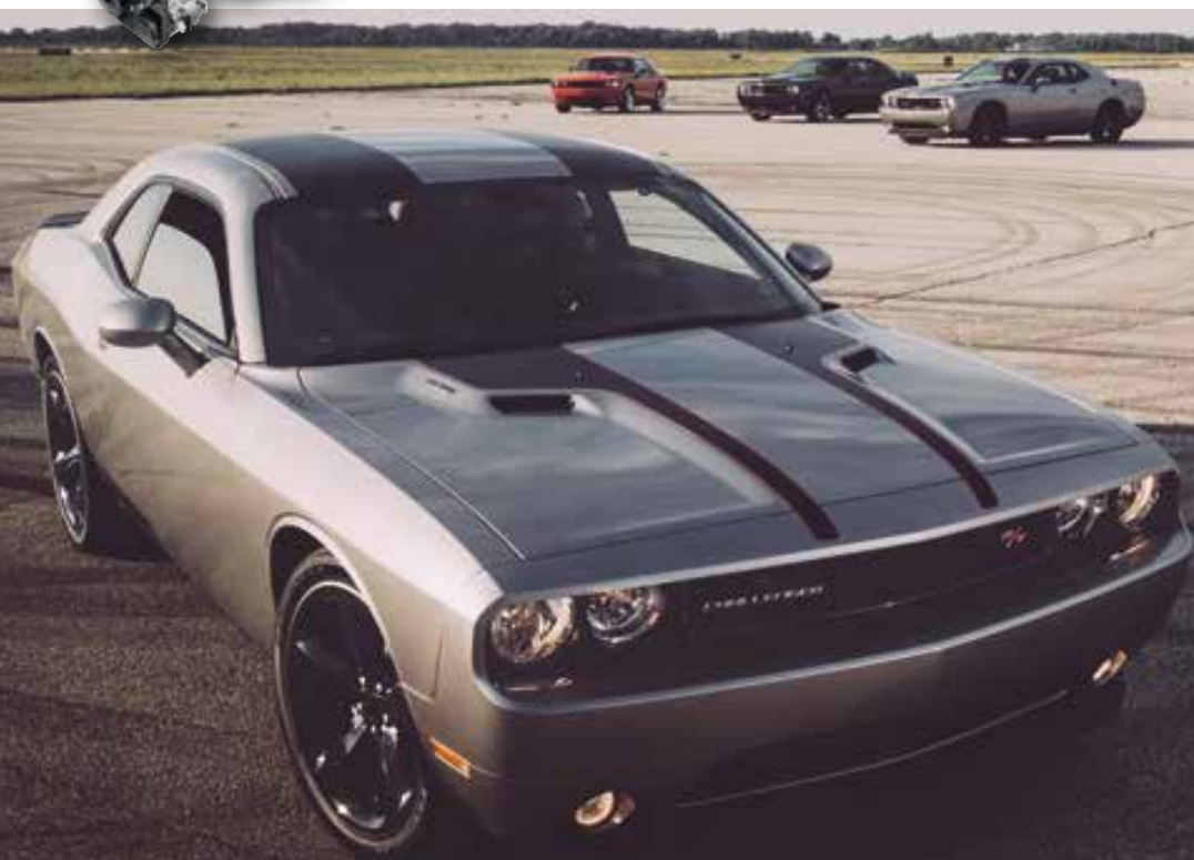
Challenger R/T Blacktop shown in Billet Silver Metallic with Blacktop stripes.

392-CU-IN SRT® HEMI V8 WITH 470 LB-FT OF TORQUE