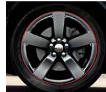
20-inch Black Chrome aluminum with Red lip/backbone (standard on Rallye Redline and included in R/T Redline Group on R/T and R/T Plus)