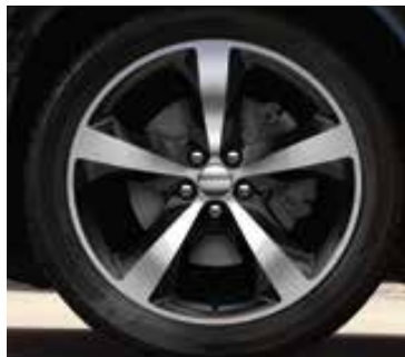
20-inch polished aluminum with Gloss Black pockets (standard on R/T Classic)