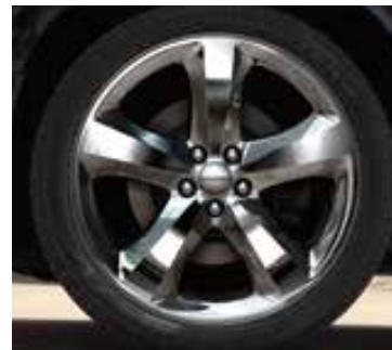
20-inch chrome-clad aluminum (included in Super Sport Group on SXT and SXT Plus and optional on R/T and R/T Plus)