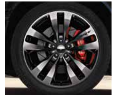
20-inch Black Vapor Chrome aluminum (optional on SRT Core and SRT 392)