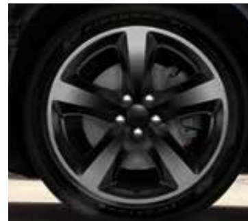
20-inch Gloss Black aluminum (included in Sinister Super Sport Group on SXT, SXT Plus and in Blacktop Package on R/T and R/T Plus)