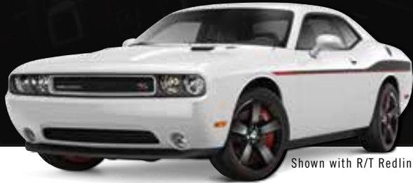
Shown with R/T Redline Group