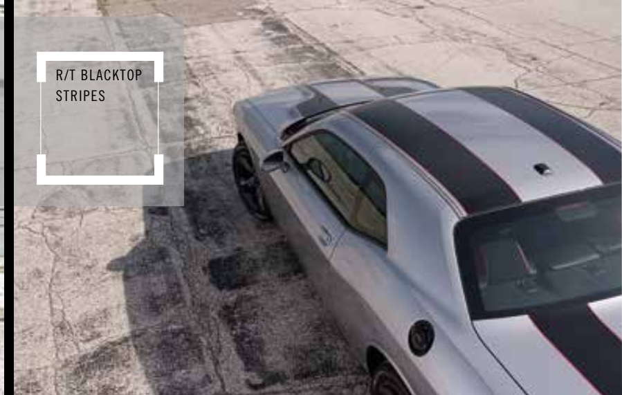
R/T BLACKTOP STRIPES