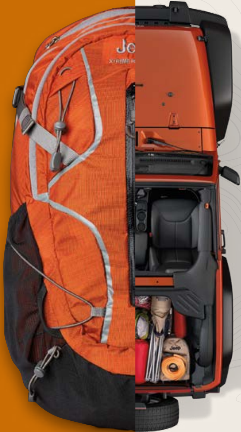
SPORT SHOWN IN COPPERHEAD PEARL.

ADVENTURISTS TAKE NOTE: GETTING OUT THERE IS ALWAYS FUN, BUT TAKING ALONG YOUR GEAR COMPLETES THE PICTURE. WRANGLER IS DESIGNED TO ACCOMMODATE WITH ITS ABUNDANT STORAGE AND CONFIGURATION OPTIONS.