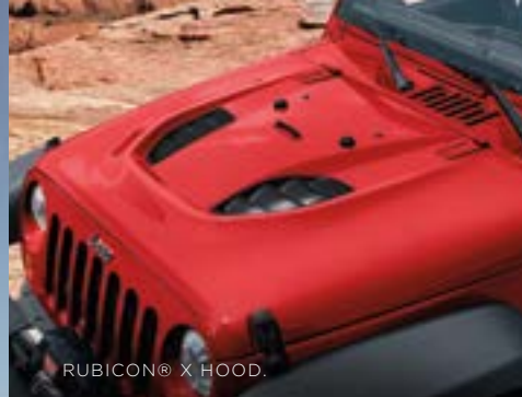
RUBICON® X HOOD.