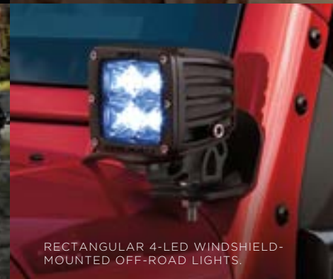
RECTANGULAR 4-LED WINDSHIELD-MOUNTED OFF-ROAD LIGHTS.