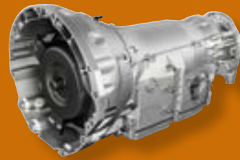
5-SPEED AUTOMATIC TRANSMISSION WITH AUTOSTICK.