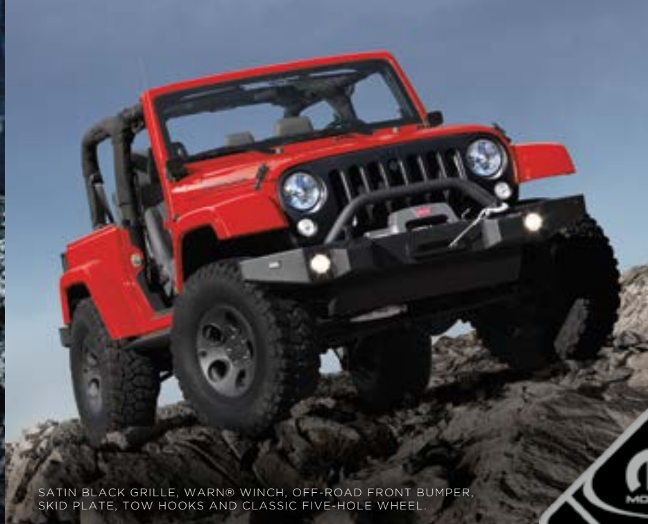
SATIN BLACK GRILLE, WARN® WINCH, OFF-ROAD FRONT BUMPER, SKID PLATE, TOW HOOKS AND CLASSIC FIVE-HOLE WHEEL.