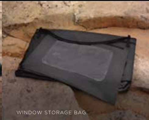
WINDOW STORAGE BAG.