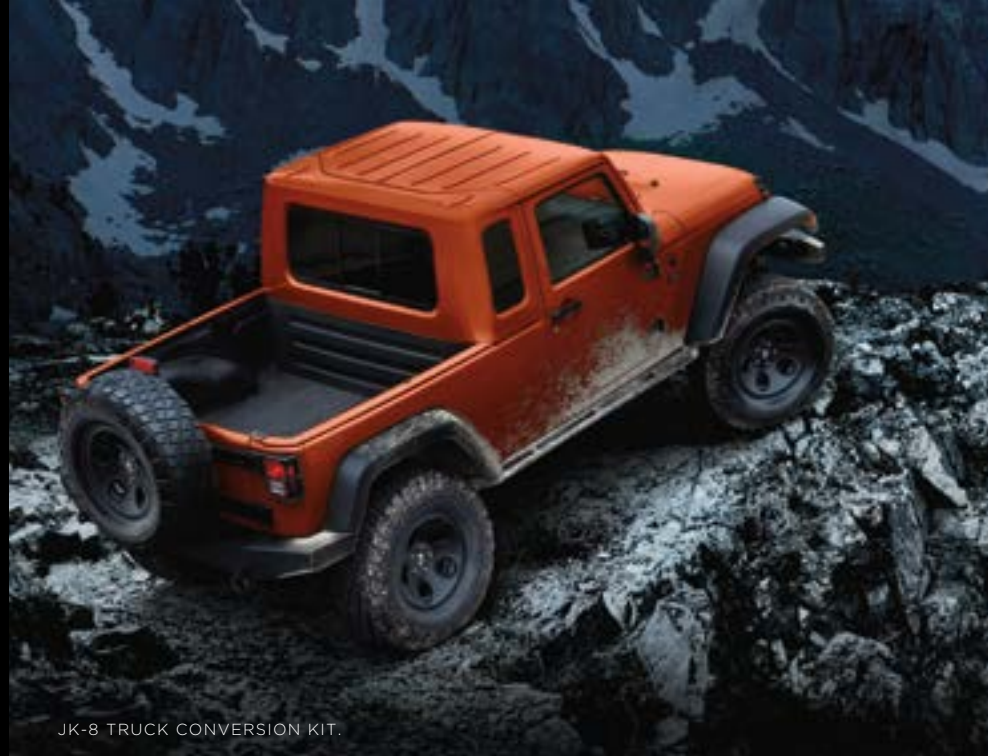
JK-8 TRUCK CONVERSION KIT.

Choose Mopar® for quality parts and accessories made to custom-fit your Wrangler. Mile after mile, you'll keep going strong with our expert technicians, genuine parts, Mopar Vehicle Protection™ plans, Express Lane Service and online Mopar Owner Connect™ Web site (register at owners.jeep.com). See your Jeep dealer for all the latest parts and accessories. You can learn more about the world of Mopar and all it has to offer at mopar.com