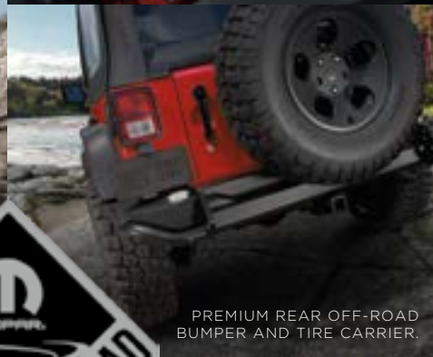
PREMIUM REAR OFF-ROAD BUMPER AND TIRE CARRIER.