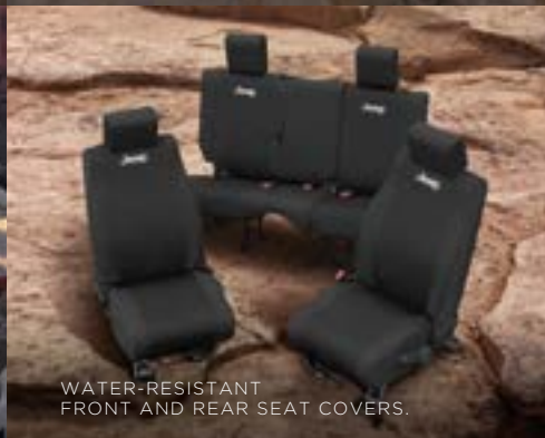
WATER-RESISTANT FRONT AND REAR SEAT COVERS.