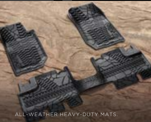
ALL-WEATHER HEAVY-DUTY MATS.