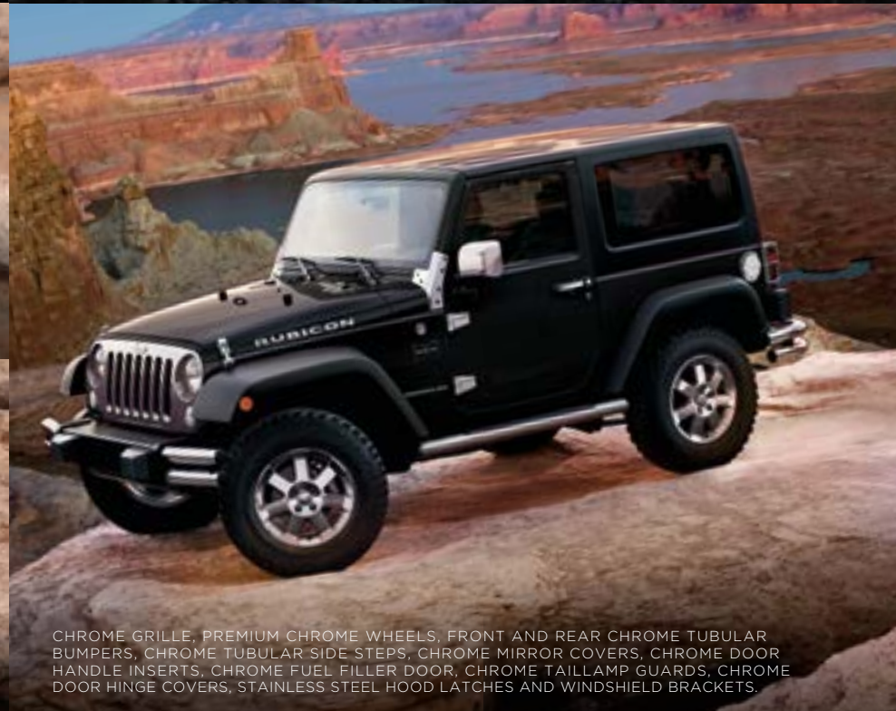
CHROME GRILLE, PREMIUM CHROME WHEELS, FRONT AND REAR CHROME TUBULAR BUMPERS, CHROME TUBULAR SIDE STEPS, CHROME MIRROR COVERS, CHROME DOOR HANDLE INSERTS, CHROME FUEL FILLER DOOR, CHROME TAILLAMP GUARDS, CHROME DOOR HINGE COVERS, STAINLESS STEEL HOOD LATCHES AND WINDSHIELD BRACKETS.