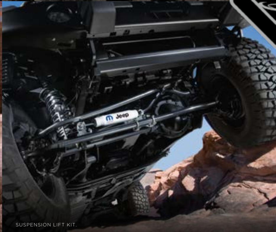
SUSPENSION LIFT KIT.