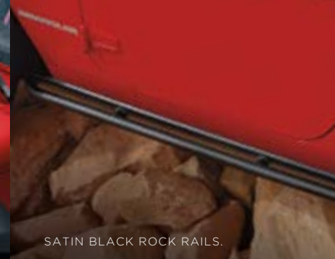
SATIN BLACK ROCK RAILS.