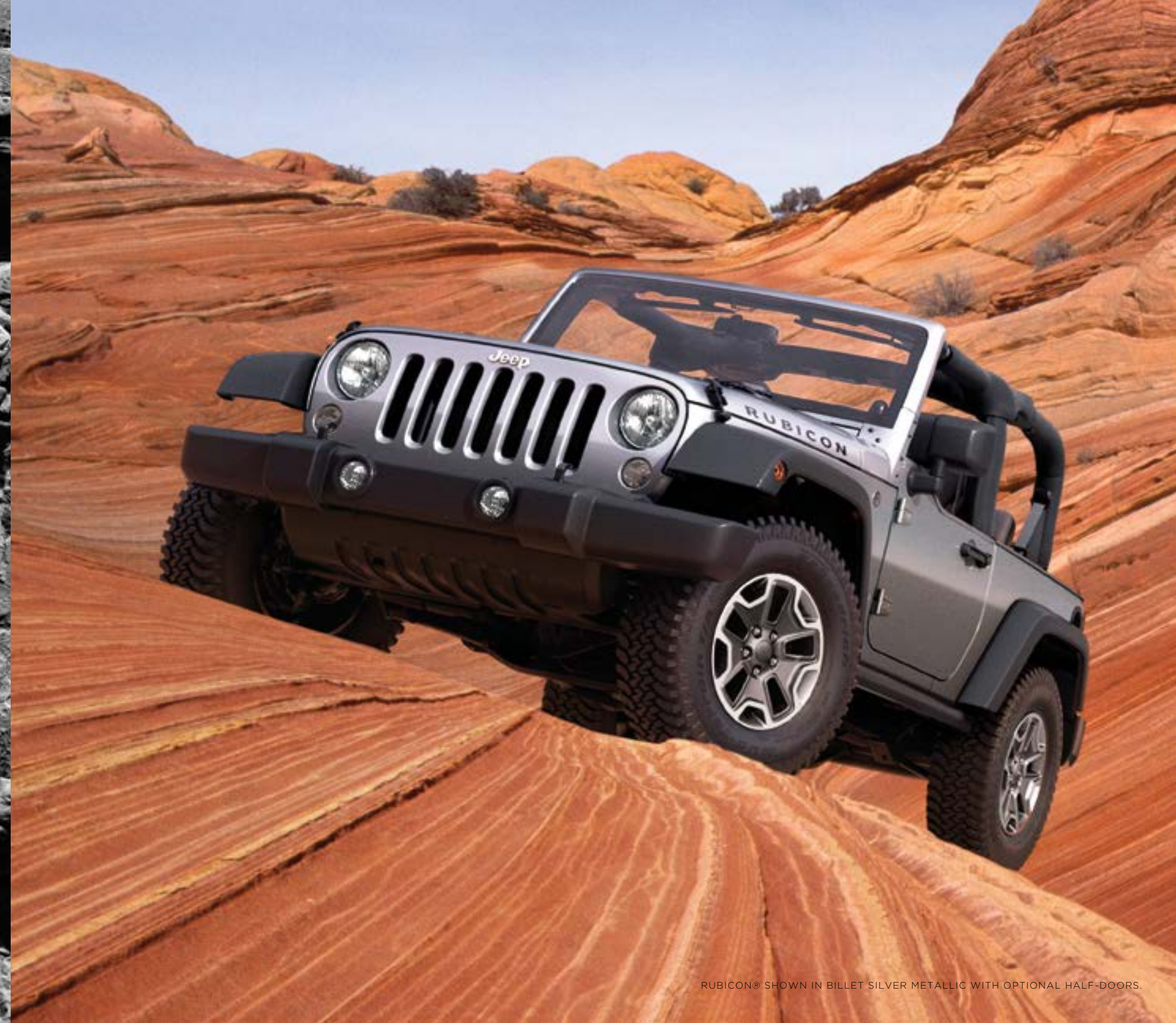
RUBICON® SHOWN IN BILLET SILVER METALLIC WITH OPTIONAL HALF-DOORS.

CONNECT WITH THE WORLD FROM THE GROUND UP. EXPLORE WITH THE UNIQUE CAPABILITY, COMFORT AND TECHNOLOGY OF JEEP® WRANGLER AND ENJOY A REVEALING POINT OF VIEW.