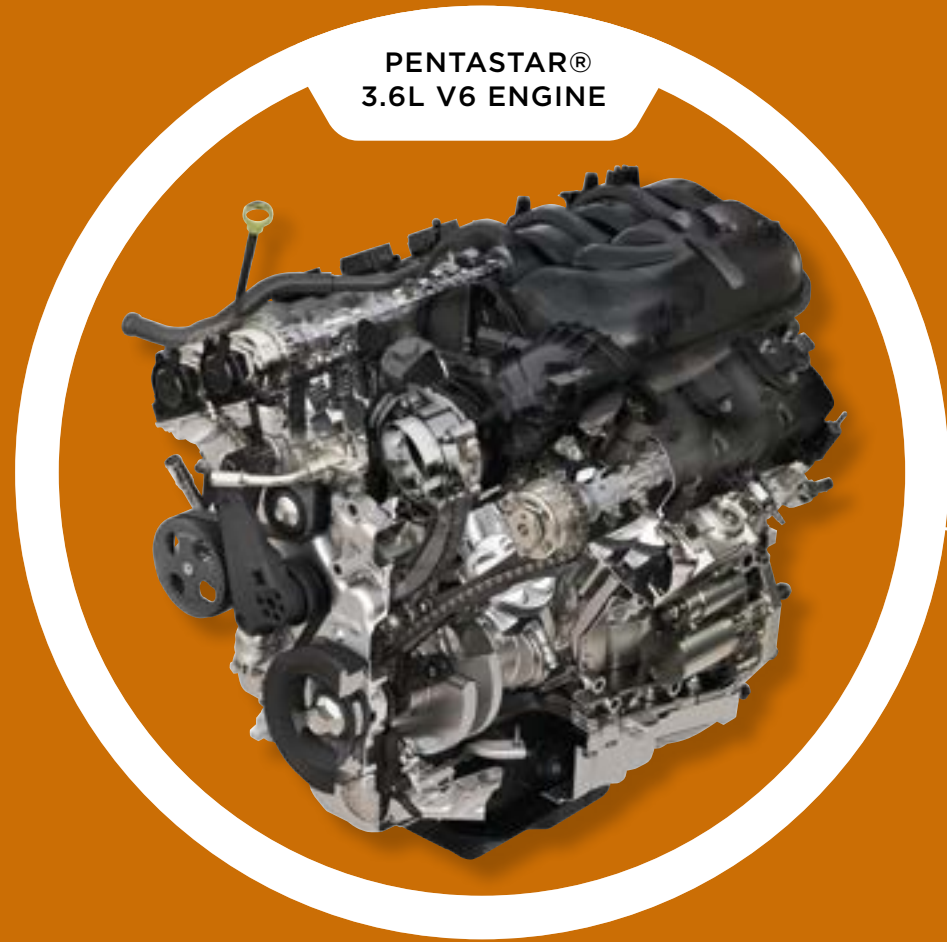
PENTASTAR® 3.6L V6 ENGINE