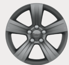
17-inch Mineral Gray Aluminum (standard)

SMOKER'S GROUP: Removable ashtray and lighter element