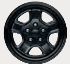
16-inch Black Steel (available)