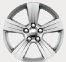
17-inch Tech Silver Aluminum (available)