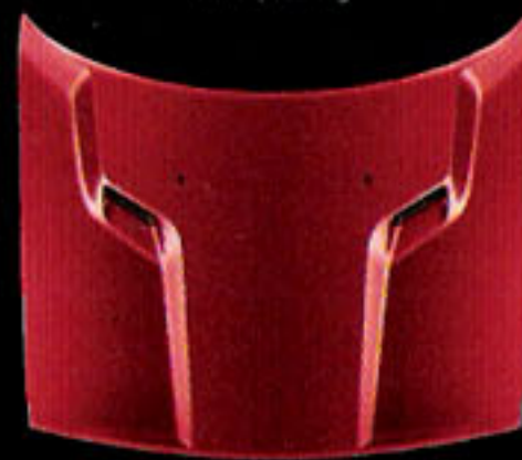
Inferno Red Crystal Pearl