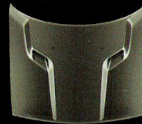
Dark Titanium Metallic