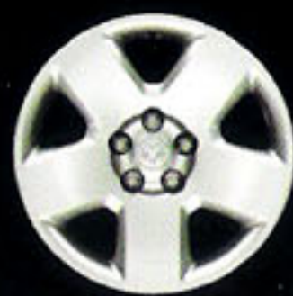
17" Wheel Cover Std. SE