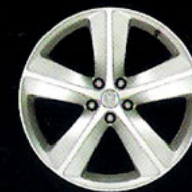
20" SRT Forged Aluminum Std. on SRT8®