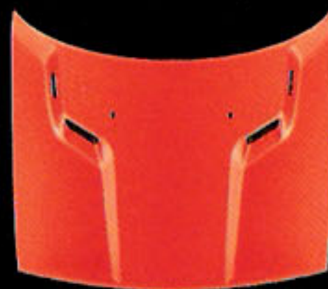
Hemi Orange R/T only

*Limited availability. †Since the time of printing, some of the information you'll find in this brochure may have been updated. Specifications and all competitive comparisons are as accurate as known at the time this publication was approved for printing.