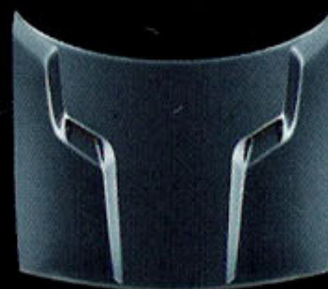
Deep Water Blue