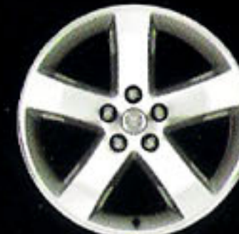
18" Cast Aluminum Std. R/T, Opt. SE