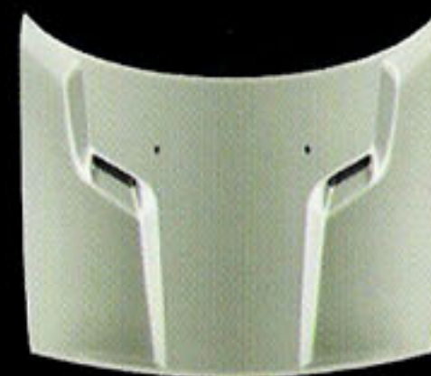
Bright Silver Metallic