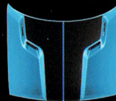
B5 Blue Late availability