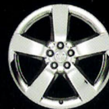
20" Chrome-clad Cast Aluminum Opt. R/T