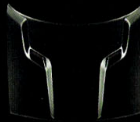
Brilliant Black Crystal Pearl