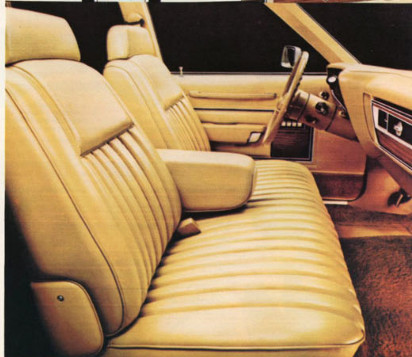
LeBaron Town & Country Wagon. Upward Mobility.