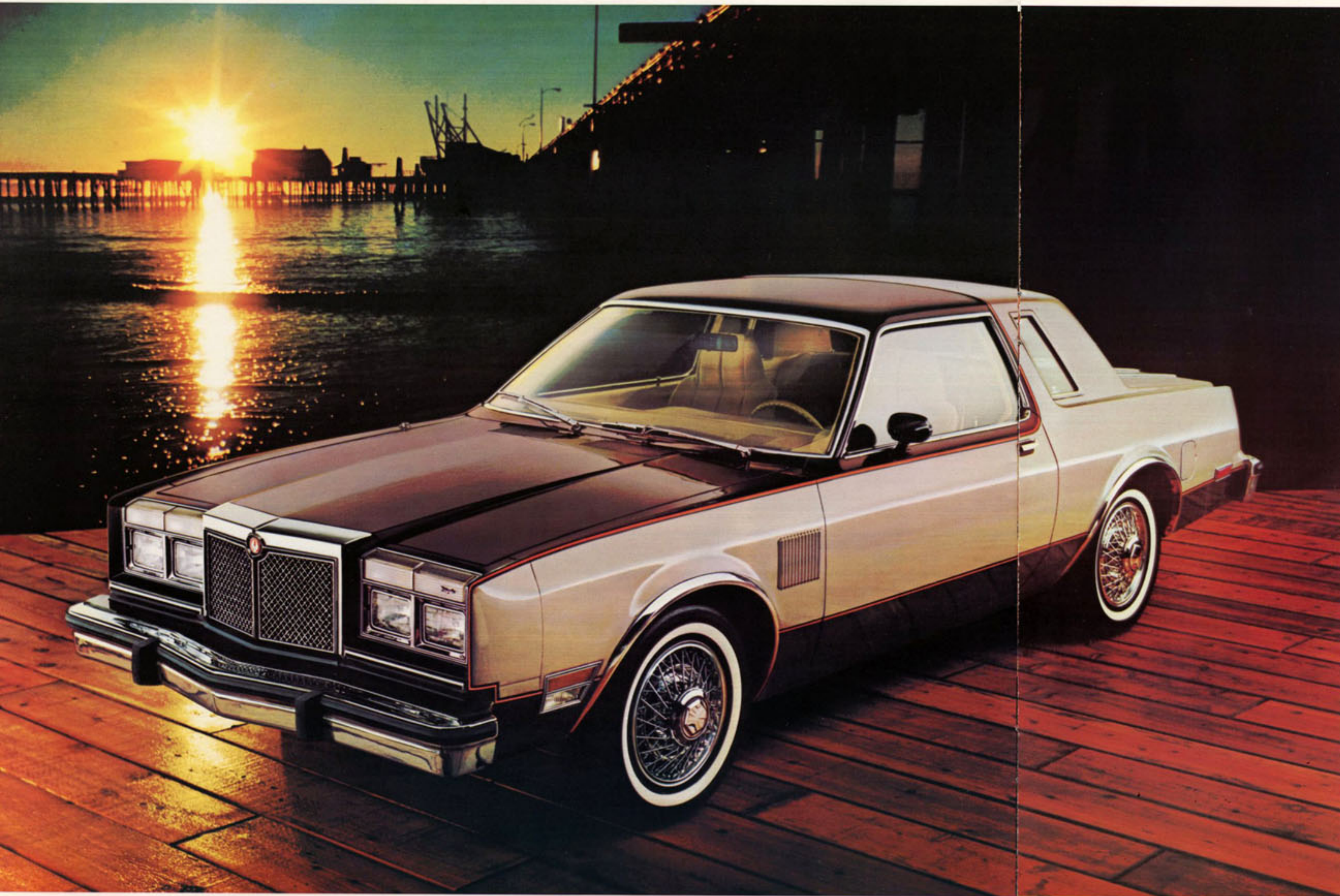
LeBaron Salon Two-Door LS Limited. The Classic Coupe.

They say you can't improve on perfection, but the LeBaron Salon two-door with the LS Limited Coupe Package may be the exception to that rule.