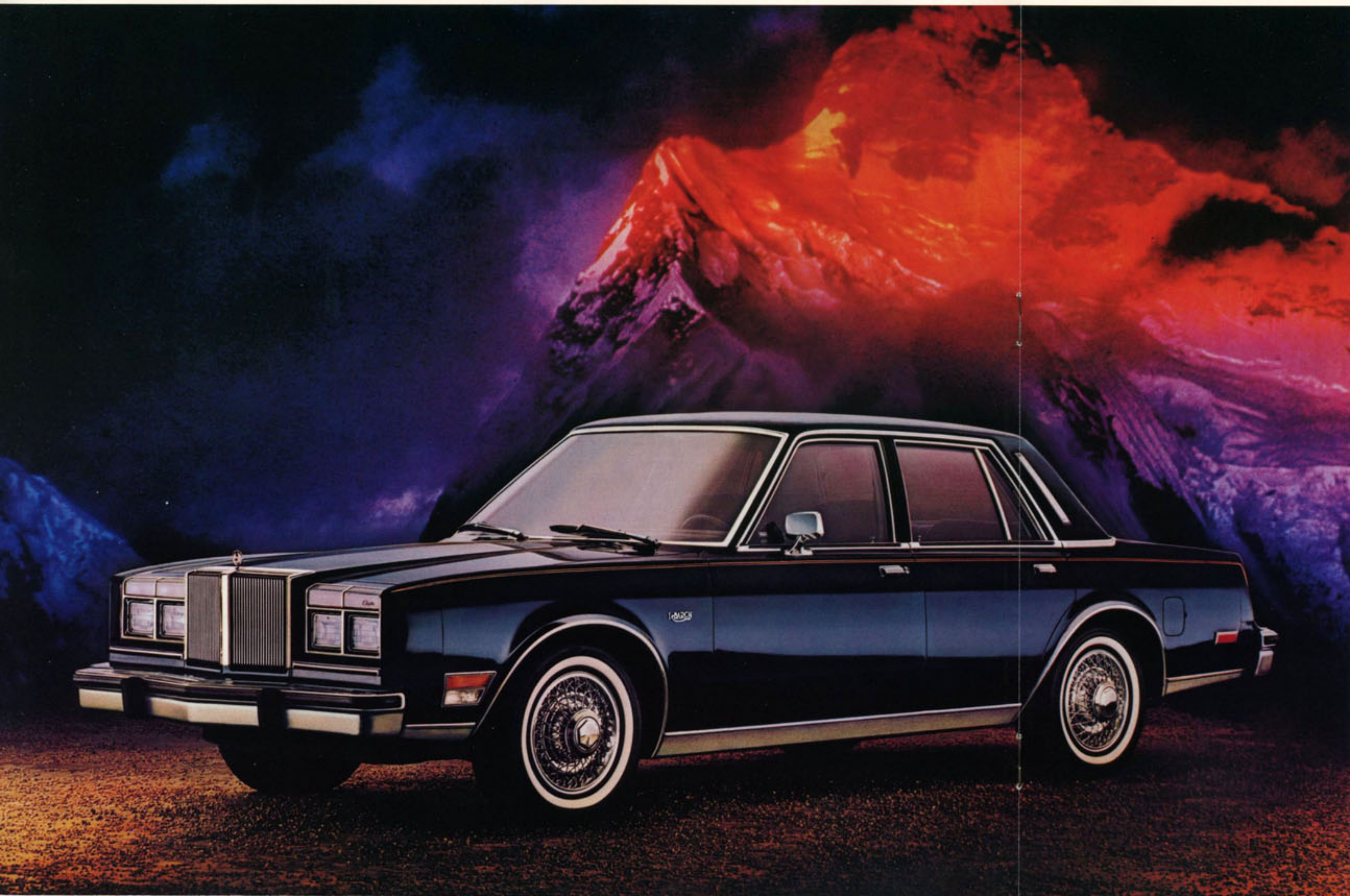
LeBaron Four-Door Medallion. Life at the Top.

Now that you've seen the LeBaron Salon and LeBaron LS Limited, we introduce you to LeBaron Medallion. Our top of the line.