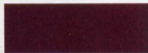
Morocco Red (with white convertible top)