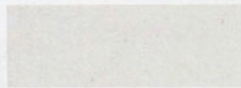
Pearl White (with white convertible top)

Plus: Your Dodge 400 convertible also includes these standard features: