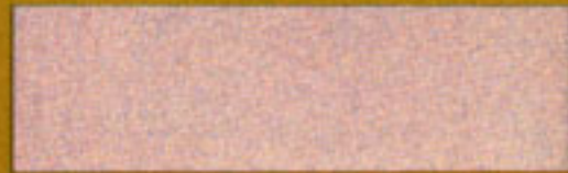
Radiant Silver Crystal Coat