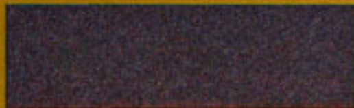
Gunmetal Blue Pearl Coat*