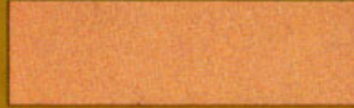
Beige Crystal Coat