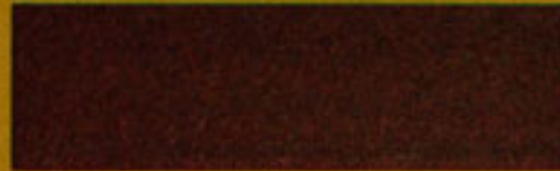
Mink Brown Pearl Coat*