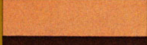
Beige Crystal Coat/ Mink Brown Pearl Coat*