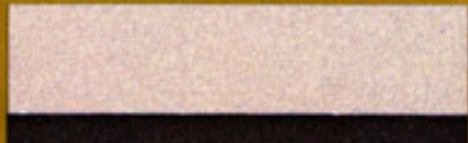
Radiant Silver Crystal Coat/ Gunmetal Blue Pearl Coat*