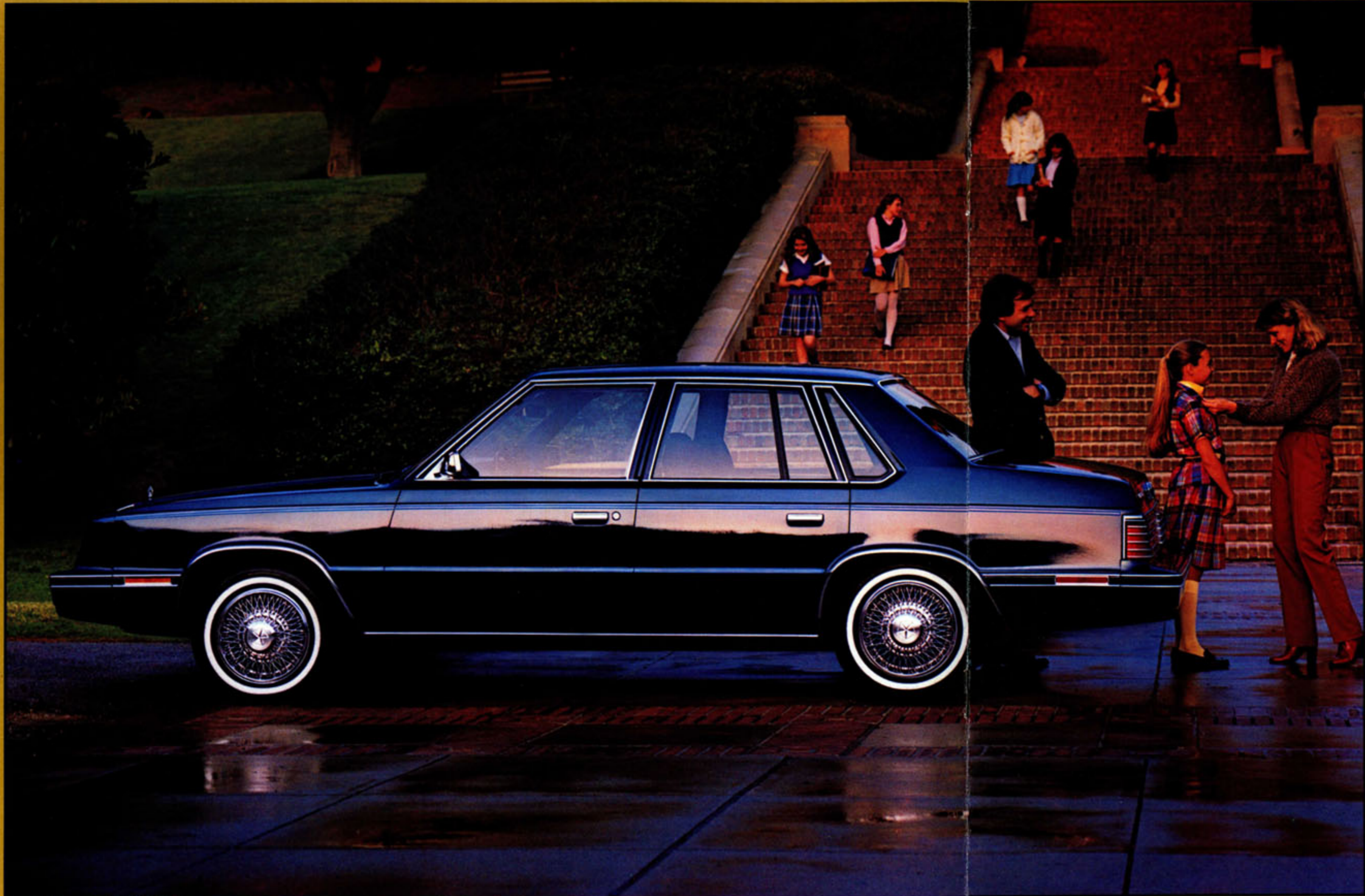
Chrysler E Class shown in Nightwatch Blue.