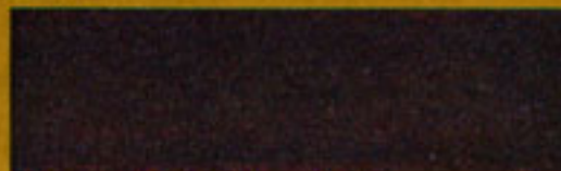
Charcoal Gray Clear Coat