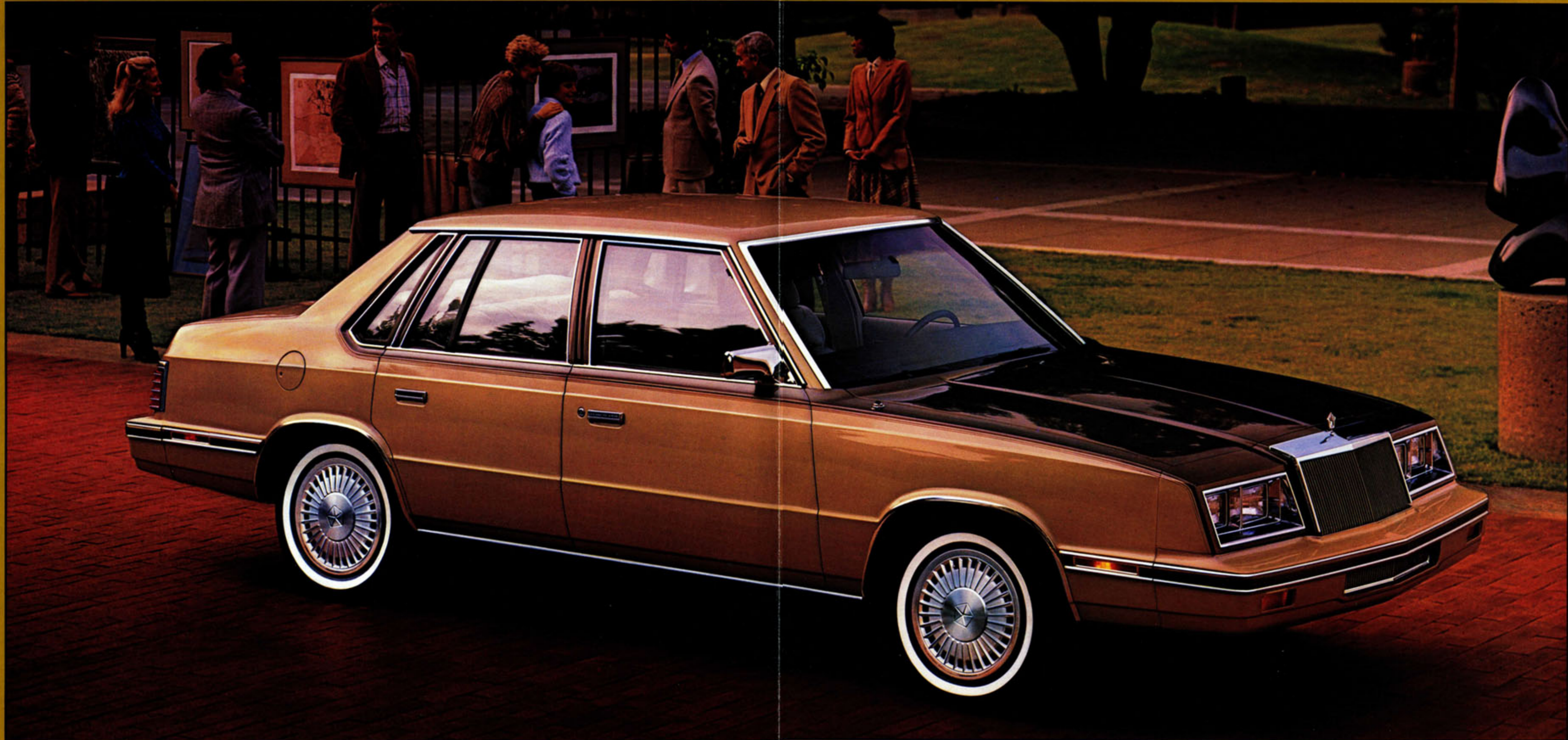
Chrysler E Class shown in Mink Brown Pearl Coat/Beige Crystal Coat two-tone.