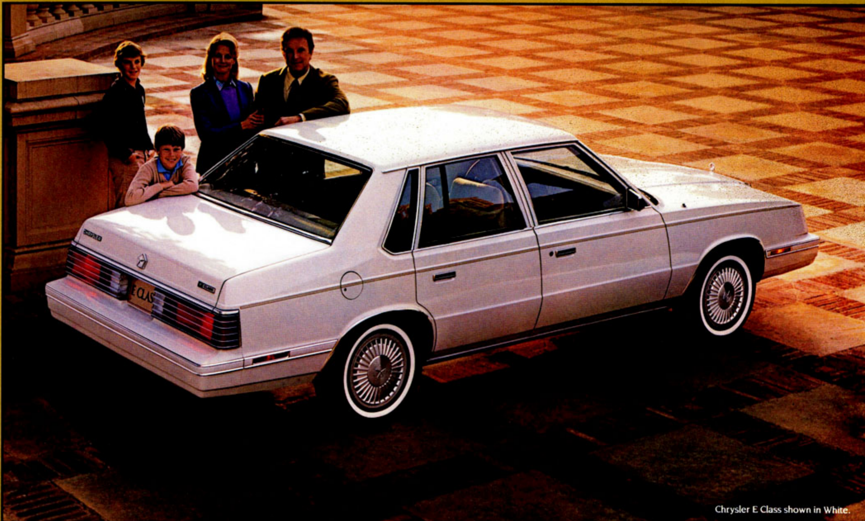
Chrysler E Class shown in White.