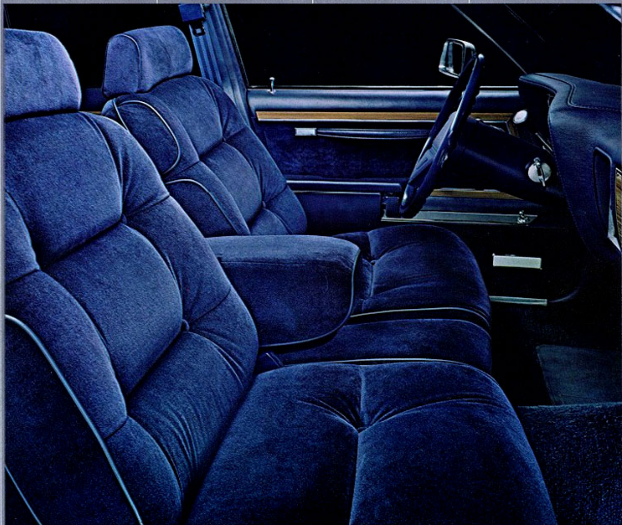
Diplomat SE standard 60/40 cloth-and-vinyl bench seat, shown in Dark Blue.

combination of comfort, quality and elegant good looks, the SE features a rich interior that pampers you with such features as a luxury steering wheel and electronically tuned radio with built-in digital clock—both new for 1984. Also very affordable is the Diplomat Salon. The Salon